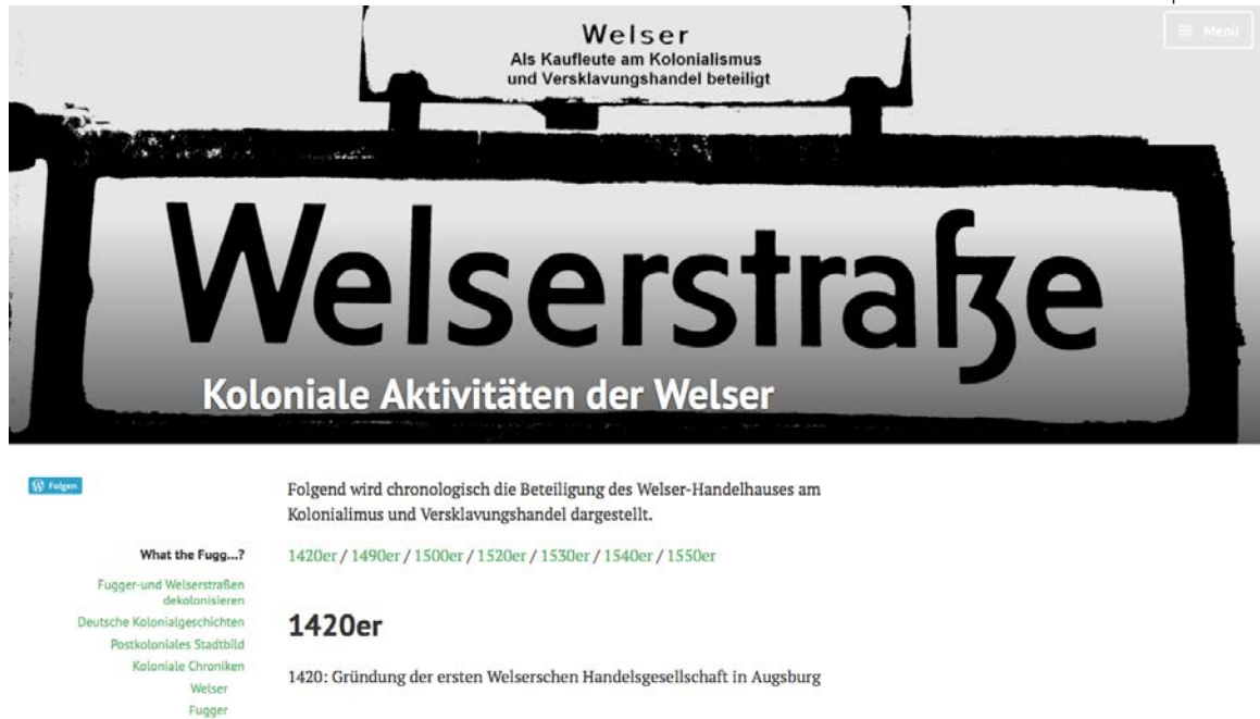
Fig. 8 Screenshot from the website: Fugger-und-Welsersraeften.decolonisieren!