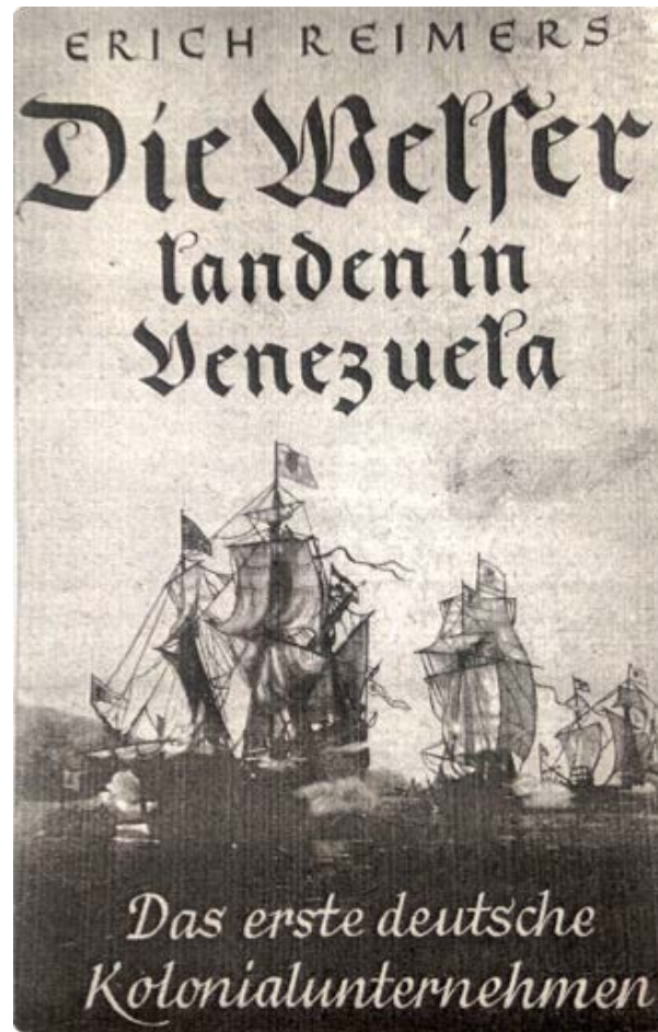
Fig. 4 Book Cover: Erich Reimers’ Die Welser landen in Venezuela. Das erste deutsche Kolonialunternehmen.

The colonial anxieties manifested in this narrative emphasize the power of the German empire and its leader as being recognized by the Spanish, Flemish, Burgundians, Croatians, Greeks, and Italians. The “brown Arabs” and “black Ethiopians” represent colonial subjects who also recognize the superiority of the Empire.