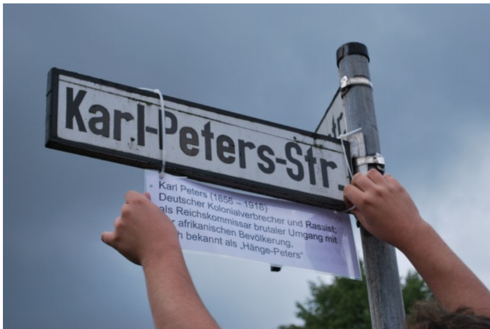
Fig. 9

Young Germans are reengaging with their colonial history, emphasizing a postcolonial turn that aims to critique, and, at the same time, inform the larger public about Germany’s colonial past. The project Freedom Roads: Koloniale Straßennames. postkoloniale Erinnerungskultur started by the Berlin Postkolonial group aims to take street names, or at times whole neighborhoods, named after German colonial figures and provide them with new context about the legacy of the German Empire. In Munich, “Von Trotha Street” was renamed Hererostrasse to commemorate the agents of the anti-colonial rebellion, rather than the commander of the German Schutztruppe, Lothar von Trotha, who was responsible for their genocide. In 2006, in Bielefeld, a group performed a recreation of the German colonial experience in East Africa at Karl-Peters Straße . Likewise, the project Afrika-Hamburg.de archived more than 5600 votes and compiled more than 800 responses from Hamburg’s citizens debating the future of the statue of German East Africa’s bloody governor Hermann von Wissmann. Between 200,000-300,000 people have walked by the monument and read the information about its historical context.