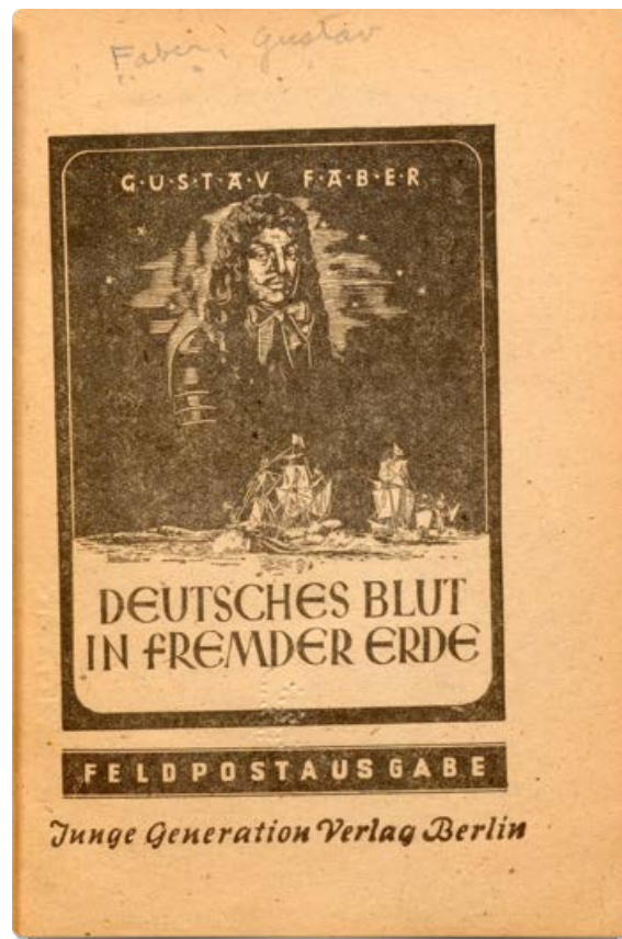
Fig. 6 Book Cover: Gustav Faber’s Deutsches Blut in Fremder Erde [German Blood in Foreign Lands] (Berlin: Junge Generation, 1944). Wartime edition.

Philipp von Hutten, as “great” German heroes who battle (and sometimes lose) against both “foreign” agents and native populations.