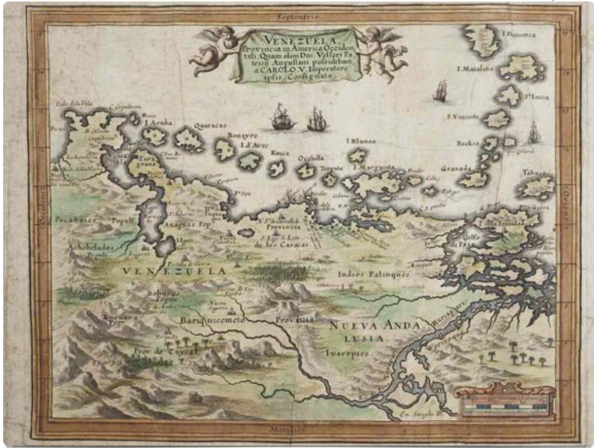
Fig. 2 Details from Genealogical Table of the Family von Welser , 1666, with engravings by Georg Strauch and Emanuel Stenglin.

As White acknowledges in his investigation of the philosophy of history and metahistory, history is not about the fight between “fact” and “fiction.” Rather, historians wish for the discourse of history “[to] be faithful to its referent” even though it has “inherited conventions of representation that produced meaning in excess of what it literally asserted” (51). This excess of meaning developed into the florid literary style that became part of nineteenth-century positivist historiographical convention. To analyze this “literary excess” in the context of historical narrative, it is necessary to examine how both narrator, and the era in which the narrative was told, helped determine Welser-Venezuelan history in nineteenth-century Germany.