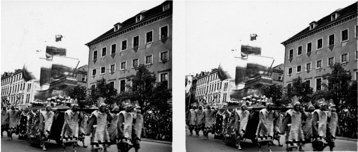
Fig. 5 Tag der Deutschen Kunst 10. Juli 1938 (Day of German Art July 10, 1938-Munich). The group picture depicts the Welser float. Stereograph photograph by Heinrich Hoffmann. (Courtesy of Art Resource/BPK Bildagentur, Bayerische Staatsbibliothek München Abtlg. Karten u. Bilder).

In short, the Nationalist Socialist version of the Welsers in the 1938 Tag der Deutschen Kunst was that they had succeeded where other nations had failed. It was through their capital that they were allowed access to the lucrative overseas market. The Venezuela possession became an icon for wealth in territories and labor. Here the human slaves whom they kept as servants are featured as part of the exotic menagerie that accompanies the Welsers, no different from their pets. In this orientalizing image of the Welsers, they are remembered for living a life of luxury and travel, carried on the backs of humble servants.