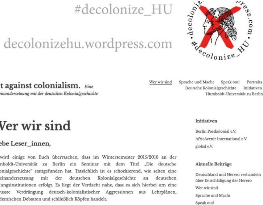
Fig. 10 From Decolonize HU’s website .