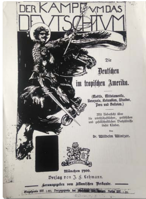
Fig. 3 Book Cover: Wilhelm Wintzer's Der Kampf um das Deutschtum: Die Deutschen im Tropischen Amerika [The Fight for Germanness: Germans in Tropical America]. München: Lehmann, 1900.