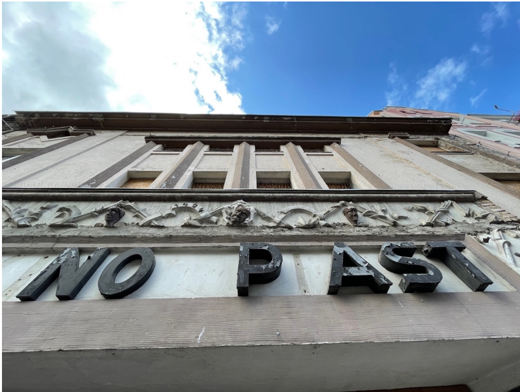
Figure 4: The former movie theater “Kino Piast” in Słubice. Photo taken by the author, July 2021.