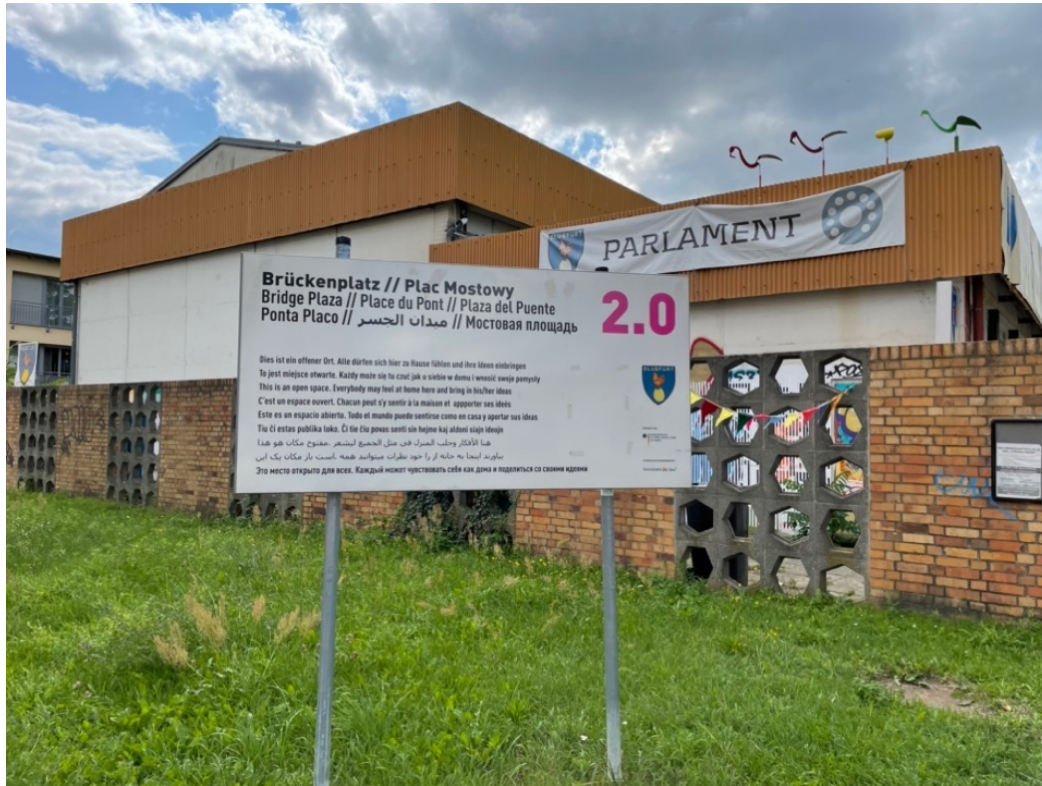
Figure 2. View of the Nowa Amerika grounds at “Brückenplatz/ Platz Mostowy” in Frankfurt (Oder). The multilingual sign reads: “Bridge Plaza 2.0. This is an open space. Everybody may feel at home here and bring in his/her ideas.” Photo taken by the author, July 2021.