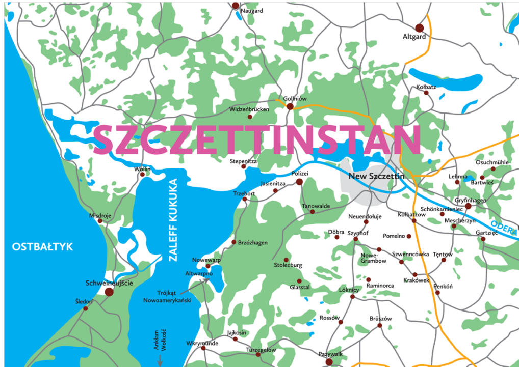
Figure 3. A map of “Szczettinstan,” one of the four regions of Nowa Amerika , created by Tomasz Stefański. Nowa Amerika: Ein Land dazwischen / Kraj pomiędzy , Slubfurt e.V., 2014, pp. 56-57. Reprinted with permission of Michael Kurzwelzy and Slubfurt e.V.

Instead, the conventional map has been turned by 90 degrees so that the Baltic Sea is alternately located in the western or the eastern part of the country. The southern-most tip, where Poland, the Czech Republic, and Germany meet, can now be found in the country’s eastern- or westernmost corner (depending on which map one consults). In Nowa Amerika , the rivers Oder and Neisse thus flow from east to west or from west to east, respectively. The map below shows “Szczettinstan,” one of Nowa Amerika ’s four states, and it illustrates a section of this reimagined geography (Fig. 3).