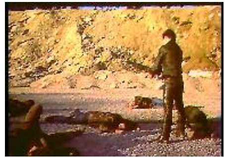
Andrea avenges my death and shoots the villain