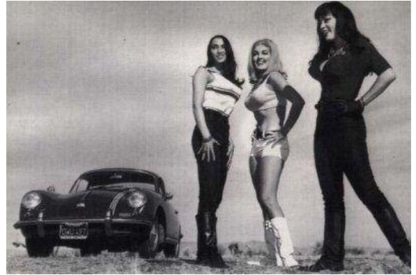
Russ Meyer: Faster,Pussycat, Kill,Kill!