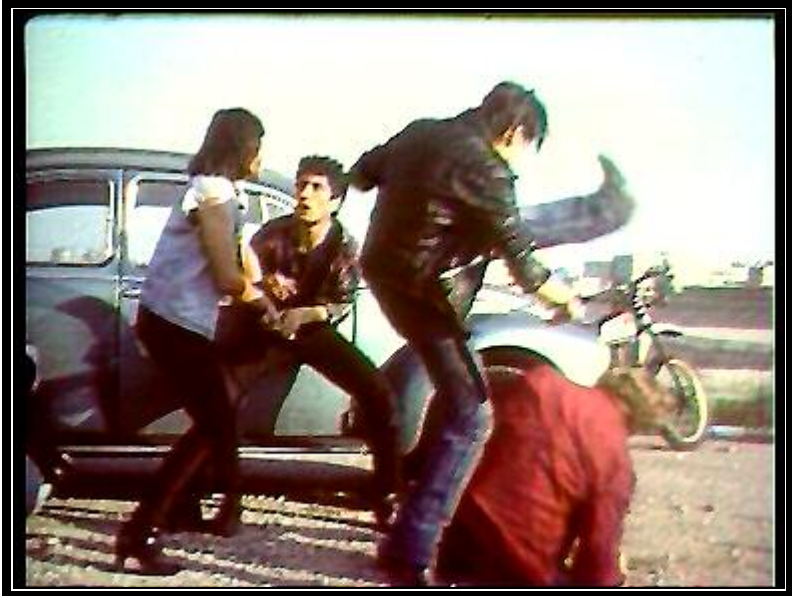
Screenshots from the untitled film

It is impossible to reconstruct the story of the film. The film has no sound because the only films we could steal were silent S-8 cassettes. Only the fighting scenes were shot, and these consist of showing a gang of three girls including myself trying to clumsily beat up every male they can get hold of.