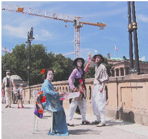
The Japanese theater troupe Lasenkan in Berlin

A local Japanese tycoon envisioned the park in the late eighties, at a time when a number of such ethno-themed parks—known in Japanese as gaikoku mura (foreign villages)—were being built. Period parks like Edo Wonderland in Hokkaido (tagline: “the essence of Japan”) are also popular tema paku destinations in Japan. There, tourists can visit the past and walk around in Edo-period costumes (and dress up like a samurai, wear a ninja costume, or perhaps dress up as a yuujo , 遊女, or “play woman”) for the day.