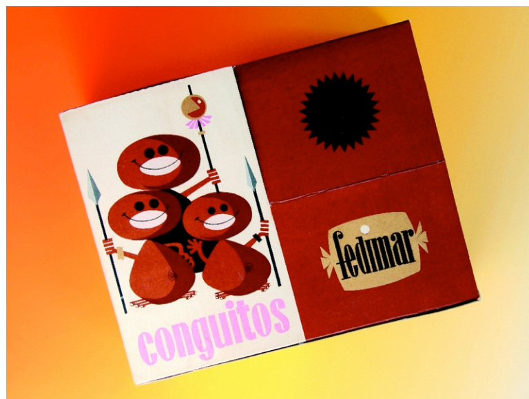
Figure 1. Conguitos logo

Even though Tudela Férrez naturally fixated on the Congo in choosing a name for the product because of its presence in the media, it would have been logical to actually focus his attention on Equatorial Guinea for a number of other reasons. While the Congo was a former colony of Belgium whose natural resources included uranium, cobalt, and diamonds, it was in fact Equatorial Guinea which was a colony of Spain and which actually produced cocoa prior to its independence in 1968 (N’gom and Ugarte 109). Given that the Spanish government subsidized cocoa production in Equatorial Guinea after the Spanish Civil War (109), it was clearly in Spain’s interest as an autarky to increase Spanish consumption of, and consequently advertising for, cocoa-related products. Thus, the Conguito could serve as an alter ego for the Spanish African colonial subject from Equatorial Guinea. 4 Moreover, given that imperialist nostalgia may be the strongest precisely when an empire is most in decline, the end of Belgium’s colonial rule in the Congo could open the door to discussions about Spain’s colonial past, present and future.