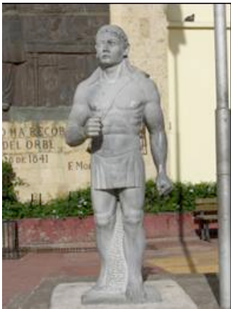
Statue of Lempira at the Congressional Plaza, Tegucigalpa, Honduras

Before the late nineteenth century’s construction of an official history, Lempira and the Lenca rebellion he led in the sixteenth century were largely unknown. Using archival documentation, the historian Martínez-Castillo indicates that all of the conquistadors of Honduras who lived in the 1530s and 1540s—whether it be in official reports, letters directed to the King or to the Council of the Indies in Seville, or other forms of documentation in which they narrated how they served the