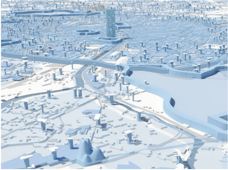
Figure 1: MVRDV's reimagining of Paris. The highways slink diagonally through the frame, connecting the suburbs.