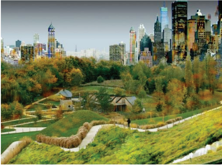
Figure 5: Roland Castro's lush park in La Courneuve.