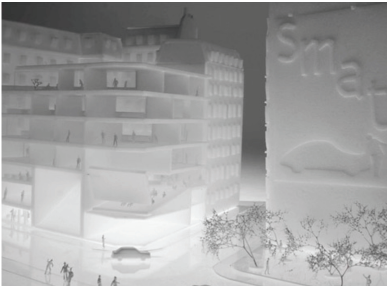
Figure 6: AUC's new façade for deteriorated buildings in the periphery.