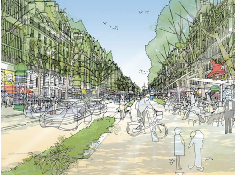
Figure 3: Richard Rogers' rendering of a boulevard through the banlieue.