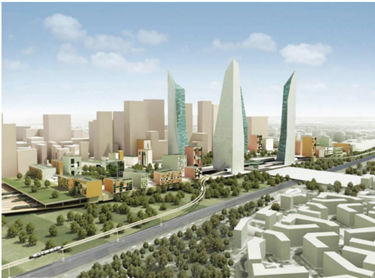
Figure 2: Atelier Portzmanac's rendering of the banlieue, with an elevated, rapid train running through it.