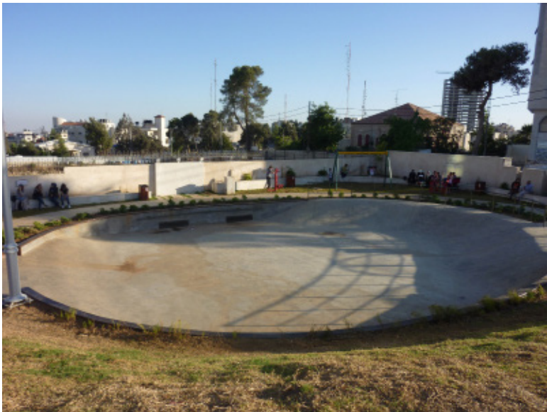
Empty skateboard field.