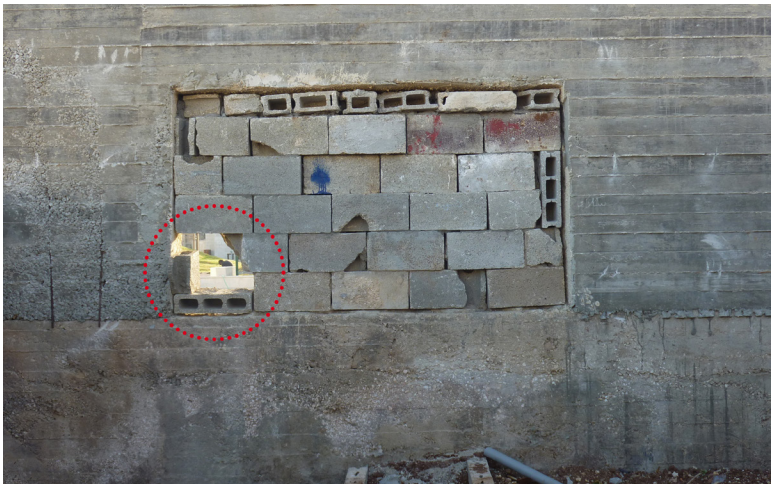
View of the closed window (hole) from Murad's backyard.

In response to my puzzlement about what this hole could do and what kind of accessibility it might give them, he showed me how they use this hole.