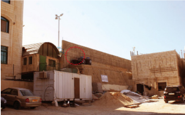
Back Image of the wall from Qadura refugee camp. The red dotted circle indicates where the final side entrance placement was approved.

The architect continued, “Even though the side entrance was accepted in the final Site Plan Design, the municipality did not request a design for the stairs behind the wall, despite the difference in land levels. The design of the park finished right at the borders of the wall.”