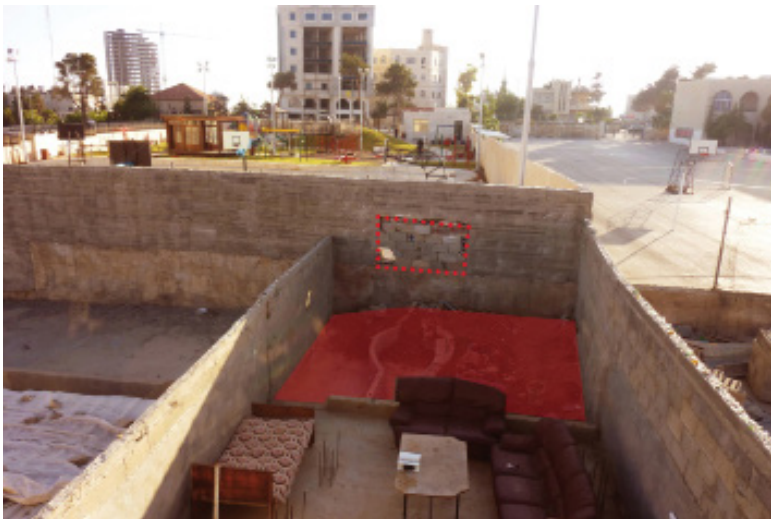
Red shadow showing violated property by the refugee family behind the wall, according to the municipality.