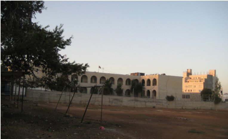
Images of the site prior to creating the Fitness Park, showing the previous football field and the public school nearby.