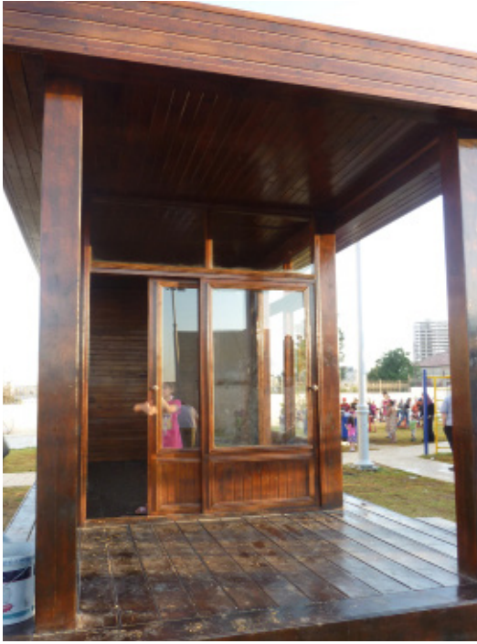
Wooden Pavilion is often empty.