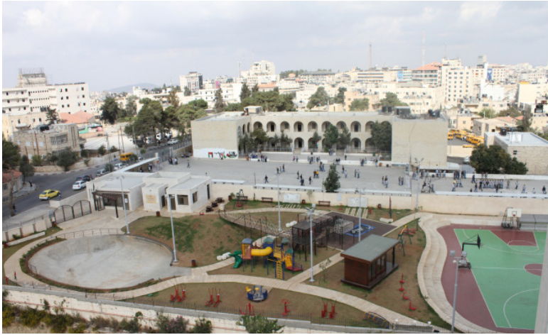
Yousef Qadura "Public Fitness Park," fully realized.