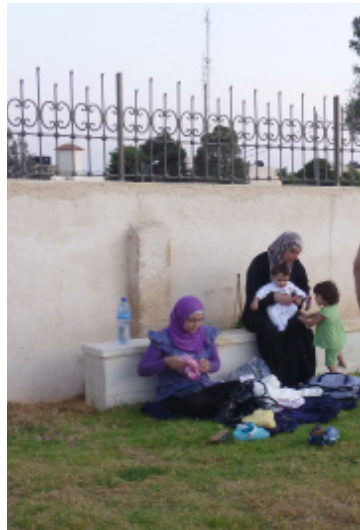
Kids are using those outdoor fitness machines as games. Mothers mostly come and sit, hardly anyone uses outdoor fitness machines.