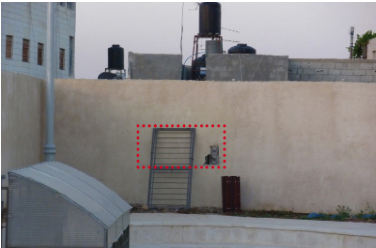
Image of the wall from inside the park (eastern border), the red dotted rectangle shows the former location of the window that I saw in my last visit in May 2011. (Iron frame was supposed to be placed on the window for protection).

Sometime in June 2011 the park was still closed. I noticed that the window had disappeared. Feeling perplexed, I asked the first man I saw about it. Murad said: "The municipality has closed it.... We struggled to keep it open but in the end the municipality insisted on closing it and even requested the assistance of policemen to close it."