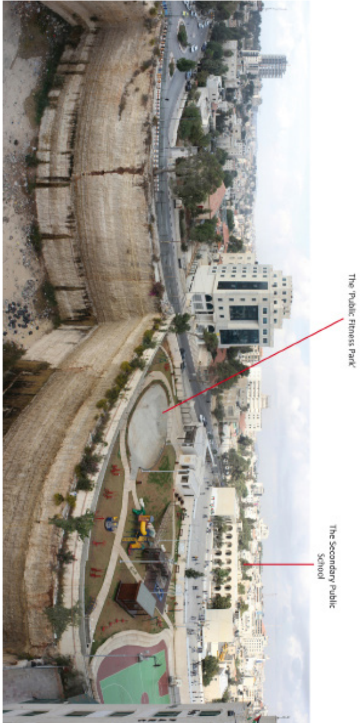
Location of Yousef Qadura Park, Ramallah's first "public fitness park."