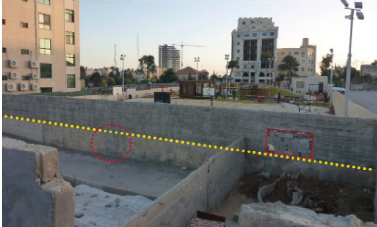
Image of the wall from the refugee camp. Dotted yellow line showing the previous height of wall (below) and the newly added one (above), as well red dotted circle showing traces of former entrance, and window (red dotted rectangle) from behind the wall, (window is from Murad's back yard).

After some conversation, Murad took me to his backyard behind the wall. He showed me traces of a previous entrance and window to the park and explained what had happened.