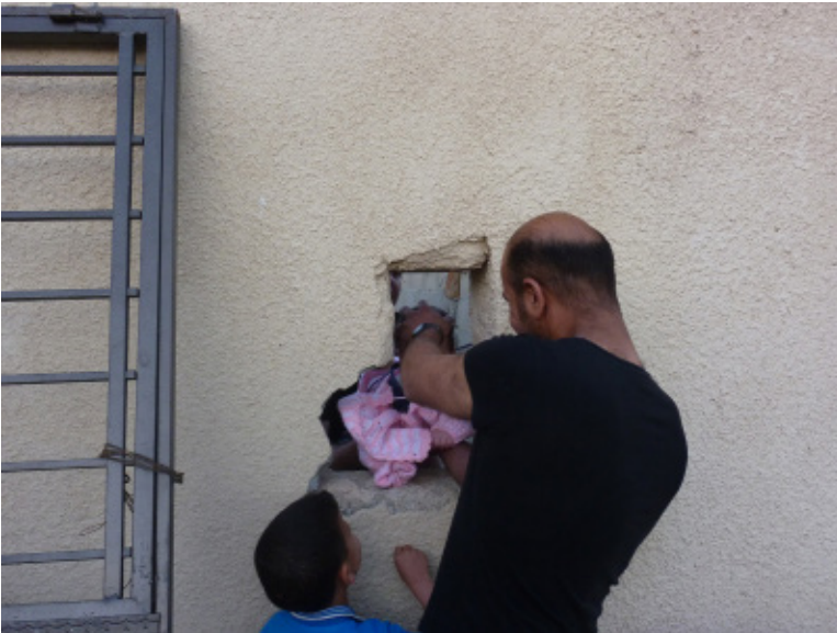
From the public park to the refugee camp.