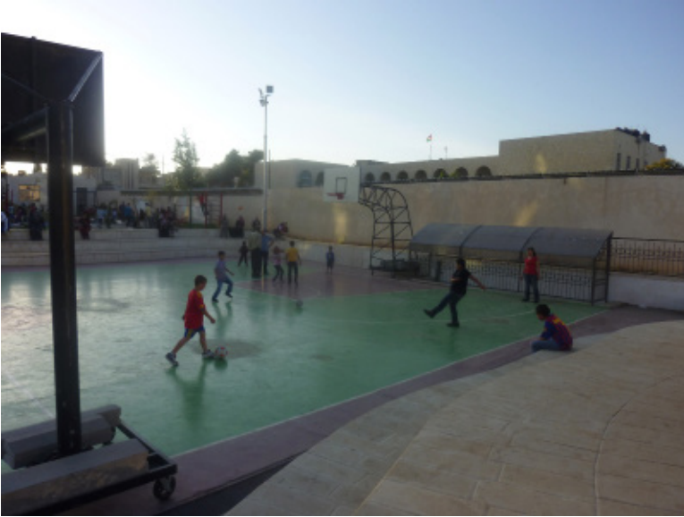
Soccer in the basketball field.