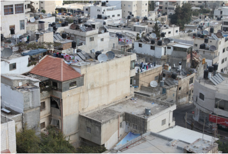
View of Qadura Refugee Camp.