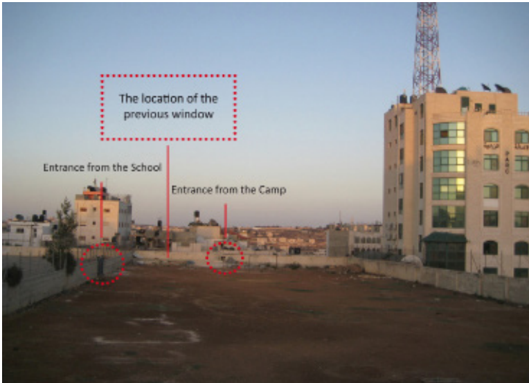
The previous entrances of the site.