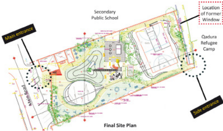
First and final site plans for Yousef Qadura Park.”