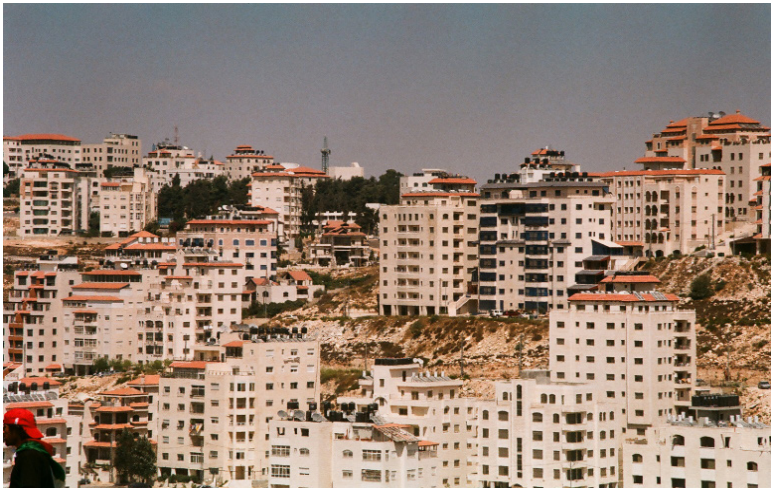
Ramallah recent multi-story buildings.

The values of Ramallah's inhabitants shifted from a focus on Sumud (resilience and steadfastness), in light of the oppressive Israeli occupation, to producing a globalized cosmopolis (Taraki 2008). The changes in zoning regulations, the rise in land prices, and the availability of housing loans and commercial building schemes had important social dimensions, especially in the deepening of residential segregation and the demarcation of more obvious status differentiation. Such social disparities are becoming more evident between the city and the refugee camps.