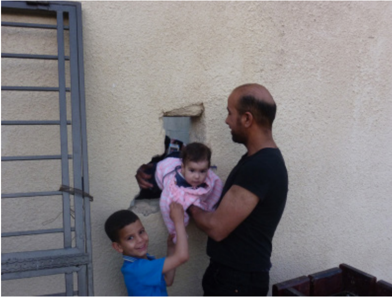
From the refugee camp to the public park.