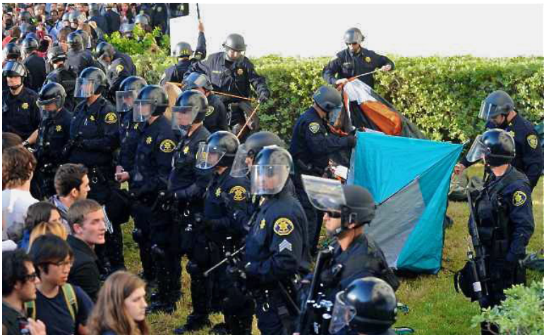
Student protesters used tents, a symbol of the Occupy Movement, to politicize and transform the space into Occupy Cal.

On November 9, a crowd of over 1,000 adopted the newly minted lexicon of occupation, set up tents on Sproul Plaza, and declared Occupy Cal underway. Suddenly, the university found itself in the company of financial hubs, civic centers, and parks and plazas the world over, when it too was re-appropriated by the sleeping bags and “mic checks” of the 99%. The Chancellor’s reaction was swift and brutal—riot police were called in from Oakland and Alameda County to break up the Sproul encampment, and they attacked students and faculty in several incidents throughout the day.