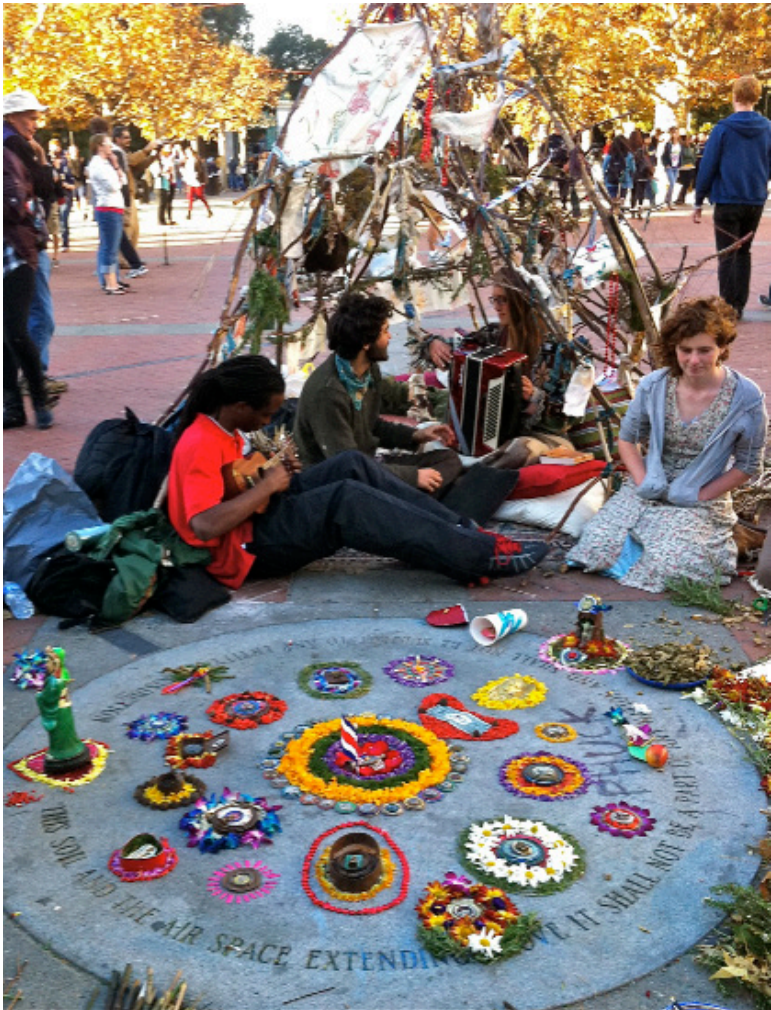
A stick tent constructed during the November 15 general strike to symbolize the fragility of the protesters.

At Wurster Hall, home to the College of Environmental Design, students of landscape architecture, city planning, and architecture embraced public space to speak this insurgent language, but infused it with particular levity. They could have remained holed up in the studio as the din of helicopters and sirens buzzed around, but instead, planners and landscape architects responded. While police wielded batons against their colleagues' bodies, Environmental Design students directed a message at their spirits, in the form of tents filled with helium balloons. It was an iconic way to summarize the new language of occupation and visibly demonstrate contested notions of public space: tents floating over the very site from which protesters had