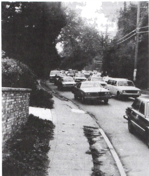
Figure 2. Inbound automobiles "doubling up" in a single lane of Tunnel Road, 8:15 A.M., on a Tuesday morning (view to the southeast from Tunnel Road near Oakridge).

California Department of Transportation, or CalTrans; the state agency would bear responsibility for any design changes.