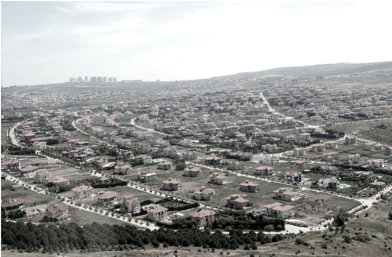
Figure 7.

Tepekent can be classified as a horizontal gated villa town, which consists of detached single-unit dwellings with a private garden built for upper- or upper-middle-class families with children. These gated villa towns use their horizontality to set up a more “people-friendly” settlement while regenerating lost social values with traditional or international patterns (Baycan-Levent and Gülümser 2007). In the Tepekent case, although the settlement is human scale, there are few shared public spaces, known locally as “social facilities.”