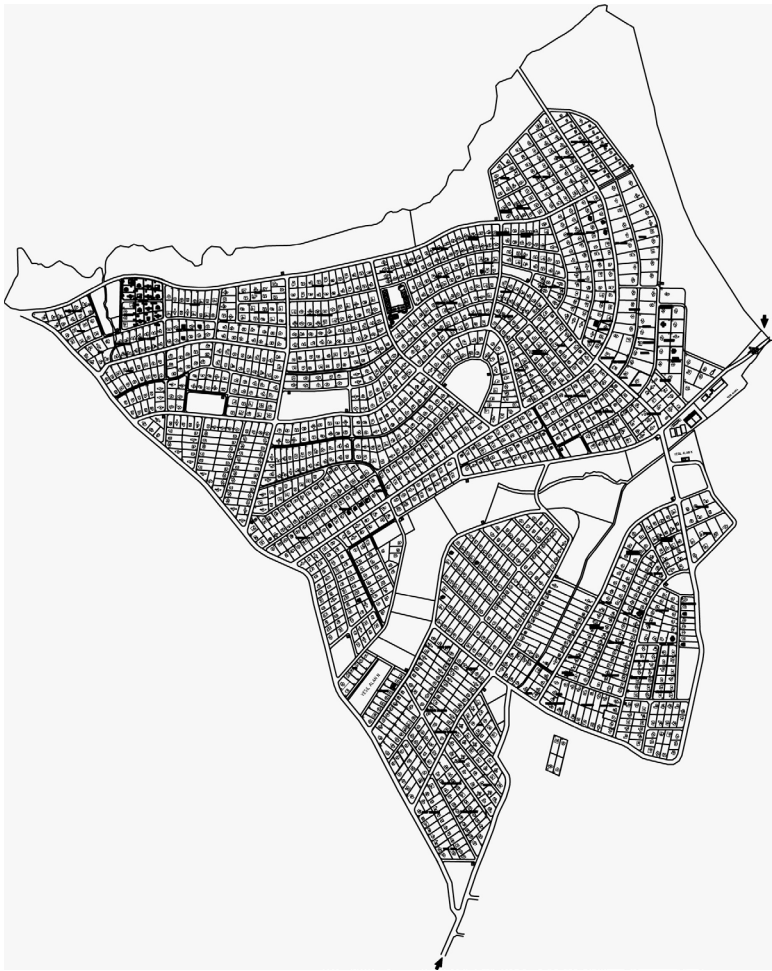
Figure 4. Tepekent site plan.

In addition to dense housing blocks, gated communities became popular in and around İstanbul as a new mode of urbanization in response to increasing housing demand in the 1980s. Gated communities, “physical private areas with restricted rules and prohibited access, where outsiders and insiders exist” are a product of the real estate market and threaten both natural and social sustainability (Baycan-Levent and Gülümser 2009).