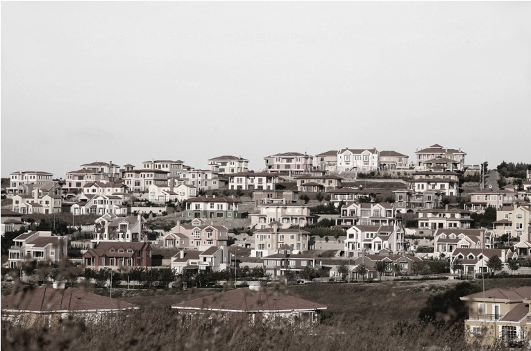
Figure 9.

Tepekent is the biggest gated community and the first “eco-city” project in Turkey, but this is somewhat of an empty title. Although it is situated in one of the main ecological corridors in İstanbul, the Büyükçekmece Lake Basin, industrial activity occurs in conservation zones, with groundwater being consumed at an unsustainable pace by the housing development and nearby factories (Ergen 2010).