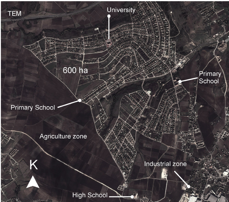
Figure 5. Aerial photograph courtesy of Tepekent Administration Public Affairs.

There are 980 people currently registered in this town; however, one can rarely see any inhabitants. From the empty window frames, one confronts a still-life architecture. Although the area was designed as a natural settlement, it is an ecological asset to the city only in terms of a small