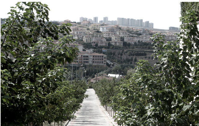
Figure 6.