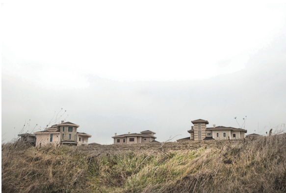
Figure 10. Author photo.