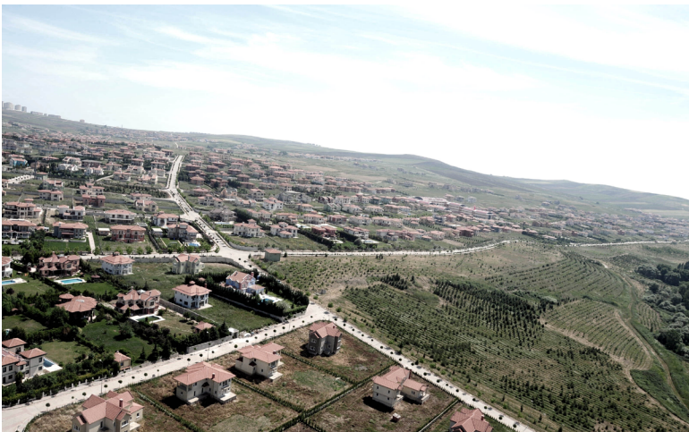
Figure 8. Aerial photograph courtesy of Tepekent Administration Public Affairs.