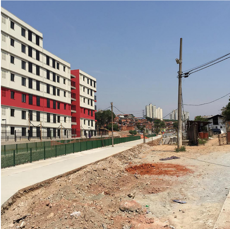
Figure 3 Clearance of the stream's margins in Favela do Sapé during the upgrading works. The stream runs between the green guardrails.

Figure 3 zooms into one of the former images. One can see an intermediate stage between 2005 and 2017 during which the works were still underway. The future street and a newly-established visual horizon that overlooks the upstream portion of the favela are already visible.