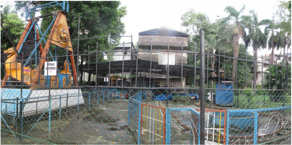
Figure 12 Mumbai park with over-provision of play equipment: 'too much' example

grounds were mostly used by boys between 12-24 years old. However, fewer female users were observed at these playgrounds.