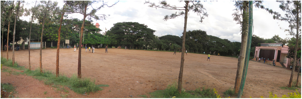
Figure 11 Playground in Bengaluru with a multipurpose stage