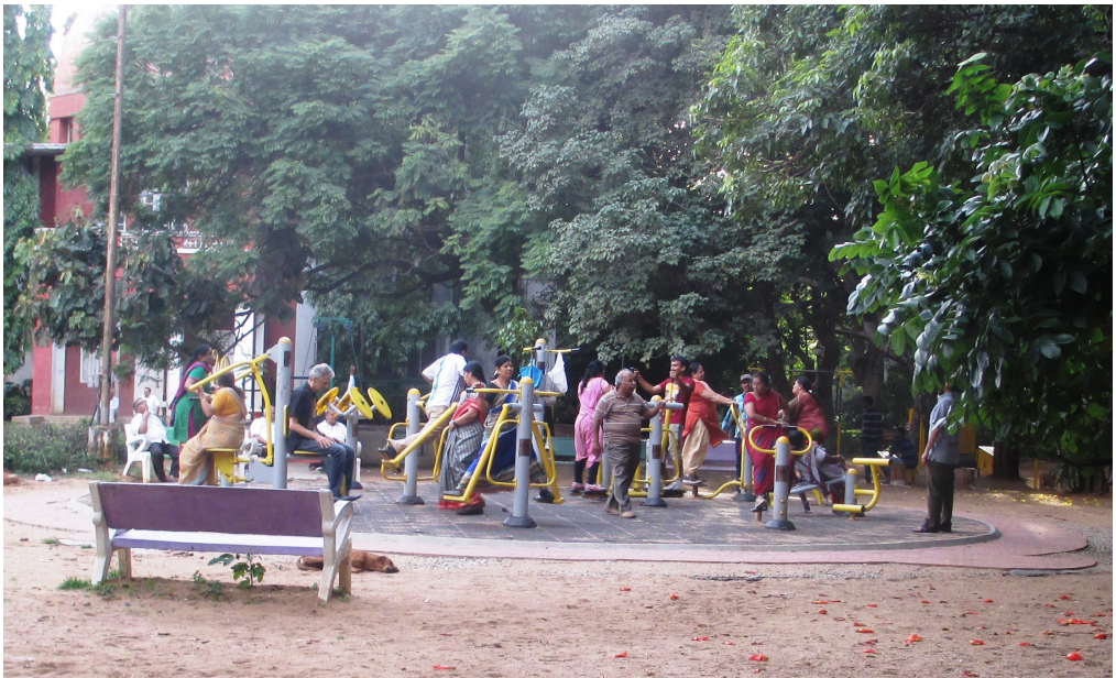
Figure 5 Open air gymnasium in a public park in Bengaluru

Design intervention entails the provision and placement of various furniture items and equipment, along with activity-specific surface treatments that are needed for recre-