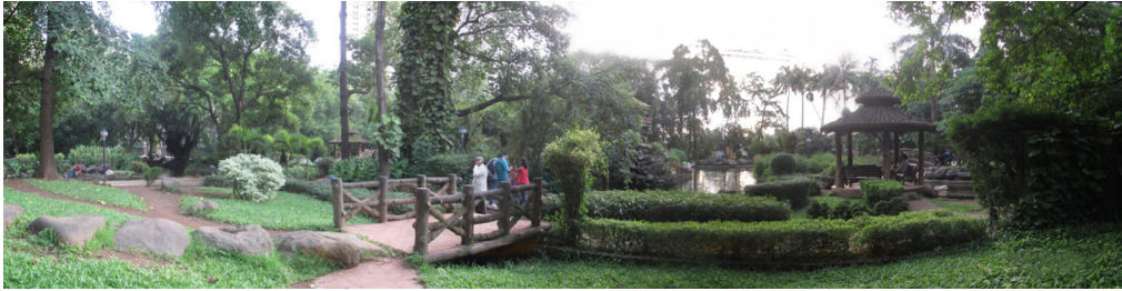
Figure 1 A 'good' park, well designed and well maintained

affordable housing, among other factors. Undeveloped or badly-maintained ROSs also fall prey to the private construction sector, which often encroach upon the open spaces for various illegally built projects.