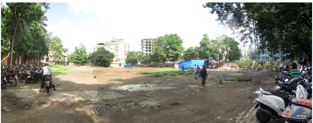
Figure 6 Mumbai playground with no boundary demarcation or signage, encroached upon by parked motorbikes and hawking