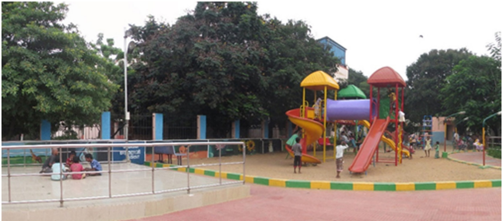
Figure 7 Chennai park with heavy surface treatment and a cramped play area

Over-provision was observed in Chennai ROSs that were excessively paved, leaving little earthen open space available (refer to figs. 7 and 9). Land surfaces were also concretized in many of the Chennai ROSs. The vegetation quality of Chennai ROSs