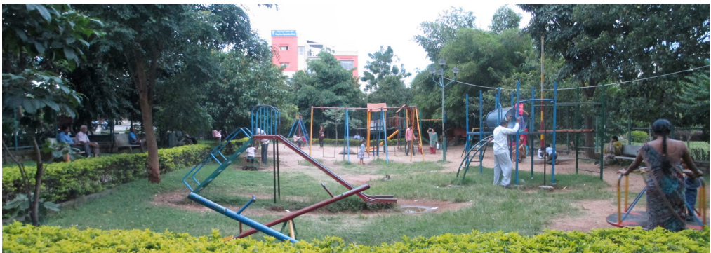
Figure 10 Bengaluru park integrating lawns and kids' play area

was also poor. In some of the Mumbai ROSs, furniture placement appeared to be ad hoc and little thought seemed to be given to surface treatments. These qualities lead to poorly performing parks. Also, the safety of users across multiple age groups was compromised by lack of maintenance and barriers to movement. Such poorly maintained open spaces led to gender disparities among users; females were greatly outnumbered by men. The presence of well-maintained vegetation, including trees, flowering plants, shrubs, and lawns, greatly improved the thermal comfort experienced by users (refer to fig. 10). In certain ROSs in Bengaluru, the presence of 'vague' spaces in the layout gave users the opportunity to devise play or recreational activities instead of using predetermined play furniture that catered to kids of certain age groups. More open-air gymnasiums were provided in Bengaluru parks, which facilitated greater activity among the elderly (refer to fig. 5).