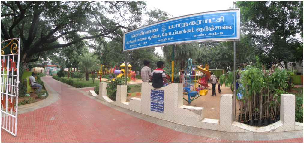
Figure 9 Chennai park with demarcated boundaries and prominent signage