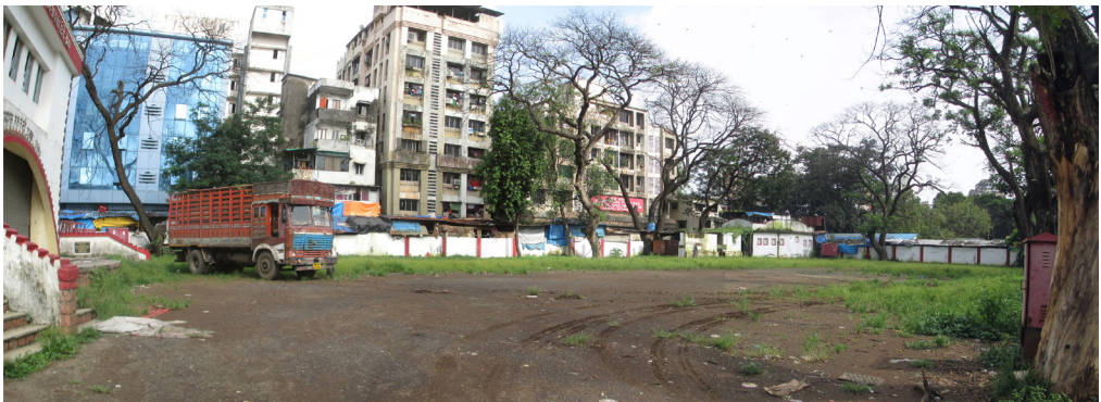
Figure 13 Mumbai playground with untreated surface, encroached upon by parking: ‘too little’ example

For ROSs in urban India, holistic design and development are of utmost importance. As illustrated in this study, a well-performing open space is achieved when the provision of materials, furniture, and amenities, along with the landscape design, are well balanced. When this balance is disturbed by over-provisioning of these features, the open space loses its recreational quality and openness (refer to fig. 12). Heavy usage of man-made materials also detracts from open spaces. ROSs aid in recharging the water table, ameliorating urban air quality, sustaining a balanced microclimate, and providing contact with nature in a dense urban context. When an ROS ceases to be ‘open’ due to over-modification and exploitation, it may become just another built-up space that is formalized to the extent of being defunct. On the other hand, when no design interventions are undertaken, the ROS may be susceptible to urban threats of encroachment and informality (refer to fig. 12). ‘Too much design,’ or overdoing the intervention, and ‘too little design,’ where there is a dearth of any intentional intervention, are both counterproductive to the performance of ROSs in urban India. An understanding of this dichotomy of design intervention in these ROSs is, thus, a precursor to envisioning a framework specific to the Indian context that is designed to achieve the 2030 Sustainable Development Goal of providing universal, accessible, and safe public open spaces for all.