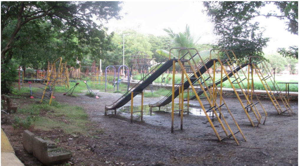
Figure 8 Mumbai park with defunct play area seating