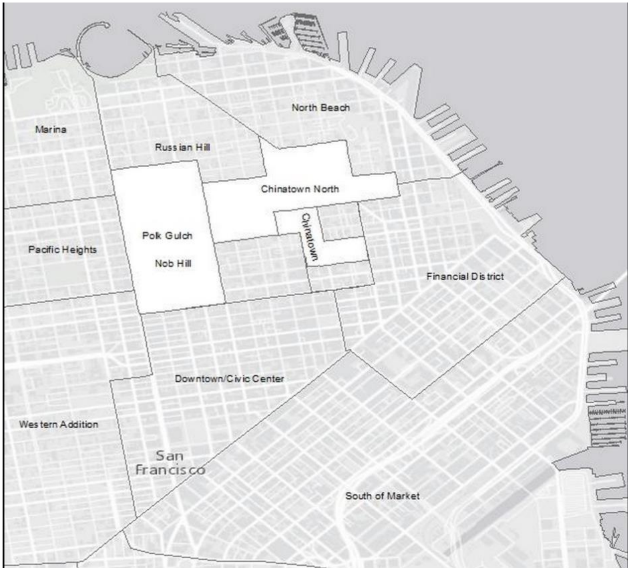
Figure 3. City of San Francisco's Chinatown

Image shows boundaries as described in Montojo, 2015. Montojo identifies that the boundaries for Chinatown have expanded beyond the city's "official" boundaries, and these boundaries show Chinatown's influence in the surrounding neighborhoods.