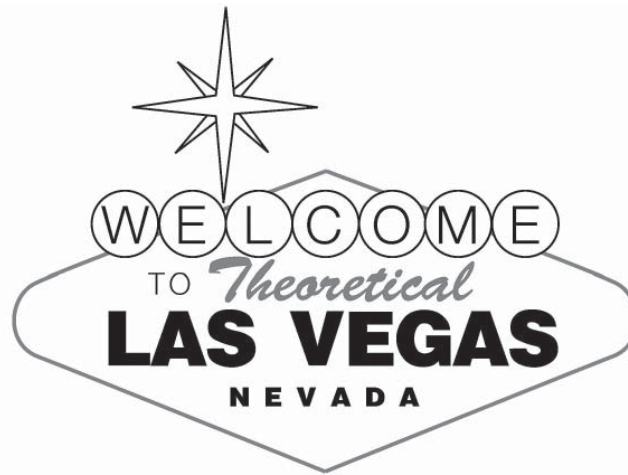
Figure 1. Title from author

Las Vegas, a city often theorized as the ultimate spectacular city, has a commensurate history of spectacular theories. This essay explores the connections between urban theory and spectacle through etymology, a brief history of the literature on Las Vegas, and an encounter between a Las Vegas urban planner and a theorist.