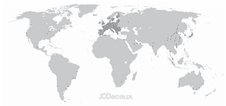
Figure 3. Author’s global map of JCDecaux contract cities based on information from JCDecaux websites.

While most of the holdings are held by a group of companies under the JCDecaux corporation, this fragmentation of legal corporate ownership does not extend to its corporate branding policy: the “JCDecaux” name is the most pervasive element of the business, emblazoned on every object it places in the public and not-so-public realms (Figure 3).