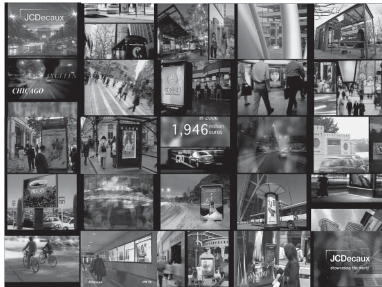
Figure 1. Clipped images from JCDecaux Japan website video

Jean Claude Decaux's claim to inventing street furniture is not his to make. What did happen in 1964 is that he lobbied the French government to allow his company to install bus shelters across France. He provides bus shelters as a "public service amenity" in return for control of their integrated advertising panels. As such, the JCDecaux brand has transcended into an indicator of globalization in both the "space of place" and the "space of flows." The company's ubiquity both mimics and drives the growing reach of a globalized cultural economy, in which corporate advertising imagery becomes the backdrop of urban life. Decaux's true contribution—a model of public-private partnership which calculates the demand of corporate advertising into accounting for transit service – is now part of decision-making processes which determine the level of service in neighborhoods around the globe.