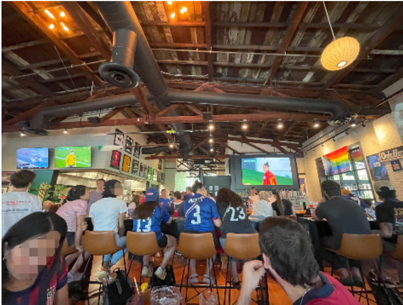
Figure 6 The interior of Rough & Tumble Sports Pub taken during the Women's World Cup

that attracts older gay men. 12 If Rough & Tumble were closer to her, she shared that she would visit more frequently because of its relaxed and social environment, which stands out from most queer spaces in Seattle she is familiar with. She has forged connections and made queer friends through her interactions at the pub.