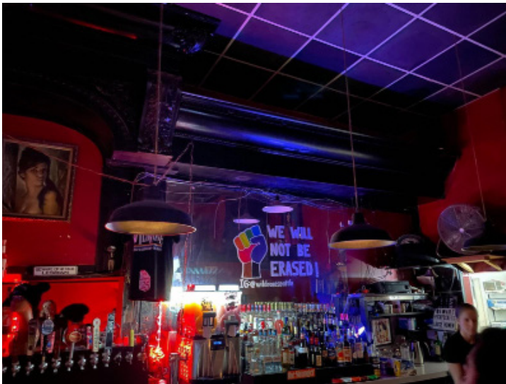
Figure 3 “We Will Not Be Erased” sign at The Wildrose

that the space is protective of its queerness and femaleness (see Fig. 4), the manifestation of this is in conflict as the bar reckons with what it means to be an inclusive queer space and a historic lesbian bar. Conversations and formal interviews offered more nuanced insight into The Wildrose, as did looking at oral histories. Within the latter, similar themes emerged in online reviews. Nonbinary interviewees spoke about feeling the erasure of their identities within The Wildrose and lesbian spaces in general, sharing that they were “constantly misgendered” or felt “pushback” against their nonbinary identity, noting that these patterns are a trend within lesbian crowds as a whole. However, others felt more welcomed within The Wildrose, with one person stating: “For trans women, it feels like a super important space to hang out with friends and not worry about being harassed by people” (Brownstone 2017). Ultimately, this calls into question the safety of an all-female space for individuals that actively push against rigid gender categorizations. This tension underscores the “tyranny of gendered space” that Doan (2010) notes as being in conflict with the realities of a gender spectrum. The deployment of the “penis police” as a form of exclusionary feminism (Earles 2019) prompts us to ask who holds authority to determine membership in a women’s space.