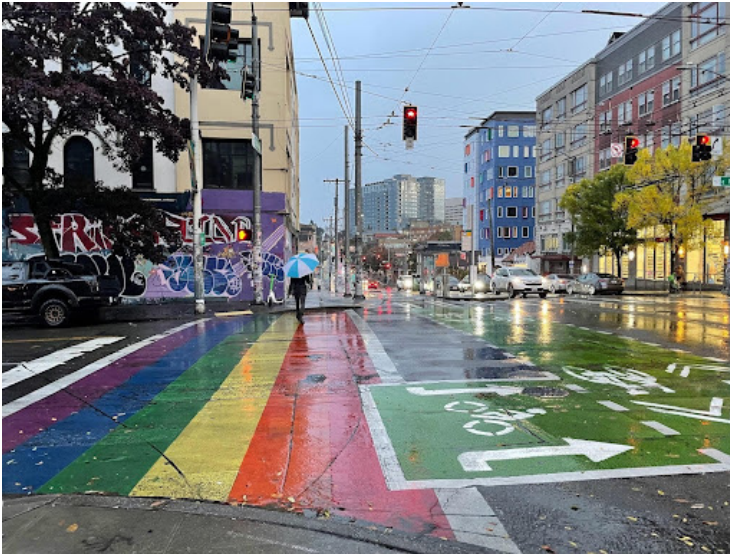
Figure 1 Rainbow street crossing in the Capitol Hill neighborhood