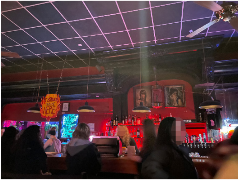
Figure 2 The interior of The Wildrose. The first three were taken on a Tuesday evening at 10:00 PM as most patrons socialized in the outside covered area. The last one was taken on more lively a Friday evening at 10:30 PM.

During the COVID-19 pandemic, The Wildrose faced the threat of permanent closure but managed to raise $89,824 through a GoFundMe campaign (GoFundMe n.d.), securing its survival. While it was not feasible for all patrons to contribute to the campaign, there was an overwhelming desire to secure the bar's survival. This is an indication of the impact the bar has on the local community, which can also be gleaned from reviews of The Wildrose posted on Google and Yelp. 8