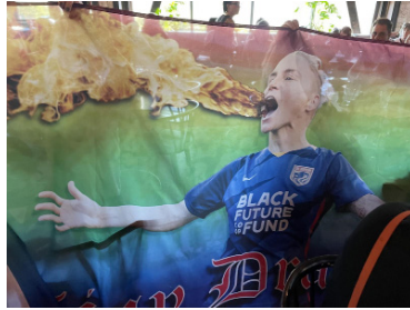
Figure 4 Rainbow pride flag featuring a player for Seattle's O.L. Reign soccer team

with enthusiasm as patrons cheered when Megan Rapinoe commercials celebrated the LGBTQIA+ community.