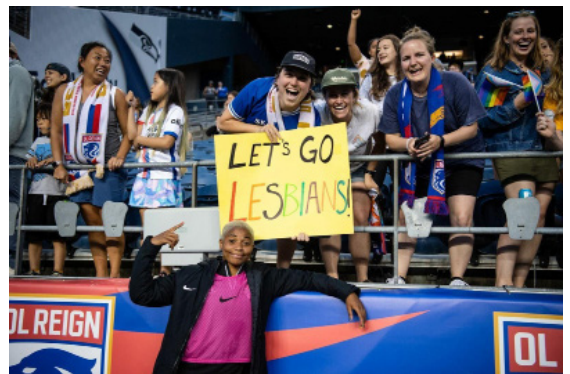
Figure 5 Reign Pride soccer game (EverOut n.d., O.L. Reign 2023)