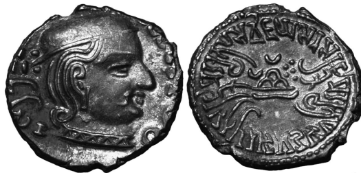
FIG 1: AR Karsapana of Vijayasena (c.238-250 CE), typical of mid-period Kshatrapa coins. Obverse: Head of king, right. Brahmi date (240 CE) in Saka era behind. Corrupt Greek-script legend, largely off-flan. Reverse: "Chaitya" emblem, surrounded by Brahmi-script legend: Rajno mahakshatrapasa damasenasaputrassa rajno mahakshatrapasa vijayasenasa

The Kshatrapas minted coins for nearly 400 years in surprisingly large numbers. There is little stylistic variation over the period except a slight refinement in depiction and the design remains almost identical. Several types were minted, including coins in bronze, arsenical-copper and lead, but by far the most common is a silver denomination referred to as Karsapana in contemporary inscriptions. 4 Their obverses feature the head of the Kshatrapa of the day, wearing a distinctive cap-like headdress, surrounded by a legend in corrupt Greek script. The reverse features a Prakrit legend in Brahmi Script and, in earlier coins, Kharosthi too. This surrounds a central 'dynastic emblem' which changes only occasionally during the period. The Brahmi legend gives the name of the ruler, his title ("Kshatrapa" or