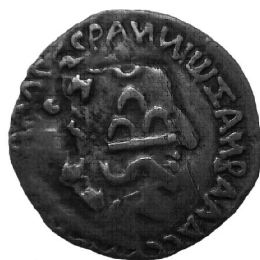
FIG 5: Overstruck AR Karsapana of Nahapana from the Jogalthembi hoard.

Above all, their inclusion helped the coinage to spread beyond the relatively minor Kshatrapa kingdom and into the rest of India. For the reasons already discussed, we cannot track the wider movement of the coinage with precision; the evidence certainly suggests it circulated widely. The exceptionally large Jogalthembi hoard includes coins of Nahapana overstruck by the Satavahana king Gautamiputra Satakarni, presumably for circulation in Satavahana territory. Later in the period, the reputation of the Kshatrapa coinage is clear from the large number of imitative coinages produced by others, including the Satavahanas and Guptas. Considering the peripheral nature of Kshatrapa power, and the fact that other Indian kings seem to have considered them Saka barbarians, 23 this is particularly surprising and indicates that there must have been something attractive about the Kshatrapa coinage to traders in other parts of India.