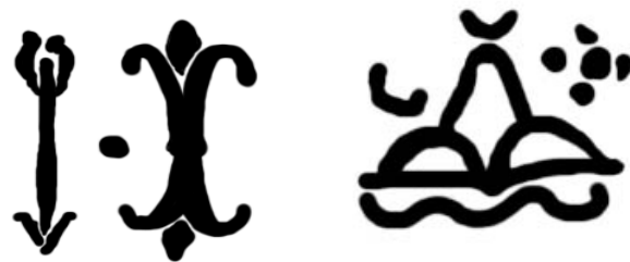
FIG 3 & 4: Kshatrapa "dynastic emblems": the early arrow-and-lightning bolt type and later "Chaitya" (hills-river-sun-moons). After specimens of Nahapana and Rudrasena II respectively. (BUD)

The only icon which appears on the reverse of the later Karsapana is the so-called “dynastic emblem”. The earliest example of this, a bow-and-lightning bolt, is clearly associated with designs that appear on certain Indo-Scythian types, yet the icon is replaced by the “Chaitya” icon under Chastana in the 130s. 12 Though exactly what this symbolises is disputed, it previously had appeared on early Indian “Punchmark” and earlier Satavahanan coins and seems to have been strongly tied to indigenous “Indian” religion, culture and mythology. 13 From Chastana onwards, it appears on every Kshatrapa Karsapana , and also on numerous base metal issues, until the final issues of the 420s.