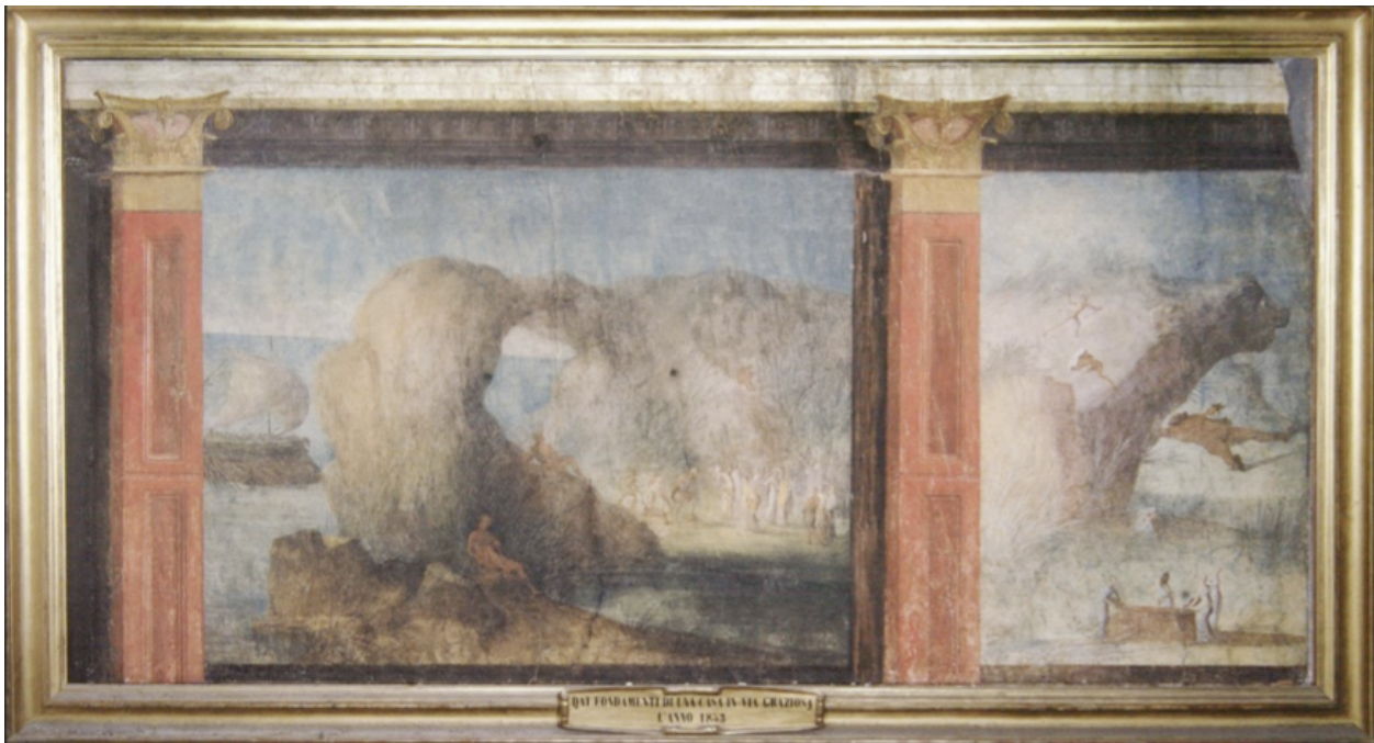
Fig. 8 Panel from The Odysseus Frieze: Odysseus in Hades. From a private house on the Esquiline Hill in Rome. First century BCE. Vatican Museum.

http://www.pompeiiinpictures.org/VF/Villa_016_p3.htm .