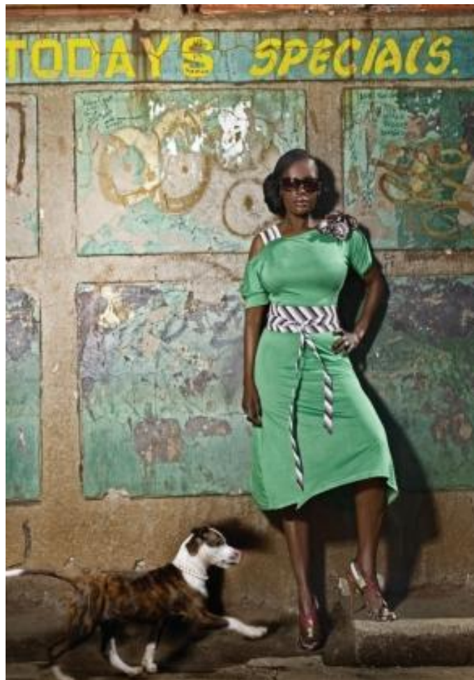
2. Dress in the "Sophiatown style"