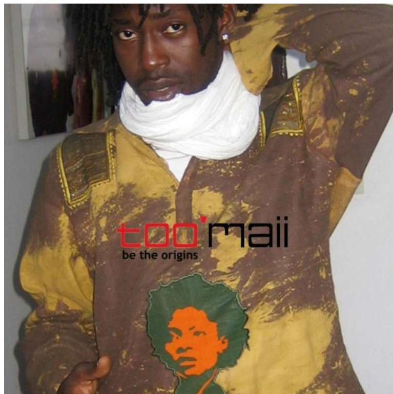
6. Men's shirt of the collection “Favelas Chic” of Too'maii 2005. © Jules Wokam

1956, the film was controversial for its eroticism and sexuality, but at the same time the film director criticized the racism and segregation between blacks and whites in the Southern United States. The “Favelas Chic” men’s shirts of Too’maii have a camouflage pattern embroidered with applications—reminiscent of the local embroidery crafts—and a sewn woman portrait in the Afro look (see figure 6). It is unlikely that the bearers of these shirts and dresses can say a lot about the history of the favelas or the film of Kazan. Rather, Wokam outlines that the movie is unknown in Cameroon due to the lack of cinemas (e-mail message to author, 23 February 2012). Collections like this are less an active political statement and more about the fact that fashion items are placed in a larger context of the Pan-African and Afro-American history, associated with self-determination, resistance and freedom and thus characterized as provocative, innovative and hip. As in his works of art and design, Wokam plays in his fashion design consciously and ironically with words and forms that are considered typical of Africa’s global history, according to the principle “we are the origins”.