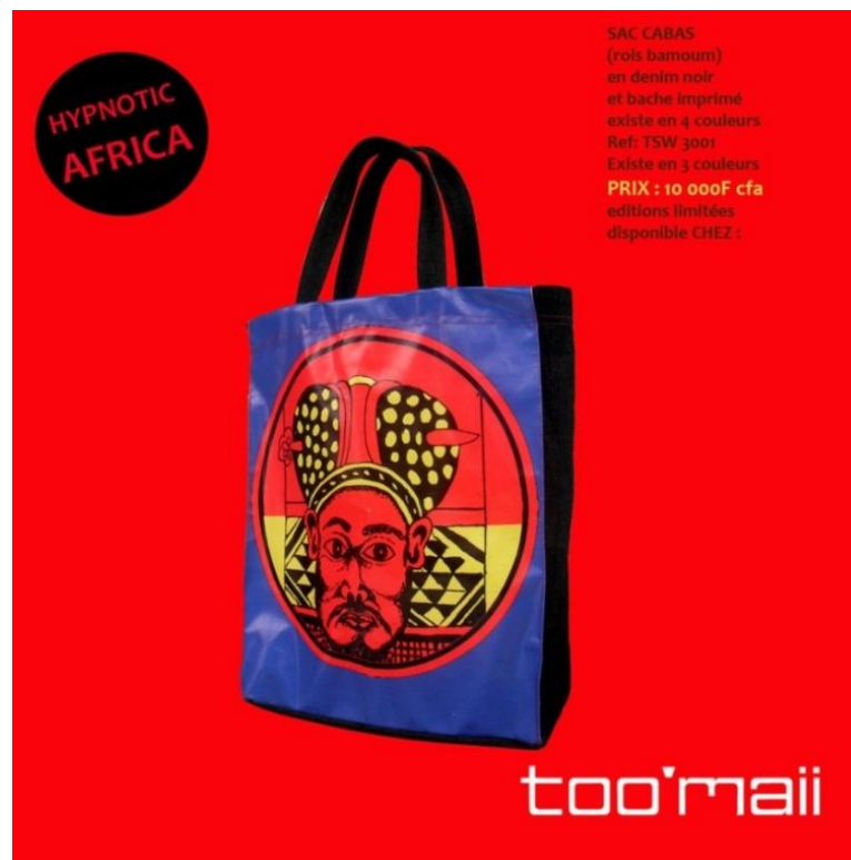
7. Plastic sac of the collection “Hypnotic Africa” of Too’maii 2012 © Jules Wokam

Recently, Wokam has also used traditional motifs and craft techniques (e.g. embroidery) in his fashion design. Under the motto “Hypnotic Africa”, the label offers a carrier bag in bright colors emblazoned by a drawing of a Bamum king of the Cameroon Grasslands (see figure 7). This art form was created—at the same time as the invention of the Bamum script—at the beginning of the 20th century in Bamum. Appreciating the graphics as an artist, Wokam chose the motif for his new bag line. In addition, he was impressed by the spirit of innovation and creative appropriation in the development of this art form (ibid.). He also plays ironically with the traditional references by printing the motif of an old king on a plastic bag.