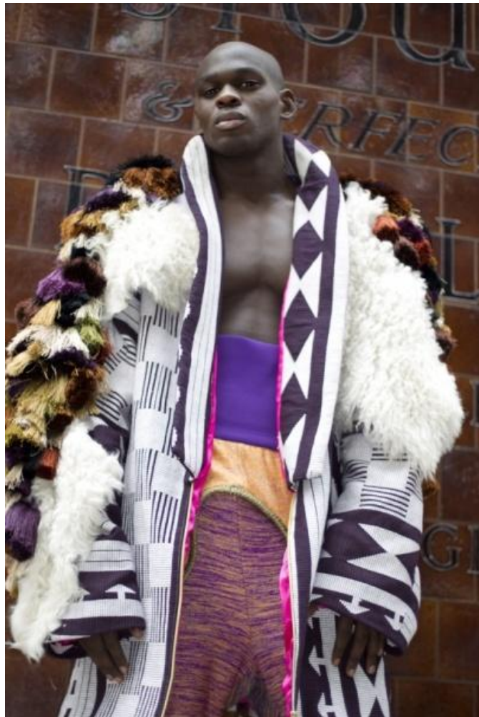
3. Fela Jacket and Sax Trousers 2010/11

founded a new musical style, Afrobeat, which was a complex fusion of Funk, Jazz and African influences like Highlife or traditional West African rhythms. Motivated by the Black Power movement in the United States he criticized in his texts political injustices from colonialism to the dictatorial military regime in Nigeria. As a supporter of Pan-Africanism he defended traditional African culture and values against—in his eyes—the degeneration of the upper class. Despite his popularity among the Nigerian public and his international reputation, Fela Kuti was attacked and arrested several times by soldiers of the ruling government. Since his death in 1997 his son Femi Kuti and other young bands keep his rebellious music and the tradition of Afrobeat alive. The current revitalization of Fela's influence on music and popular culture can be seen in the release of several of his old albums and the successful Broadway musical "Fela!".