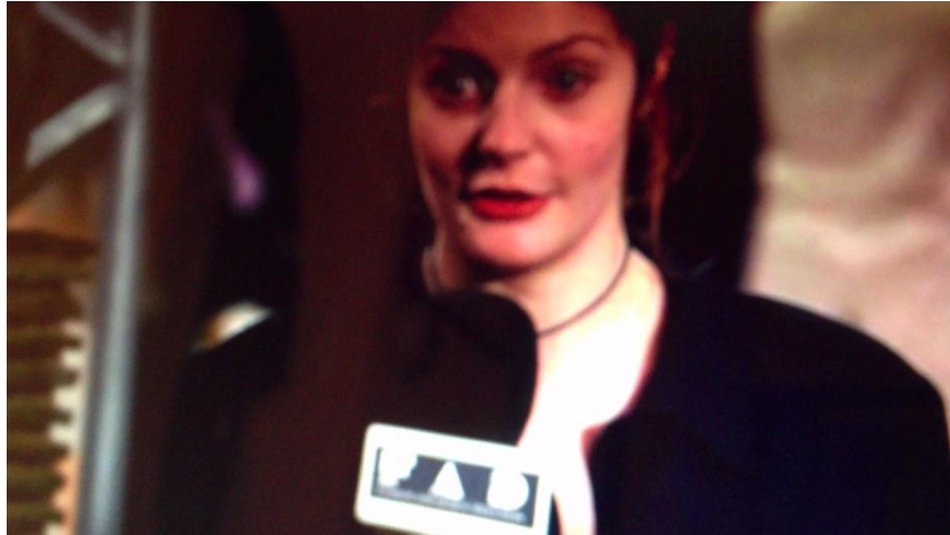
Chiara Mastroianni as "Sophie Choiset" in Prêt-à-Porter (1994)