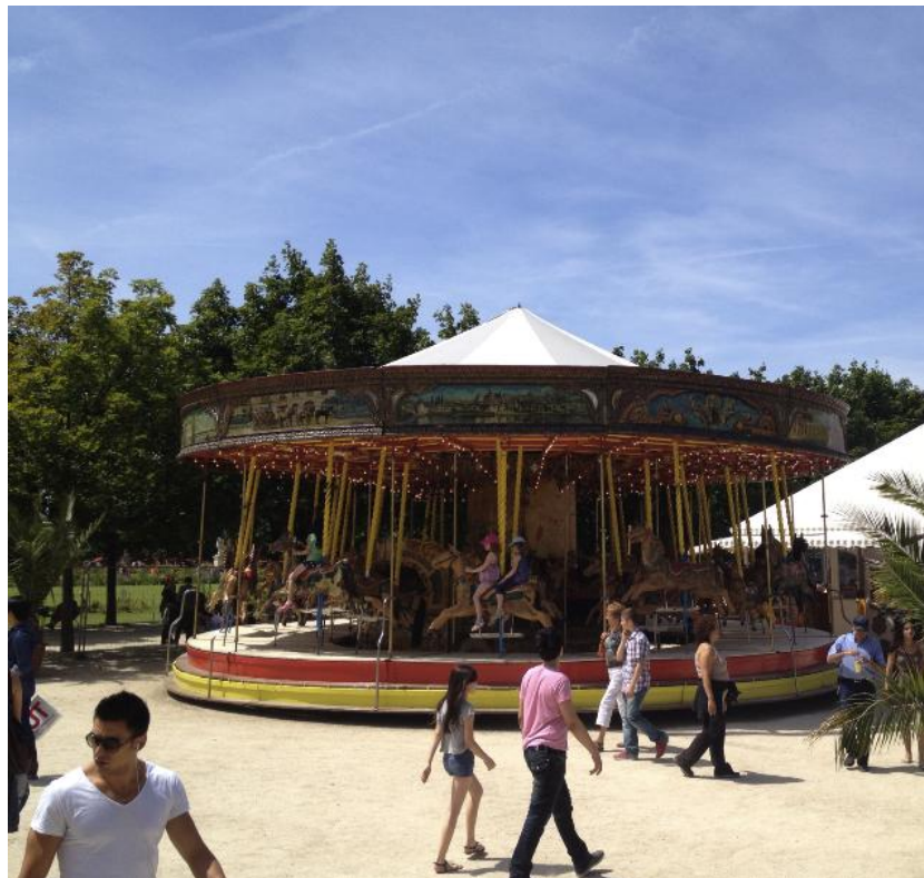
The carousel at the annual summer Fête des Tuileries.

something that was just worn to something that was at once “fashion” and “fashionable.” It also got Jacobs fired from Perry Ellis. Taking ideas from the street put Marc Jacobs on the street. Even his couture-inflected presentation for Louis Vuitton cannot get away from the street. The carousel that inspired him was drawn from the carousel in the Jardin de Tuileries and the carousels that are part of the annual spring and summer fair that plants itself in the park. Once the garden of a royal palace whose inhabitants would have been the original clientele of haute couture, only the grounds now remain as converted public parks for the masses riding carousels in off-the-rack and otherwise ready-to-wear.