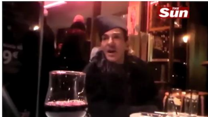
Amongst other things, Galliano was quoted as saying “I love Hitler!” 1

Prefaced with the hashtag #onewishfor2012, the wish was tweeted by Nina Garcia, fashion director at fashion magazine Marie Claire and judge on the hit TV show “Project Runway.” Garcia’s wish to the twitterverse articulated a desire shared by many insiders in fashion’s concentric circles from bloggers to print magazine editors to their readers and legions of self-anointed fashionistas. One of fashion’s most esteemed couturiers was without a head designer. On February 25, 2011, Dior suspended John Galliano, who had been at its creative director since 1996, after his arrest over making anti-Semitic remarks at a Paris bar.