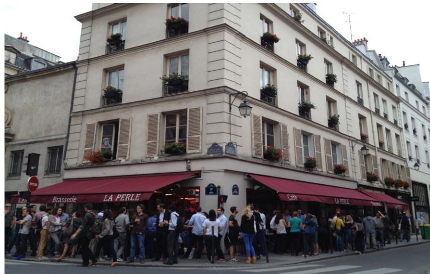
La Perle on Rue Vieille du Temple in the Marais 11

The fantasy world of high fashion Galliano inhabited and which he had come to represent was thrust against the reality of the indicting 10 video of his tirade at La Perle that could be played and replayed at will and on demand through various social media streams and countless communication outlets. By Lagerfeld’s standard and litmus test, the dam holding back Galliano’s inability to deal with the pressure of the fashion world’s pressures would have eventually cracked and broken. That it happened in public, in a popular bar on a busy thoroughfare in the Marais, on Rue Vieille du Temple, on the street (as it were) rather than at home was co-incidental.