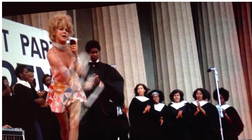
Barbara Harris as "Albuquerque" in Nashville (1975)

In Altman's revival during the 1990's of which Prêt-à-Porter was a part, it is Kitty Potter, the roving tabloid journalist (rather than a designer) who experiences a breakdown. Equal parts protest and resignation at the loss of her house and name to the Texan conglomerate, Simone Lowenthal decides to show no clothes for her fashion show (not even the "House of Lo" stamped Texas boots). She sends her models down the runway naked to which the loquacious Kitty, always usually eager to ingratiate herself to her interviewee and her imagined