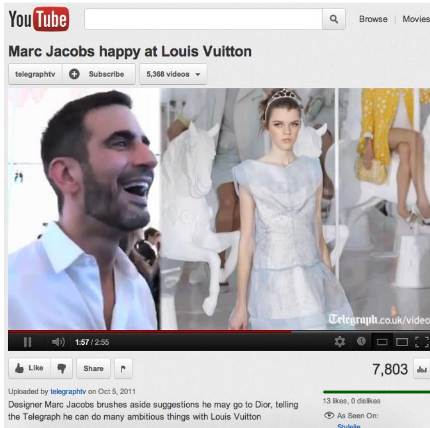
Marc Jacobs being interviewed after his Spring/Sumer 2012 show for Louis Vuitton.

Jacobs gives us two theories of fashion as being either cyclical with everything coming back in style or where everything old will eventually be new again and, likewise, where everything new will, once again, be old. The other is that fashion, like case or precedent law, is based on history and what has come before. Fashion, in this sense, is cumulative.