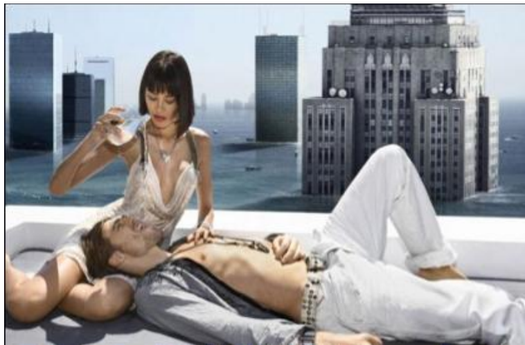
16. Image of Diesel's "Global Warming Ready" campaign.

article I would like to focus on their hyperreal, and yet subtle, visual references to cities and to the transnational flow of people associated with globalization. The postmodern urban pastiche that characterizes these ads helped Diesel transform a garment like denim, which is traditionally associated with the outdoors, into the ultimate urban wear. On a representational level, Diesel appropriated the fragmented nature of contemporary street culture to assemble elements of the Wild West (Diesel's original logo depicted an Iroquois man's head), American vintage, and 1960's hippy, psychedelic culture with non-Western funky motifs. On a sartorial level, the company also relied on the clothing bricolage typical of street culture. Adopting the faded and worn-denim look—at the time typical only of construction workers and hard rockers—and mixing it with high-tech fabrics, high-quality manufacturing, and modern details, Diesel tailored stylish and hip jeans that blurred distinctions between street style and high fashion. 14