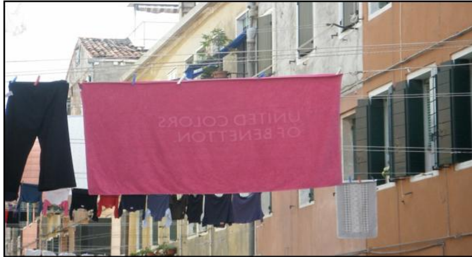
1. Benetton's hanging towel in Venice.

I started thinking about the relationship between fashion and global cities in my first years of graduate school in Los Angeles. It was the Spring of 2002, when, driving along Santa Monica boulevard on my daily commute to UCLA's campus, I would stare at a billboard publicizing "Diesel's Happy Valley" and ponder the worldly reach of the small denim company I remembered from a couple of decades earlier. Along with Americanino, Mash, Gas, Replay, Carrera, and others, Diesel was one of the several denim firms scattered around the area where I grew up in the Veneto region of northeastern Italy. 1 With its billboards blanketing Los Angeles's boulevards and its flagship stores colonizing key shopping sites in the city, Diesel had clearly grown out of its provincial birth place and spread all the way to southern California and beyond. In fact, judging from my browsing through the international newsstand across from campus in Westwood village, Diesel's advertising appeared extensively in exclusive high-end fashion magazines as well as alternative design and music periodicals around the globe. My quotidian musings on Diesel's worldly expansion eventually prompted me to explore the globalizing trajectory of other successful