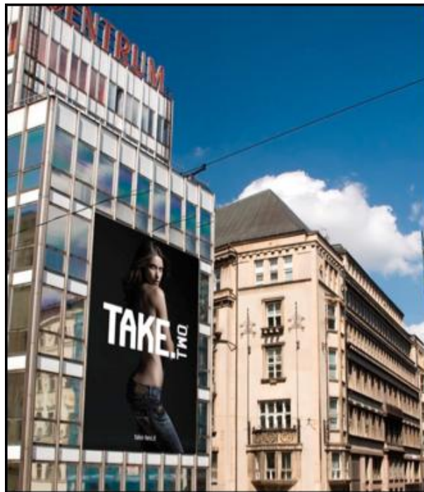
11. TakeTwo's advertisement.

figure 9-10). 13 Although in the latter ad there is a critical rejection of the city as a place of conformity (the model is free because she chooses TakeTwo), the metropolis is central in these ads, serving as a concrete place from which to construct representations of edgy urbanity. If brands like Playlife, Stefanel, and TakeTwo appropriate metropolitan centers through straight-forward associations in their ads, Diesel generally chooses to do so more indirectly. Diesel does not declare, but rather suggests the metropolitan character of the company by co-opting street-wise counter-culture and the ever-shifting dynamism of cities.