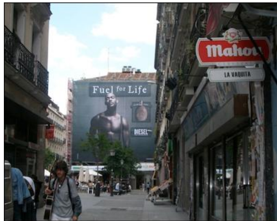
8. Diesel Wall Ads in Madrid.

Alongside setting up retail stores in key metropolises and urban areas, the clothing companies of the Italian Nordest inhabit and fashion the urban landscape of cities through their billboards and sponsored art. Sisley, one of Benetton Group's brands, recently sponsored a philanthropic advertising project in Venice that caused much controversy. For the past few years Benetton Group plastered the Doge's Palace and the Bridge of Sighs in Venice with gigantic billboards advertising the Sisley label (see figure 7). While these posters cover the city landmarks with ads, they also serve to pay for the vital restorations of the buildings and monuments. Similarly, in 2003, Diesel started shaping the facades of metropolitan centers with its "Diesel Wall," a competition meant to sponsor artwork to be displayed in large, unused walls of major cities. Mixing the commercial aspect of the billboards with a philanthropic mission and artistic messages, these companies both redefine the use of advertising posters and of decaying cities' facades.