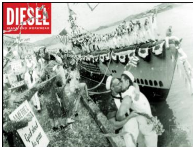
5. Diesel's ad.