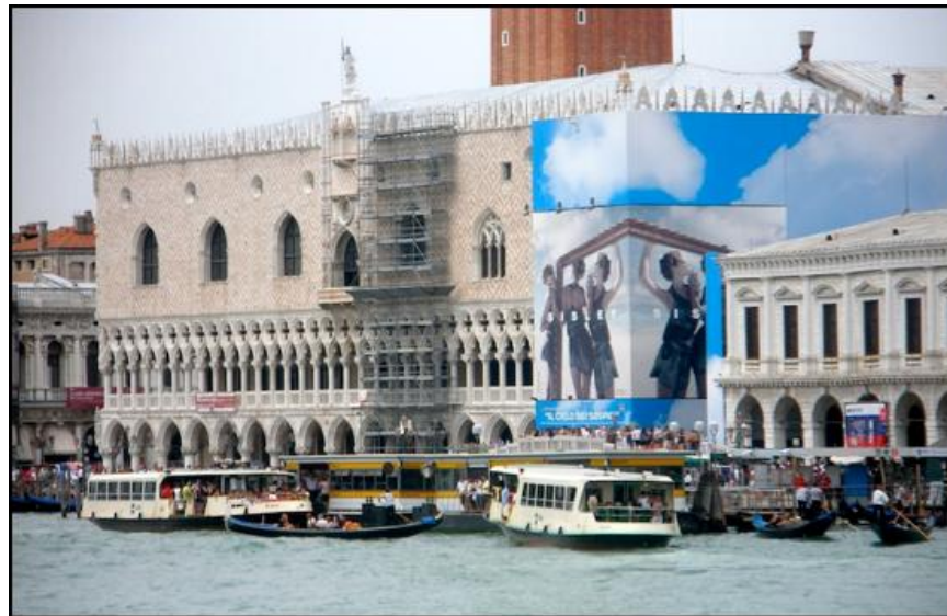
9. Sisley's ad covering the Doge's Palace in Venice.