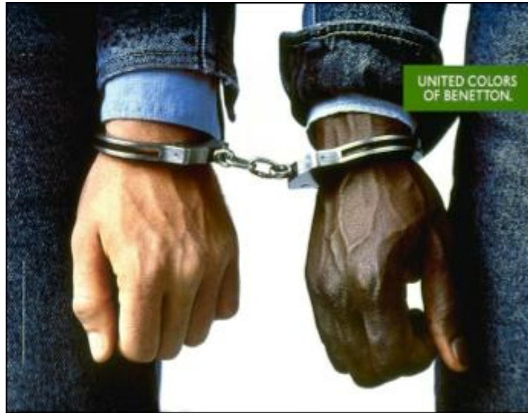
2. Benetton's multicultural ad.