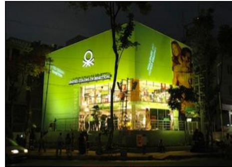
6, 7. Benetton stores in Tapei and Bangalore.