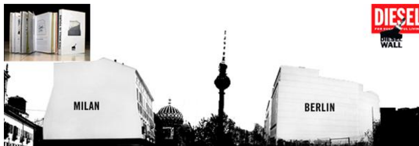
10. Diesel Wall competition. ( http://www.notcot.com/images/dieselwall-thumb.jpg )

The firms of the Nordest have learned to absorb a metropolitan aura by taking on the cities' role as artistic and intellectual hubs and posing as think tanks or avant-garde institutions that sponsor art, social, cultural, and educational events as well as philanthropic projects. In 1991 Benetton launched its Colors magazine, which targeted young people across the world in four bilingual languages (English-Italian, English-German, English-Spanish and English-French). In 1994, the company established Fabrica , a foundation supporting young artists from all over the world and promoting projects across a diverse range of communication media (as we will see, the philanthropic mission of the