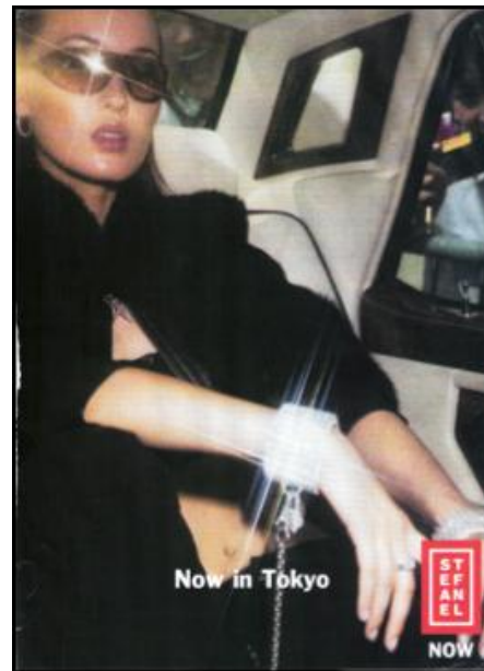
14. Stefanel's advertisement: "Now in Tokyo".