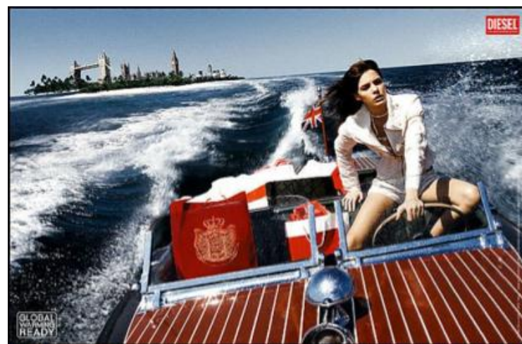
16. More images of Diesel's "Global Warming Ready" campaign.