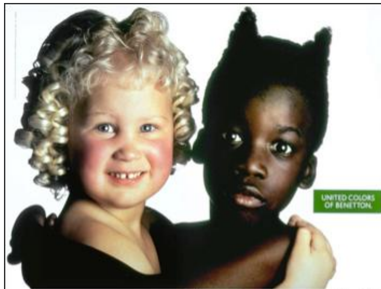
3. Benetton's multicultural ad.