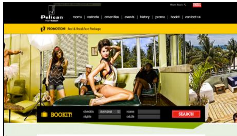
18. Pelican Hotel in Miami, Florida.