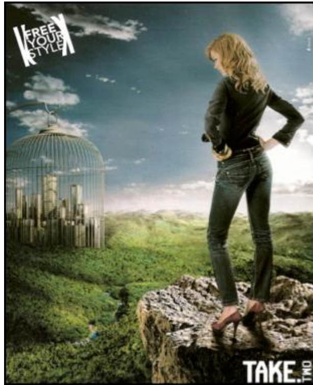
12. TakeTwo's advertisement.