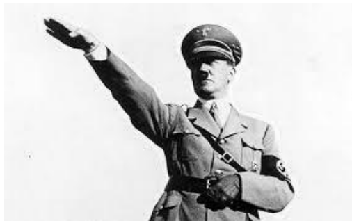
Adolf Hitler 36