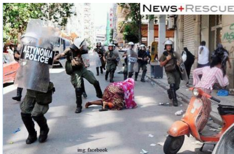
Veiled African Woman Kicked in Greece. 39

It is not a perfect play. It lacks the structure of pity and fear; it does not aspire to catharsis. It is only the crying of one of the great wrongs of the world wrought into music, 40 says Gilbert Murray in his foreword to The Trojan Women .