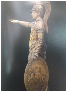
Ancient Greece 35