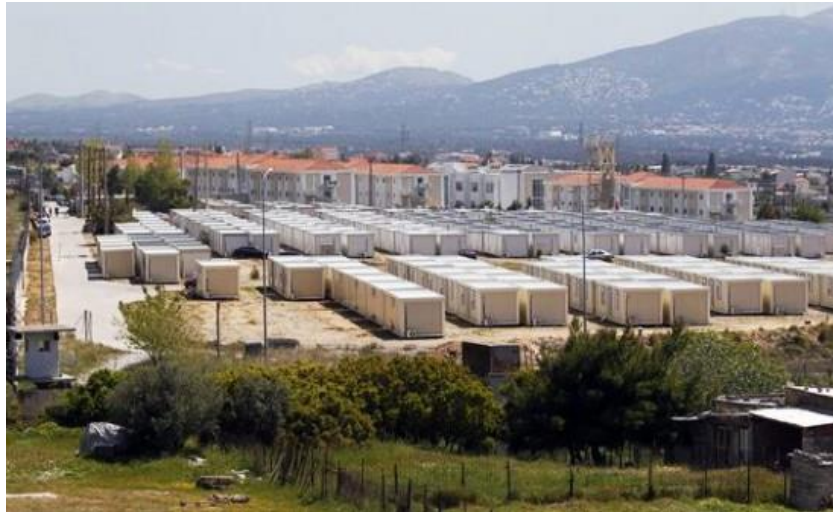
Amygdaleza Detention Camp for Illegal Immigrants 56

Who is to say that robbing a people of its language is less violent than war? 55