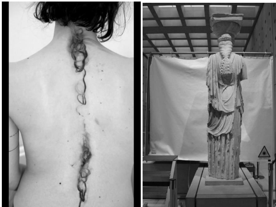
Author Establishing a Backbone 2014. Caryatid under construction at the Acropolis Museum

The skeleton of this writing is a human body, disseminated in fragments around the world. It is anonymous and following the promised words of transnationalism, its identity has been intentionally lost. Today it lies on remnants of voices, cultures, and interactions while it is embracing a dialogue that is made out of particles. Its spine is made out of smoke and it attempts to familiarize itself with the gaps between the marrow and the bones. Their distinct materiality creates an uncomfortable feeling of disjointed unity; however it's only a matter of time for them to merge down and reestablish a body. I have been thinking about my body's ephemeral symptoms as a medium of measuring my existence and its various fragmentary adaptations. As an extension of this idea, I am attempting to represent the dialectic consequences of hybridity and ephemerality.