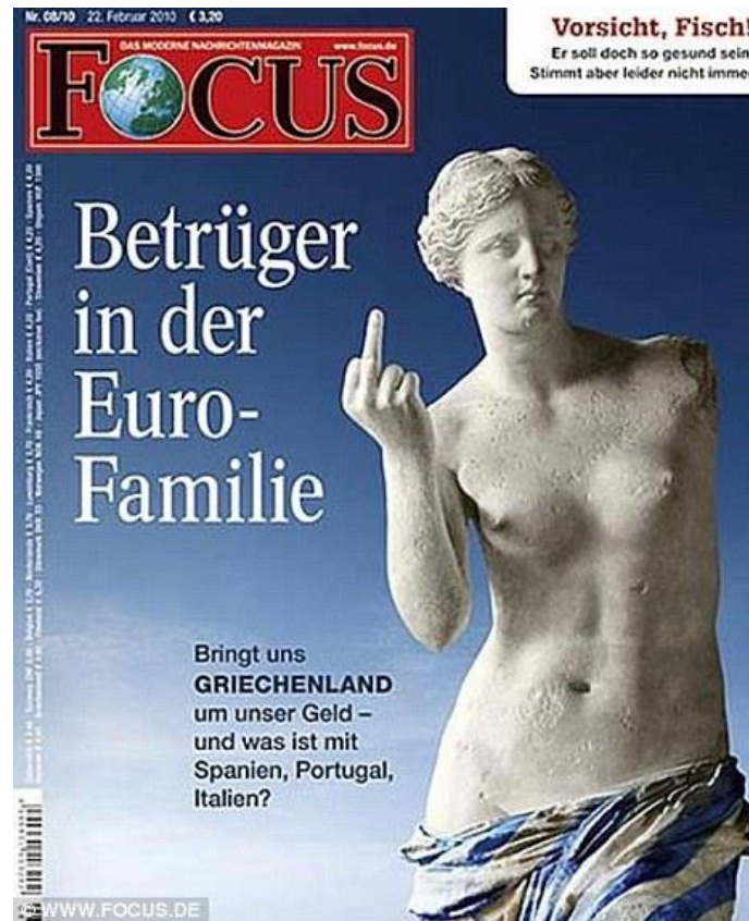
Venus de Milo giving a one-finger salute German Focus Magazine Cover 19

The February 2010 cover of Focus had doctored the famous Greek statue raising her middle finger to Europe and was entitled as “Cheaters in the European family” in reference to the recession-hit country. However, with their statement now, the Focus journalists and publisher dismissed the Greek state’s charges of defamation, libel and insult of a Greek symbol and rushed to express their respect and admiration towards Greece and its culture. 20