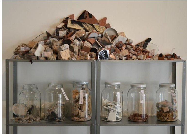
Author. They Provide Ample Storage . 2013. Silkscreened marble, pharmaceutical/archival jars, industrial commercial shelving.

The gods are observing the spectacle of sorrow as if it was their sadistic clandestine pleasure. In a similar manner, major institutions that have initiated the consequences of recovering Greece remain silent when the outcomes become too horrid to be dealt with. The oppressed subjects of the tragedy are women who are socially disadvantaged because of their gender. They embody the passport-less inhabitants of a country that is buried under bloodstained soil. They are obedient to the Greek invaders because simply they have no other choice. Similarly, the current refugees and immigrants who escape to Greece are coming from lands where life is unbearable and once they arrive are exposed to a violence they had not yet imagined. Fascist aggression limits their movements in the city, their participation in events, their walks home. It is the Syrian refugee who is fleeing from the war; the Egyptian woman; the Algerian, the Nigerian, the Bangladeshi, the Pakistani or Iraqi refugee. The Ancient Greek barbarians have now won the war and they are sharing the abandoned othered women as trophies to the various Greek cities, either as slaves or wives to their kings. The barbarian of contemporary Greece hides during the day. His occupation is one of a mainstream citizen; he is not in the parliament although he aspires to it. He wakes up with dawn, makes some phone calls, grabs his baseball bat and gets out of his home to commit crimes.