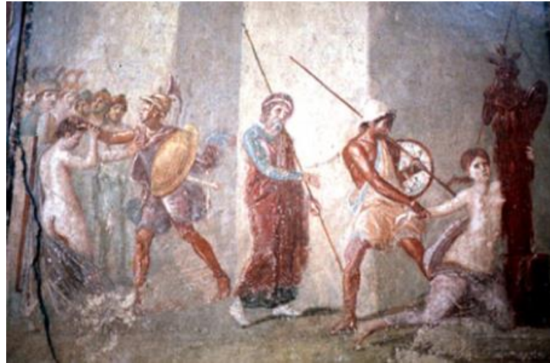
Cassandra being torn away from the statue of Athena. Fresco from the House of Menander in Pompeii. 38