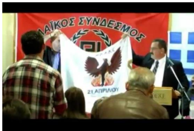
Members of Golden Dawn Party are holding flag of Papadopoulos's Military Coup (The Junta), unknown source. [2012]

There is a high likelihood that one of your distant relatives, or even your aunt, your uncle, your grandfather, or your mother or father may be haunted by the memory of a few years in their life from whence no bedtime stories will ever arise. “Exile”, “Dictatorship,” “civil war”: these strange words ring about; yet remain lost behind the veil of the untold. You grow up in constructed utopia of being and having control, or even worse, not knowing who has control, but believing to this one invisible power that supposedly supports the present way of life. 30