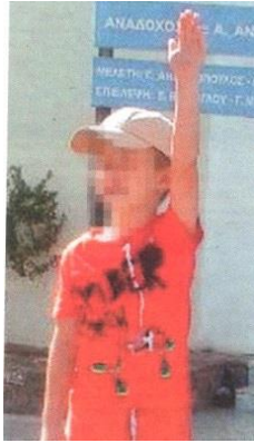
Image found in Golden Dawn's Website 29

There is a high likelihood that one of your distant relatives, or even your aunt, your uncle, your grandfather, or your mother or father may be haunted by the memory of a few years in their life from whence no bedtime stories will ever arise. “Exile”, “Dictatorship,” “civil war”: these strange words ring about; yet remain lost behind the veil of the untold. You grow up in constructed utopia of being and having control, or even worse, not knowing who has control, but believing to this one invisible power that supposedly supports the present way of life. 30