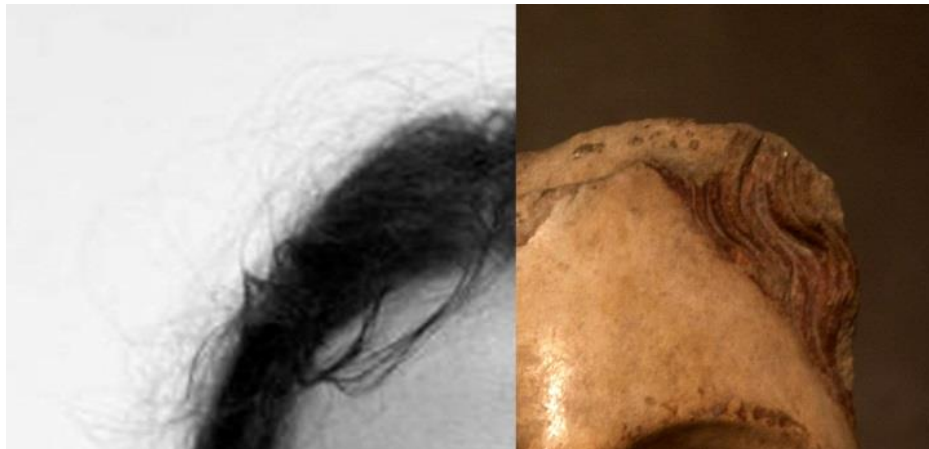
Author. Statue and Arrested Woman . 2013.

[...] Criminalization is a bourgeois conceit, [and] something we can afford to do because it is a relatively contained epidemic. And contained, importantly among those people who are socially marginalized and have relatively little social capital: sex workers, drug users, men who have sex with men, migrants from sub-Saharan or endemic areas of the world where HIV is endemic. That’s what we learn about in the context of this. It’s the fear that the majority has of the minority, the fear if you like, that the virus will escape into the “normal” population. And its very easy to satisfy a popular call to punitive response by saying “don’t worry, we are going to criminalize the people who already have no access to the institutions (of perhaps), or have less access to popular, or media to put that case on, or have very little social or economic capital.” 53