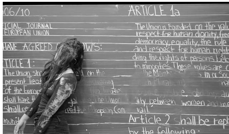
Author. 2014. Documentation of Durational Performance