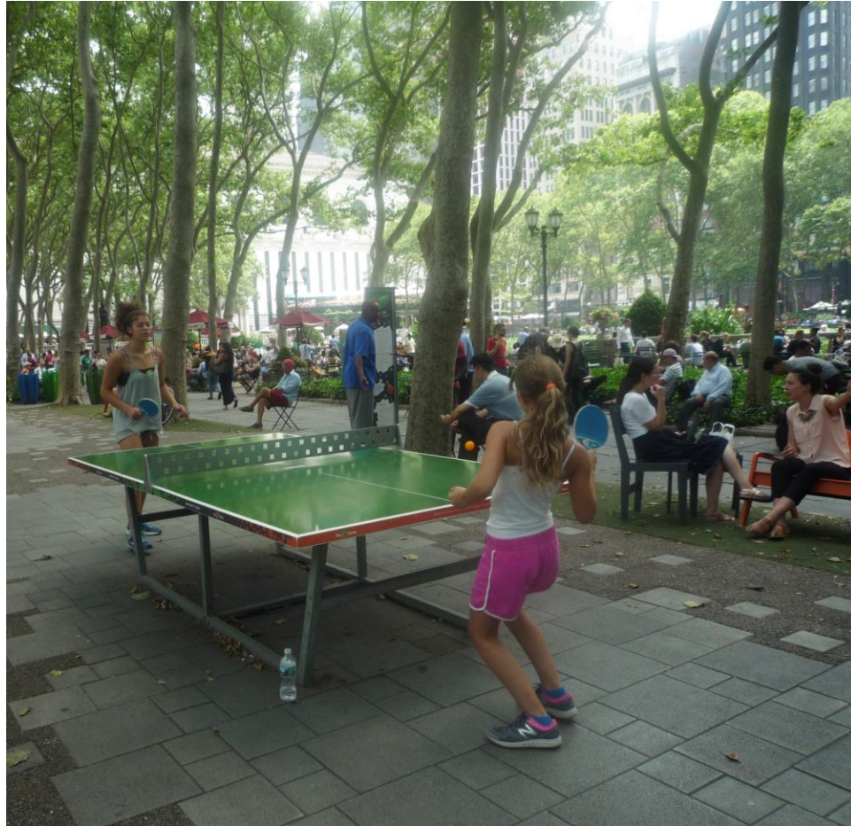
Fig. 7. Bryant Park, ping pong table. A multitude of activities offered by the park, complete with equipment, bring strangers together to play board games, ping pong, and pétanque and to watch others at play, July 8 2016, 1:00 p.m.

In the cold months, handheld devices appeared to hinder interaction and to isolate individuals. A significant change occurred when warmer weather arrived and we noted that electronic devices were sometimes used as part of direct interaction. Instead of using their phones to make calls, people took selfies with friends, filmed themselves and their friends, watched videos together, laughed, and seemed to be enjoying each other's company, confirming that technology can also be used to bring people together in person.