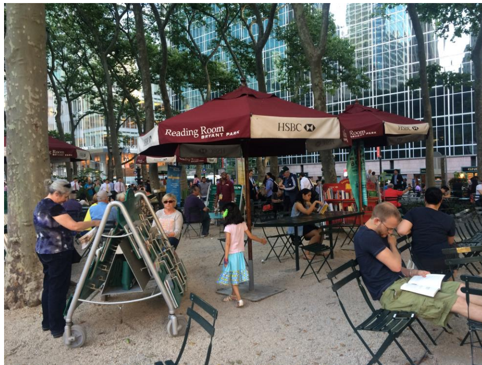
Fig. 2. Bryant Park adult section of the Reading Room, June 28, 2016, 6:00 p.m. Book and magazine carts and moveable tables and chairs invite visitors to linger in the park rather than merely passing through.

This comprehensive mission sets Bryant Park apart from other New York City parks as most do not have a continuous schedule of activities and entertainment nor activity spaces that encourage people to interact. Washington Square Park relies mainly on buskers for entertainment while Tompkins Square Park offers occasional events and performances.