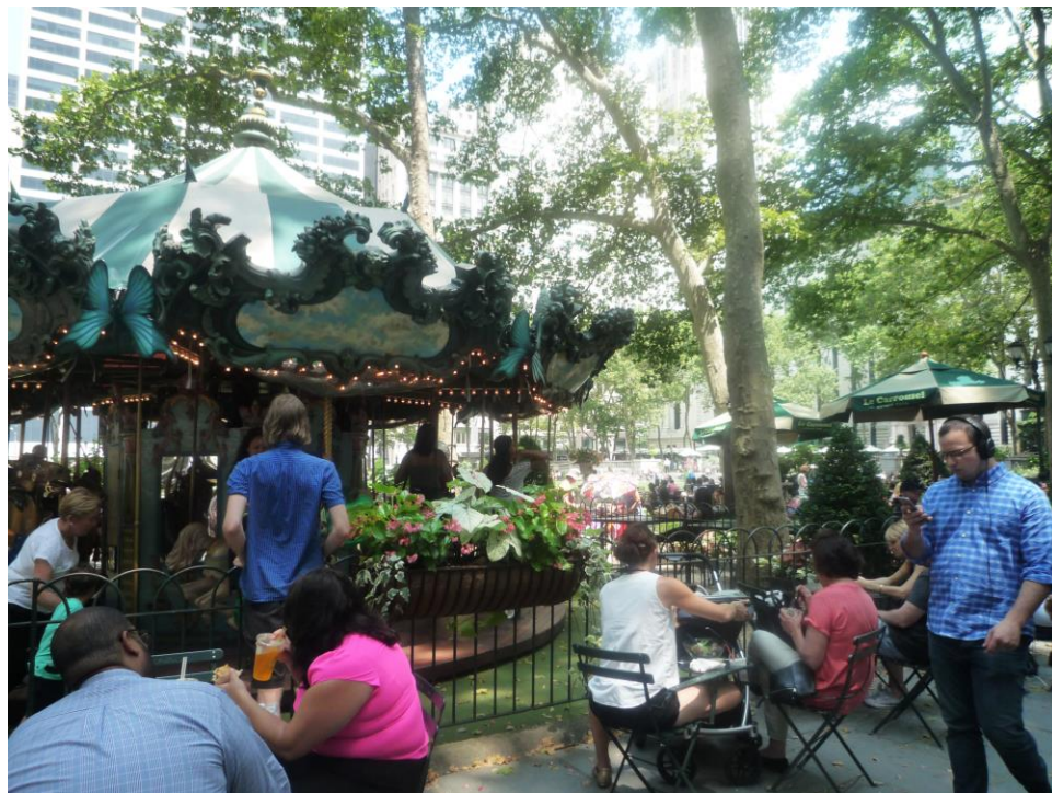
Fig. 5. Bryant Park, carousel, July 8 2016, 1:00 p.m. Also inspired by the French style are the carousel and rows of London plane trees, also found in the Jardin des Tuileries and the Luxembourg Palace in Paris.