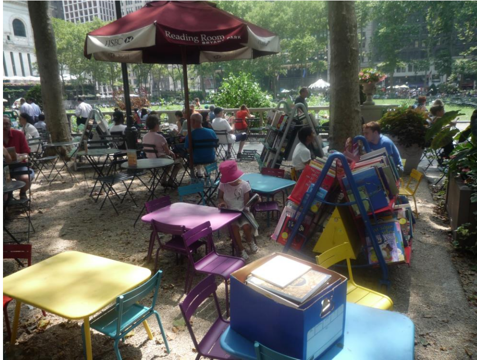
Fig. 3. Bryant Park children's section of the Reading Room, July 8, 2016, 1:00 p.m., with its child-sized tables and chairs. Activities, films, musicians, magicians, and jugglers provide further family entertainment.