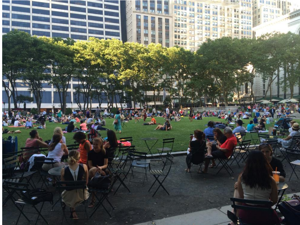
Fig. 4. Bryant Park, central lawn, June 28, 2016, 6:00 p.m. The French design influence is seen in the individual chairs that allow users to take ownership of the public space by moving them to a preferred spot and to gather in small or large groups.