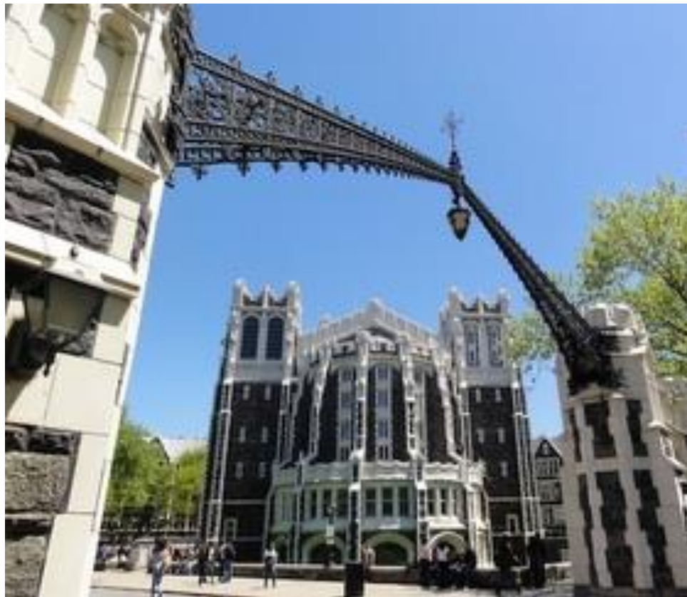
Fig. 8. City College of New York.

Culture can be defined as the byproduct of the education, history, and protocols of a group of people. New York’s cultural and creative capital is attributed to the city’s high concentration of places and areas with strong cultural significance and influence: almost any neighborhood can be pinned to a particular moment in the history of the city, the country, or the world. Education is an excellent example of something that holds cultural value in New York. However, as it is in our competitive nature to rank and rate the players of any game, the institutions of New York have varying degrees of quality to them, both in the quality of the education they impart and (especially) in the quality of student they admit through their gates—if they even have gates. The City College of New York in Harlem is usually a school that does not rank highly in most polls, at least compared to nearby Columbia University, which ranks very highly all over the world (College Factual). But what determines the contribution of education to cultural capital? Does being ranked lower reduce its cultural significance or impact?