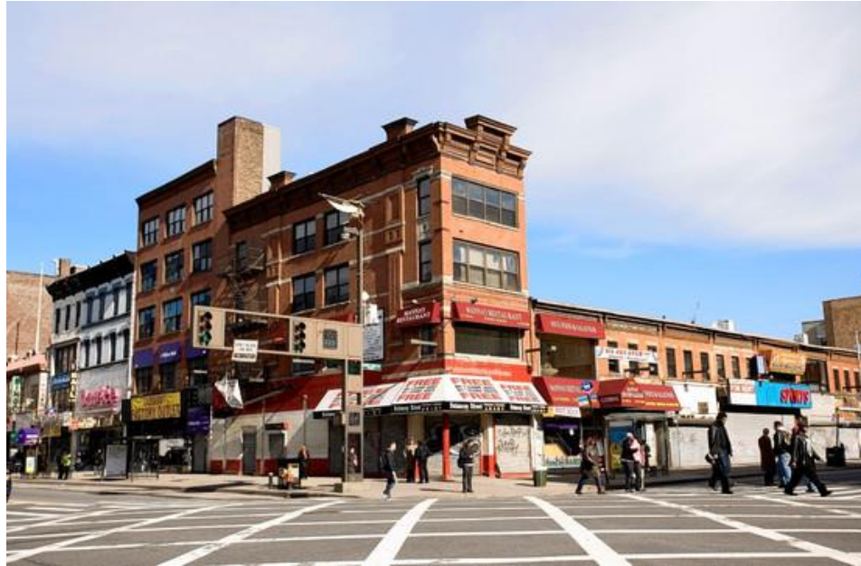
Fig. 5. A typical sight in Harlem.

close. Until recently, minority groups have for years been forced to move to and stay in Harlem due to the gentrification of other areas by previous generations of hipsters.