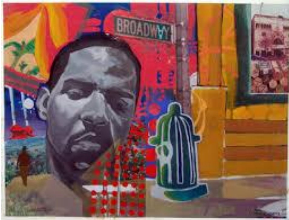
Fig. 6. Dioniz Ortiz, Broadway Scene (2007).