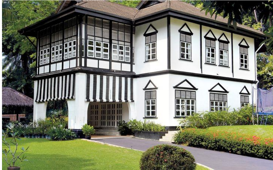
Fig. 9. A typical black-and-white bungalow in Singapore.