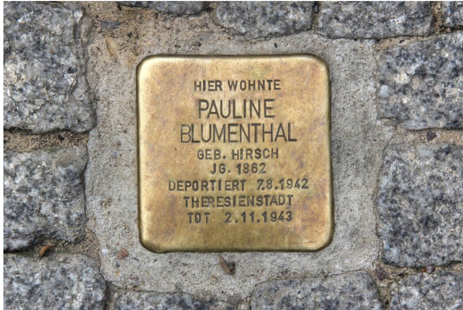
Fig. 7. One of many Soliperstein installations. This one is in Berlin.

systemic tendency to ameliorate the past, to forget atrocities and their victims; Berlin is not allowed to forget the Holocaust, its victims, and its survivors.