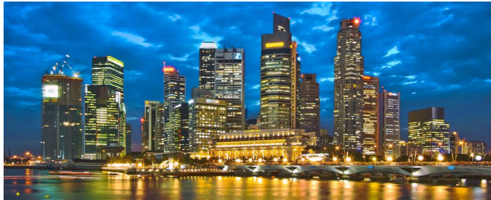
Fig. 1. The skyline of Singapore, one of the first images that appears in a Google image search of "Singapore."