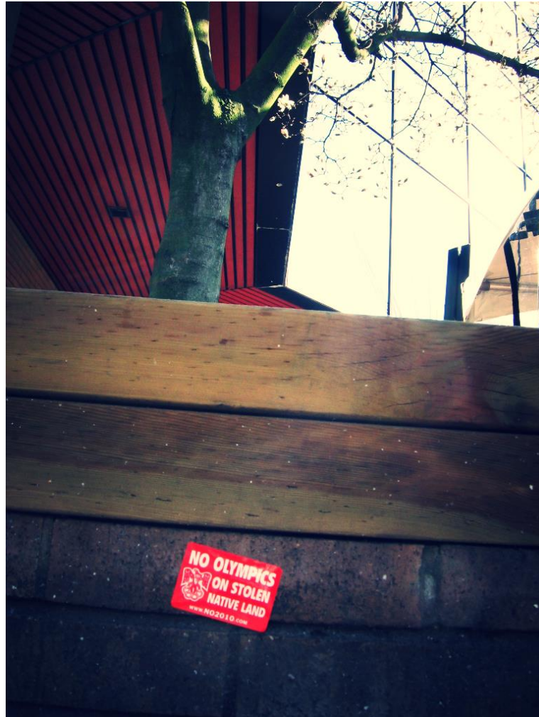
Fig. 1. No Olympics on Stolen Native Land . Sticker, downtown Vancouver, Canada. 2010.