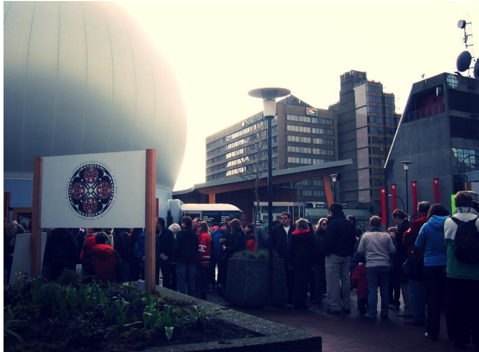
Fig. 3. Lining up at the Four Host First Nations' Aboriginal Pavilion. 2010.

The Four Host First Nations' Aboriginal Pavilion (Fig. 3) was the primary official venue for Indigenous cultural and political expression during the Games. Its spatial position on Queen Elizabeth Plaza was a uniquely settler colonial juxtaposition: an Indigenous-run performance space occupying a site in the heart of the city commemorating a key imperial figure. Averaging 14,000 visitors daily, the Pavilion was a popular stop on the pavilion circuit and often had lines over an hour long (Four Host First Nations).