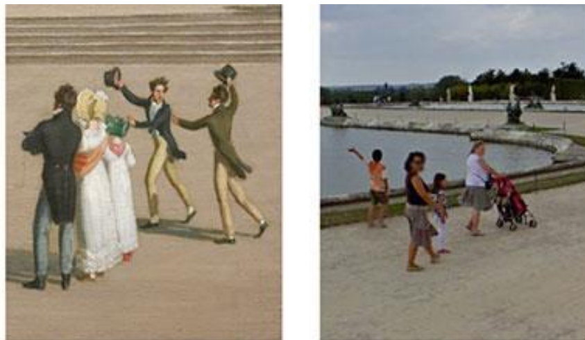
Fig. 5. Detail of John Vanderlyn’s Panoramic View of the Palace and Gardens of Versailles , 1819 (left) and Detail of Google World Wonders Project (Palace and Park of Versailles), 2012 (right).

The panoramas of Versailles provide a multi-layered look at the visitor’s gaze. As Smith argues, “Visiting a heritage site or museum is a performative state about identity in which the performer is also audience to the management and interpretive performances of the heritage site/museum management and interpretive staff... If meaning at heritage sites and museums is mediated through constructing and engaging with a plausible experience, rather than simply through presenting and reading the facts on interpretive panels, the heritage visitor becomes intimately concerned with decoding the meaning of those experiences” (Smith 70). And so, in both the imagined visitors by Vanderlyn and the un-choreographed recording of visitors by Google’s Street View, we see people responding to the site and creating memories: whether in a discussion or taking a photo or gazing at the physical site of Versailles, people are reacting to their surroundings—helping shape the identity of a place, a culture, and an individual (Fig. 5).