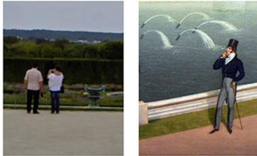
Fig. 6. Detail of Google World Wonders Project (Palace and Park of Versailles), 2012 (left) and Detail of John Vanderlyn's Panoramic View of the Palace and Gardens of Versailles , 1819 (right).

In the case of Vanderlyn's panorama, the people within the circular painting not only humanize the setting, but in certain instances may act as role models to show the panorama visitors how to engage with the panorama, such as the astutely dressed man in the foreground, holding a monocle to his eye, as he examines a nearby sculpture (Robey 17). In Google's Street View of Versailles, the tourists show us how contemporary culture is consuming heritage (Fig. 6).