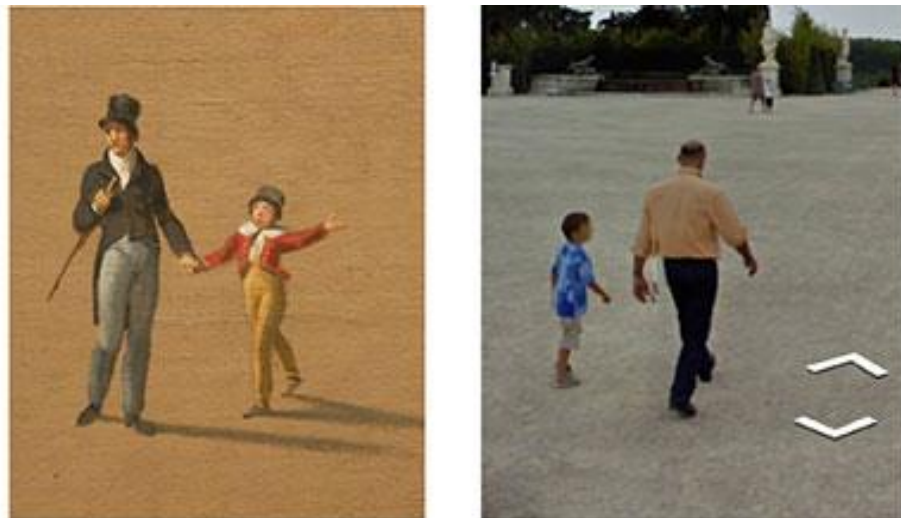
Fig. 4. Detail of John Vanderlyn's Panoramic View of the Palace and Gardens of Versailles , 1819 (left) and Detail of Google World Wonders Project (Palace and Park of Versailles), 2012 (right).

It should be noted that Vanderlyn's Panoramic View of the Palace and Gardens of Versailles , which was completed in 1819, predates legislative acts to preserve heritage in France and elsewhere. As noted earlier, France formally established a Commission to catalog and advise on the protection of the country's remarkable historic buildings in 1837. It seems that Vanderlyn was not only forward-thinking in the value of heritage, and more specifically Versailles, but also understood how people might use it. In other words, through his painting, he may have predicted how people might experience the heritage of Versailles—conversing amongst the past, strolling, imagining, and playing as well as enjoying the scenes of what is considered the ideal royal residence by many for its opulent architecture, interiors, sculptures, and landscape design. Vanderlyn's depiction of people within the Palace and Park of Versailles is not too different from how Google's Street View of Versailles shows contemporary visitors using the site—although the former appears to be Vanderlyn's idealized version while the latter, Google's Street View, presents the actual. Nevertheless, the spectacle in both cases is inclusive of not only the physical heritage site being re-presented in painted and digital formats, but also the people depicted within these environments and how they are interacting with Versailles (Fig. 4).