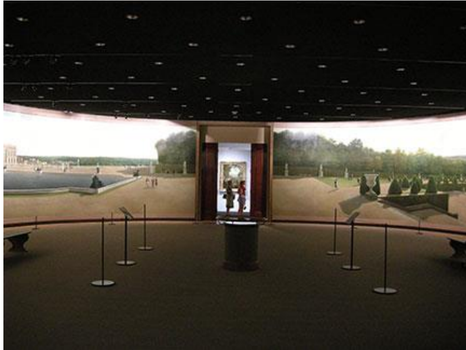
Fig. 2. Contemporary view of John Vanderlyn's Panoramic View of the Palace and Gardens of Versailles, 1819 at the Metropolitan Museum of Art, New York