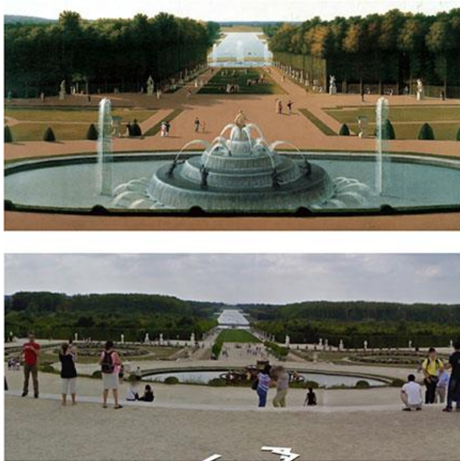
Fig. 1. Detail of John Vanderlyn's Panoramic View of the Palace and Gardens of Versailles , 1819 (top) and Detail of Google World Wonders Project ( Palace and Park of Versailles ), 2012 (bottom).