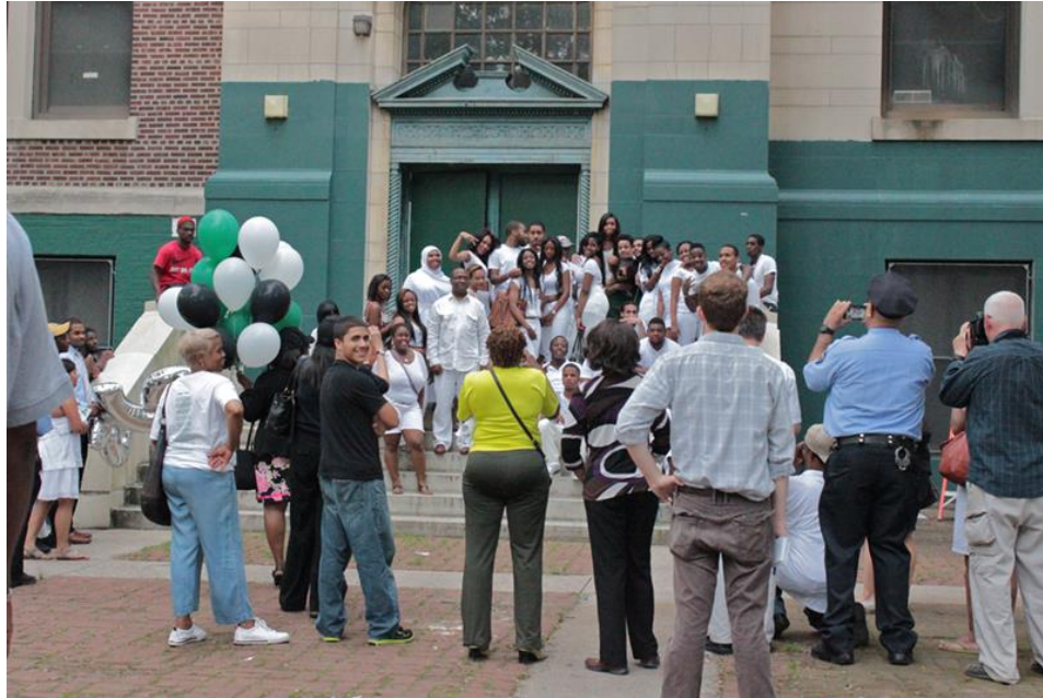
Fig. 2. The very last graduating class of Germantown High School at the school's Great Walk event, held the evening before graduation, where graduating seniors walked around the perimeter of the school to make their final farewell. To honor the legacy of the school, which was closing just shy of its 100 th year, the Germantown community, alumni, and former teachers and principals were invited to participate. Alumni speakers from every decade going back 70 years came to this event (June 2013).