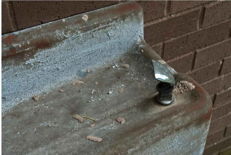
Fig. 5. Non-functioning water fountain showing years of decay at University City High School. This photograph was taken prior to the end of the school year while the school was still open and in use (June 2013).

Without official permission, many Collective members resorted to taking only exterior building shots or interior shots outside of regular school hours. Absent the vibrant faces of students, teachers, and staff, evidence of severe neglect and decay was in plain sight and the images produced often depicted schools as products of disinvestment (Fig. 4 and Fig. 5). These photos raise questions about the city and state's commitment to educating its youth—specifically, its low-income youth of color—and provide visual evidence to support claims of the consistent and continual underfunding of public education in one of the largest urban school districts in the U.S.