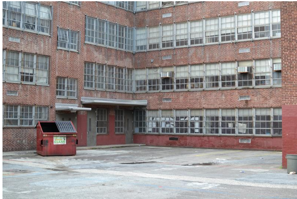
Fig. 4. This grim exterior shot of Alexander Wilson Elementary School was photographed prior to the end of the school year, while the school was still open and in use (June 2013).

Access also shaped the body of work that Collective members produced. Gaining access to the schools in order to photograph their interiors and the spaces in use by the people who worked and studied in them was a difficult process. The initial posts on the Collective's Facebook page document the depth of consideration members gave to the issue of consent, as well as the lengths they went to secure it. The threads of posts on this topic developed into thoughtful and complicated conversations that ranged from the ethical, (i.e. the responsibility of photographers and videographers to their subjects) to the practical (e.g. sharing useful information collected from conversations with the district's Office of Communication about the process of securing consent).