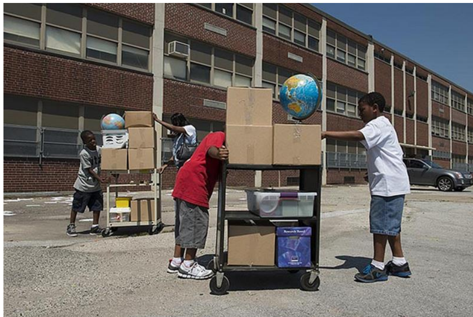
Fig. 8. Leidy Elementary School children help clear out their own school (June 2013).

Still other photographs by the Collective call attention to the massive logistical and physical work involved in closing 24 schools and reallocating their resources, both human and material, to other places. Photographs of boxes filling entire school gymnasiums (Fig. 7), piles of discarded equipment and