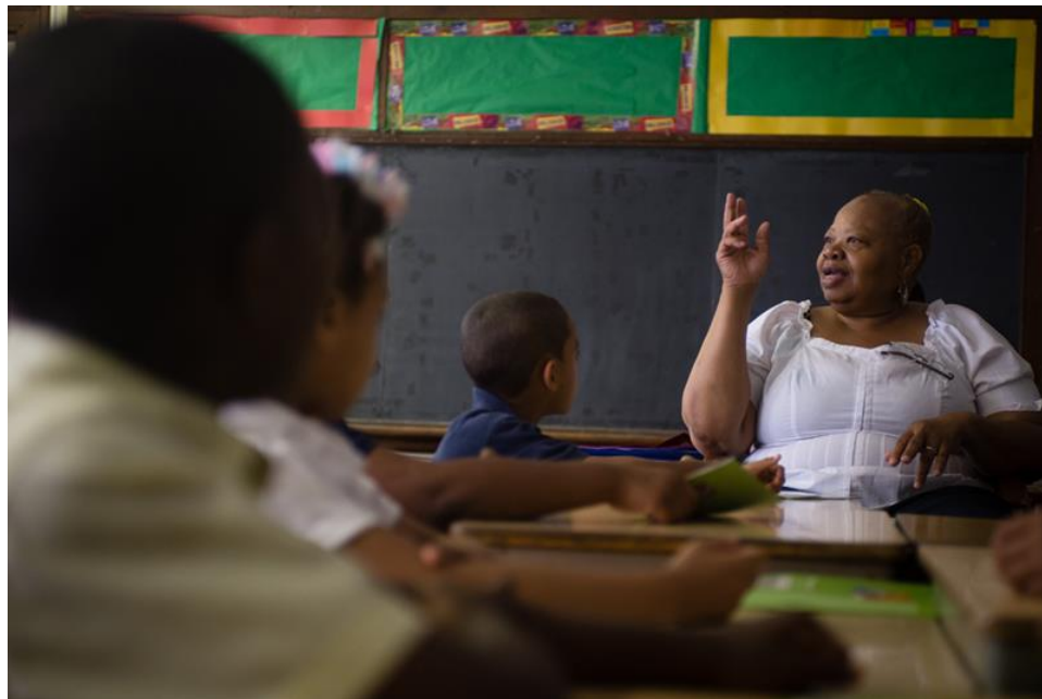
Fig. 10. Teaching until the very end at Walter G. Smith Elementary School (June 2013).

Several Collective members were able to negotiate entry into schools and were given permission to take photographs and videos of the teachers,