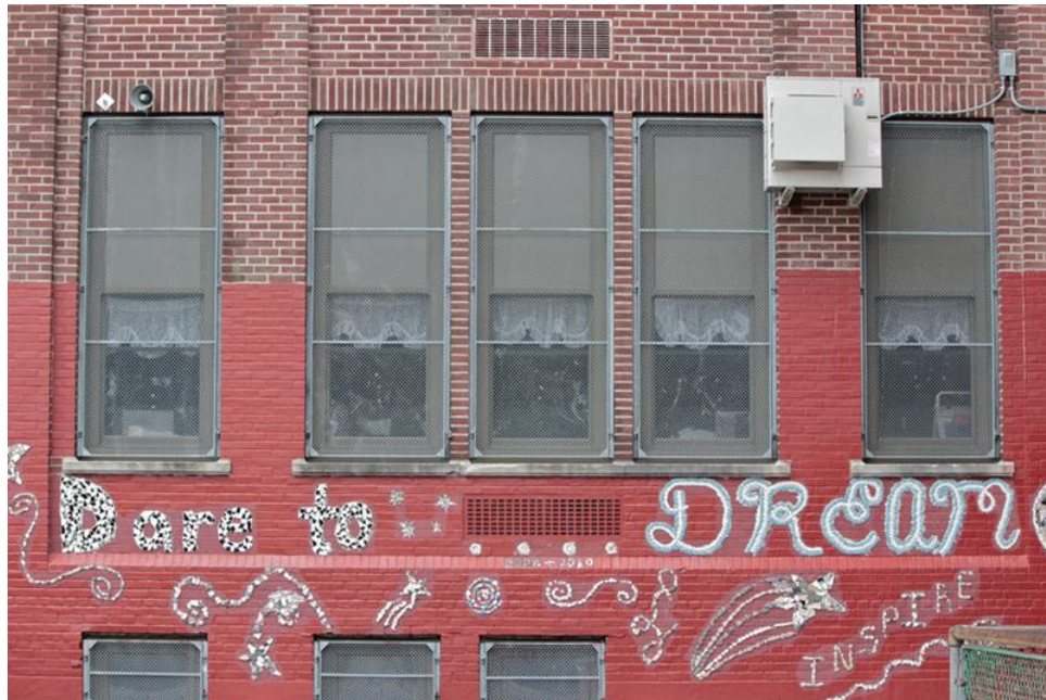
Fig. 3. Keeping the place nice. Faded inspirational mural on Robert Fulton Elementary School's exterior red brick façade, framed by interior lace curtains in one of its classroom's windows (June 2013).

Membership to the Collective's group page on Facebook quickly grew as the school closing project was shared across social media sites and was announced by several independent media outlets in the city. As word spread, the Collective came to include not only artists and professional photographers and videographers, but also amateurs, as well as public school students and their teachers, administrators, nurses and parents; public school advocates and activists; community organizers; independent media journalists; writers and poets; academics; and Philadelphians who were interested in the issue, many of them concerned about the state of public education in their city. The project to document the closure of these schools quickly took on a life of its own and was shaped by the unique visions and contributions of its members (Fig. 3). At the time of this writing, the Collective has 225 members on its Facebook group page. Only about thirty of these members took photographs or videos of the closing schools and posted them to the online platforms that housed the Collective's work. (This number is an estimate, as photographs and videos were posted photos on several online platforms, one of which is no longer accessible.)