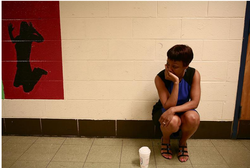
Fig. 9. The principal of Fairhill Elementary School sheds tears over its closing (June 2013).

books, overflowing school dumpsters, and uncomfortable images of students involved in the work of moving their own schools (Fig. 8) raise questions about the efficiency of this massive endeavor and the waste produced.