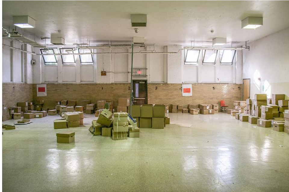
Fig. 7. Communications Technology High School's gymnasium repurposed as a storage unit, housing boxes of school books to be relocated. This photo was taken prior to the end of the school year while school was still in open and in use (June 2013).