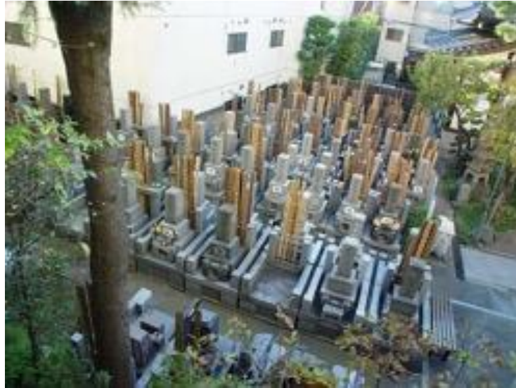
Fig. 9. The End of Rationalism . Today the only grid-like arrangement to remain in Tokyo is the cemetery. Tokyo, Japan, 2005.

History and memory are incompatible. Transcription of socially or political occurrences that are then regurgitated into what is commonly labeled as "culture" has a similar effect on memory as the blanket bombing of WW2 did on the city of Tokyo. History eradicates, obliterates, destroys memory. History and memory involve different conceptions of what is "past" and what is "present," and reading recent history, one is always under the impression that "this is not how I remember it." The event is still alive in the cultural consciousness, its resonance is still felt, and yet it is written down, transcribed, taught to young children at school. As Chris Marker asks in Sans Soleil , "Do we know where history is really made?" Less recent history is simply old enough to be considered "past," it falls outside our realm of experience and is foreign enough to be labeled "history." Tokyo is a city with no immediate past, and hence no recent history. Post-war events are still quite alive, and these still-vivid images can be traced in various aspects of the social and economic fabric. This is purely the realm of memory, the yoin of the nuclear bombs that drew a bold line between the nation's immediate present and very distant past. The threat of global oblivion is all but forgotten (i.e. relegated to the realm of history), but the personal wound lives on (it is in the realm of memory).