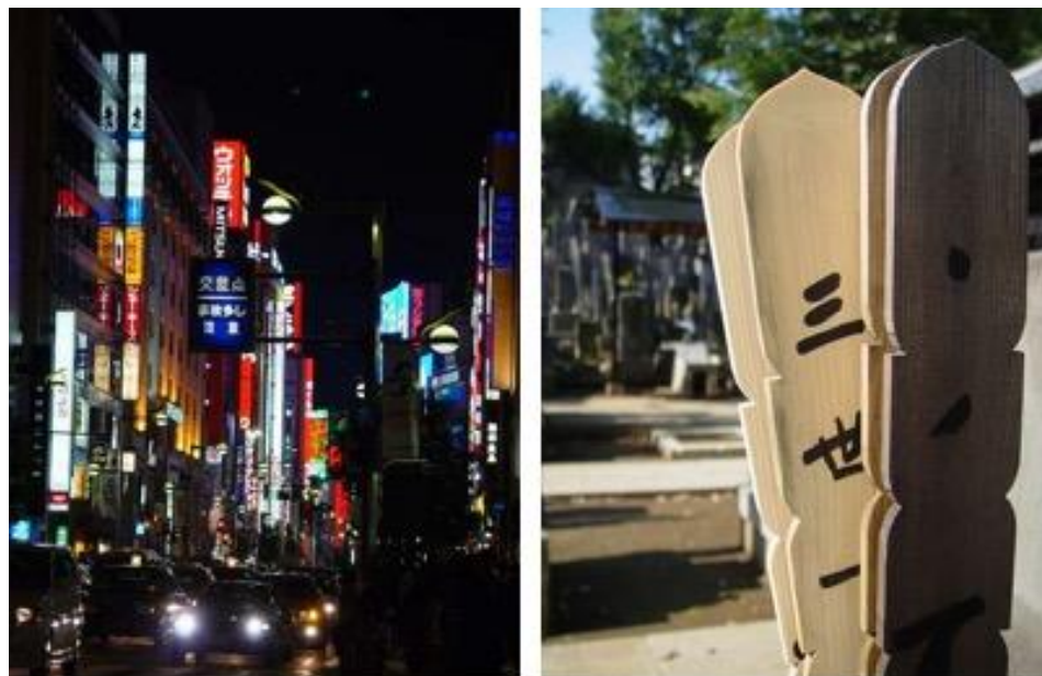
Fig. 3. Language Language Everywhere . Semiotics Abound. Tokyo, Japan, 2005.

In the Japanese city, content is prior to form. The modernist dictum "form follows function" applies to Japanese architecture in a rather distorted way. One might say that form is created in such a way as not to interfere with function. Form is unimposing or unpretentious enough to work itself around function. The usage of space in a city like Tokyo is highly complex so form must disfigure and contort itself, it must squeeze itself into the little gaps between things to keep out of the way of function (Fig. 2). In this regard, the Japanese notion of semiotics and meaning differs greatly from that of the West. Put simplistically, Western urban design seeks to create, alter, or imply meaning through the manipulation of signifying form. It is an intellectual process. It is applied. It is what we may call design. In Japan, however, form is more of a byproduct, a non-thing that is born rather than designed. The process does not end there, however. To counter ambiguity and doubt, form is then relabeled (over and over again) in the biggest, most glaring way. It is like sticking a sign on a cow saying "This is a cow" (as people stricken with amnesia did in Garcia Marquez' A Hundred Years of Solitude ). Words in Japan are spectacles of resistance in their own right, a culturally encoded system of stories that integrates history in the very building blocks of language: its letters.