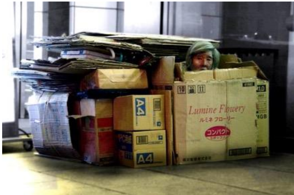
Fig. 10. Box Man. A figure that has fascinated authors like Kobo Abe, this is the archetypal inhabitant of Tokyo, the city of rewritten memory. Tokyo, Japan, 2005.

Tokyo prescribes a form of memory that is divorced from place. During my second visit, I unlearned all I thought I knew about the city, but my memories were not unmade. All I knew was that I was there again—and I knew it to such an extent that walking downtown, I was terrified that I would run into an older incarnation of myself. This is a city where “memory”—what is remembered—is the antithesis of “memory”—the ability to remember. Tokyo makes me think of the future as prescribed and inevitable. It cannot be any other way. On the other hand, though the city’s past reveals itself as an assortment of truisms and impressions that have consequences in the present, “now” is but a fleeting moment and the validity of the past is without witness. Memory is under my control. It is infinitely transfigurable. It can be anything. I see. I re-write. I re-see. I re-(re-write). I re-(re-see) (Fig. 10.)