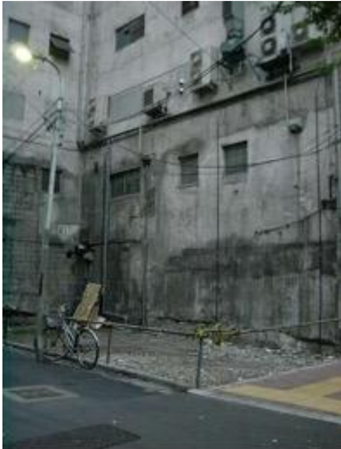
Fig. 8. Terrain Vague . One of a small handful of empty lots in the city, this one just off Ginza Street. Tokyo, Japan, 2015.

Nothing sorts out memories from ordinary moments. Later on they do claim remembrance when they show their scars. Chris Marker, Sans Soleil .