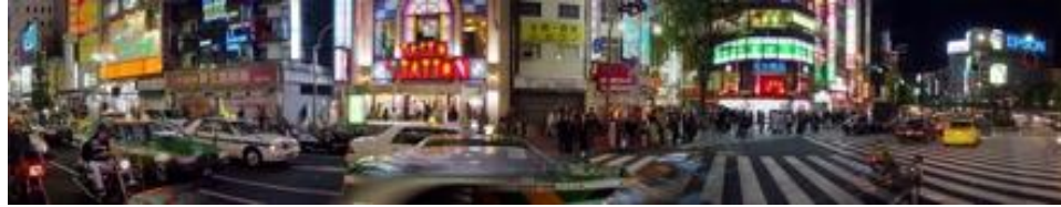
Fig. 4. Consume! This street marks the entrance to Kabukicho, the red-light district where fantasies are bought and sold. Tokyo, Japan, 2004.

In a city where the organicity of these born forms becomes too complex to comprehend, built matter almost fades into the background, into a mist of steel and concrete and the bold signs pop out, forming a complex semiotic network that multiplies itself and seems to be in constant dialogue (Fig. 3). The fact that these signs are bright does not necessarily mean that what they say is clear, and so this network actually sheathes the city with another layer of non-committal signification, another skin of ambiguity. Tokyo is a city of floating screens where advancements in technology have allowed the moving image to become a hologram, a sheath, a piece of skin (Fig. 4).