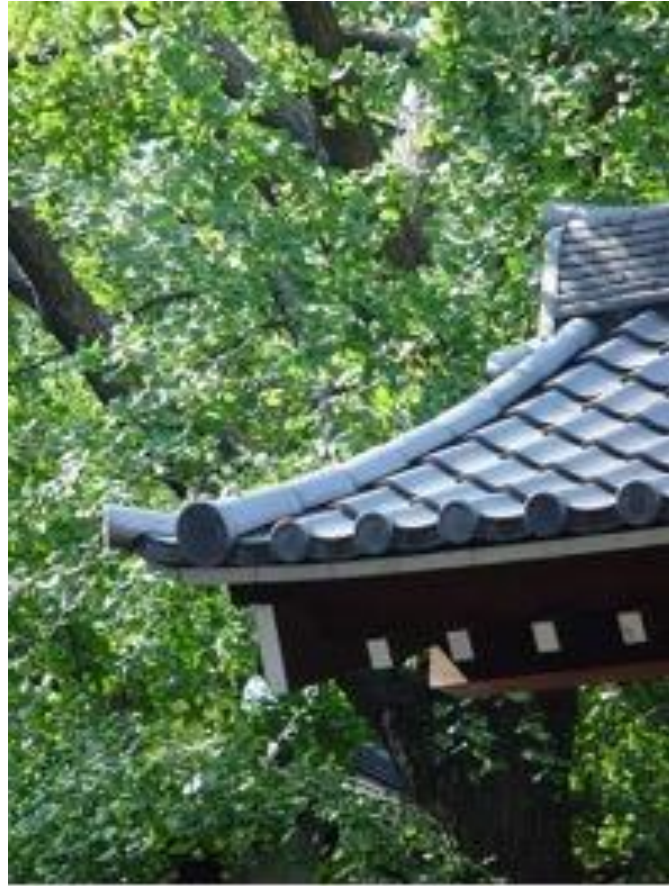
Fig. 6. Blurred Lines . The edge between architecture and nature, permanence and transience is fluid. Tokyo, Japan, 2005.

The transience of all things and the erosive power of nature and time over man and matter are tragedies that the West attempts to defy. The Western values being over non-being and its architecture (at least that of symbolic value) is built to stand the ages. Transience in Japanese philosophy, however, is not tragic and emptiness is not feared, but embraced: Zen speaks of the void as rich and full of meaning and possibility and of mushin 無心 or "anti-mind," which is unity with nature and the resignation to fate (Michihiro 227). Mushin are the gaps between things: spaces in a painting, blanks between lines in literature, silences between spoken words, stillnesses in motion. The teachings of Judo, Japanese martial art, derive from the related notion of mui 無為 or "anti-action" to defeat the opponent by using his own strength against him. The way of nature ( shizenkan ) is the unaffected and automatic power of spontaneous self-development and what results from that power (Andrews 17). While the West stands stubbornly in the face of the storm, Japan resigns itself to the power of shizenkan and lets itself be carried away by its winds. Traditional Japanese architecture is built with wood, which embraces nature and yields to time. Communication itself is highly non-verbal, higengo (literally "anti-word") and relies more on silence and ellipsis than on words and utterances (Fig. 6).