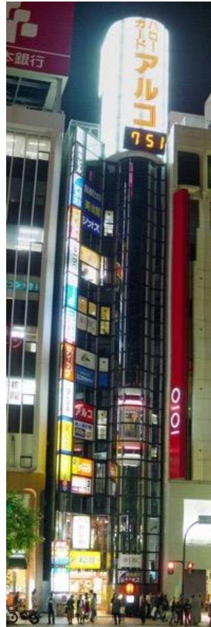
Fig. 2. Squeezed In . Buildings seem to compete for space. Tokyo, Japan, 2005.

Even if the street was empty, I waited at the red light—Japanese style so as to leave space for the spirits of the broken cars. Even if I was expecting no letter, I stopped at the general delivery window for one must honor the spirits of torn up letters. And at the air mail counter to salute the spirits of unmailed letters. I took to measure the unbearable vanity of the West that has never ceased to privilege being over non-being, what is spoken to what is left unsaid. Chris Marker, Sans Soleil .