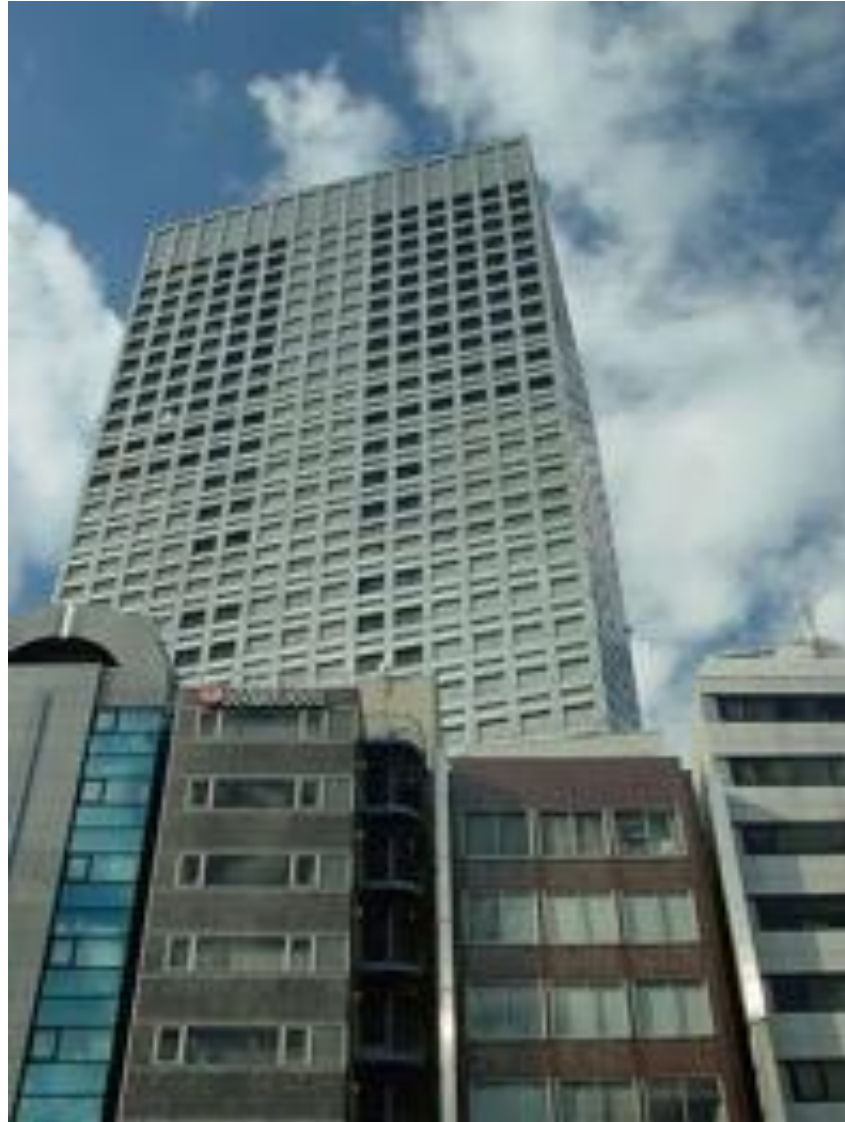
Fig. 1. Size Matters . Tokyo is rich with collisions of scale. Tokyo, Japan, 2005.

Space was off-limits. The only hope for survival lay in Time. Chris Marker, La Jetée .