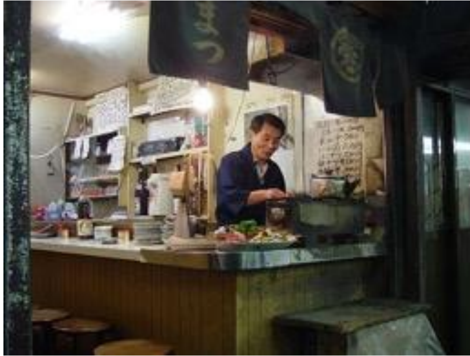
Fig. 5. Hole-in-the-wall . Tiny, semi-legal eateries fill pockets of the city. Tokyo, Japan, 2005.

Buddhism, with its emphasis on life's mutability, merges with this ideal. Time is not something to be overcome by struggle; it is rather to be lived with through acceptance of its laws. The Japanese value mono no aware is the sad, ephemeral and transient beauty of things. Mono is Japanese for "object" and aware is the sound of the sigh uttered when experiencing beauty (Andrews 29-30). The cherry blossom is of great cultural importance; it blooms for only about a week a year and its ephemeral beauty is celebrated by night long celebrations called hanami 花見 or "flower viewing." An object that ceases to function is more likely thrown away than repaired, since it has already lost its value anyway by ceasing to be new. Similarly, a building that requires serious renovation is more than likely replaced by an entirely new one, for the "the world is but a transient abode," and nothing must strive for permanence. Tokyo is organic, formed by the perpetual formation and reformation, even severing and discarding, of its parts. Like a hole-in-the-wall yakitoriya built (and subsequently demolished) by its owner, transience itself is a spectacle (Fig. 5).