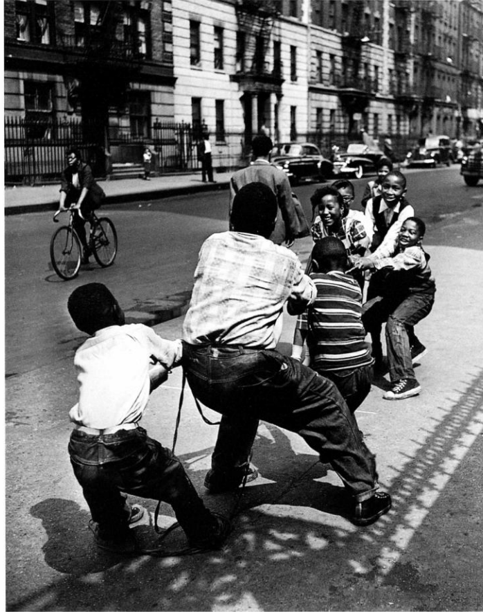
Tug of War (1947)