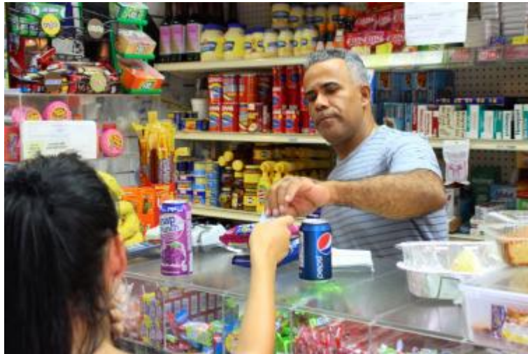
Bodega, Mott Haven, The Bronx.

In the suburbs there were fewer kids at the store because commercial activity was not allowed on most residential streets. Since planners presumed that shopping would be done by auto, stores were often located well beyond walking distance of housing. In some of the newer developments, no provision was made for sidewalks at all. So when youngsters wanted to buy junk food, candy or comics, they needed to ask for a ride, usually from their mother. When it came to getting to the store, a teenager without a driver's license seemed little better off than a toddler. Parents and small children often enjoyed the suburbs, but older brothers and sisters did not. 55