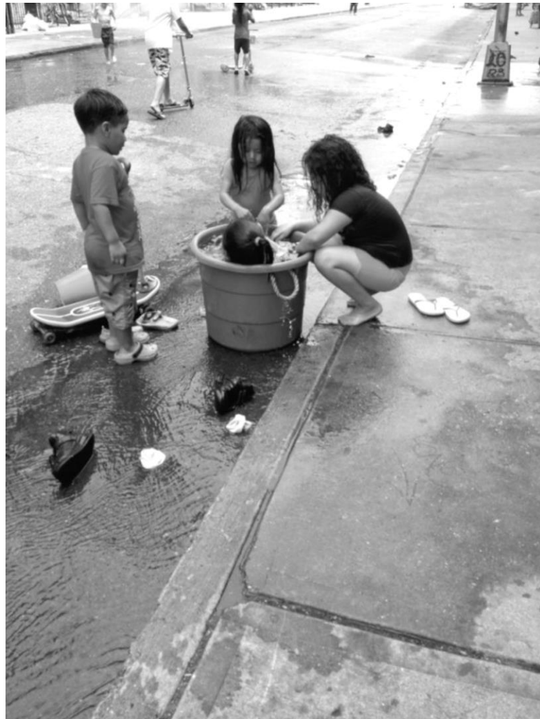
Street play in crowded Sunset Park, Brooklyn, where police still close streets and equip hydrants with sprinklers.