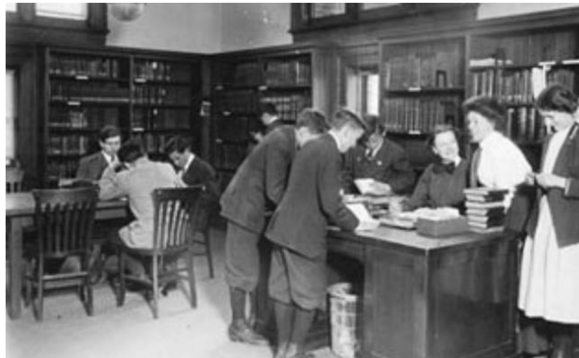
In the long peaceful reading room there were storybook tiles over the fireplace and covered deep wooden benches on each side of it where I read my way year after year from every story of King Alfred the Great to 'Twenty Thousand Leagues Under the Sea.' Alfred Kazin, A Walker in The City. 18 Stone Avenue Library, Brownsville, 1901.

Kazin's warm feelings for Brownsville's streets, shops and working people led him to write his celebrated memoir, A Walker in the City . When he needed to escape from the pressures of family and school, he played handball against the wall of his house and baseball in nearby empty lots. What ultimately seemed to shape this young man's life, however, was the Stone Avenue public library where he could read what he wanted. 17