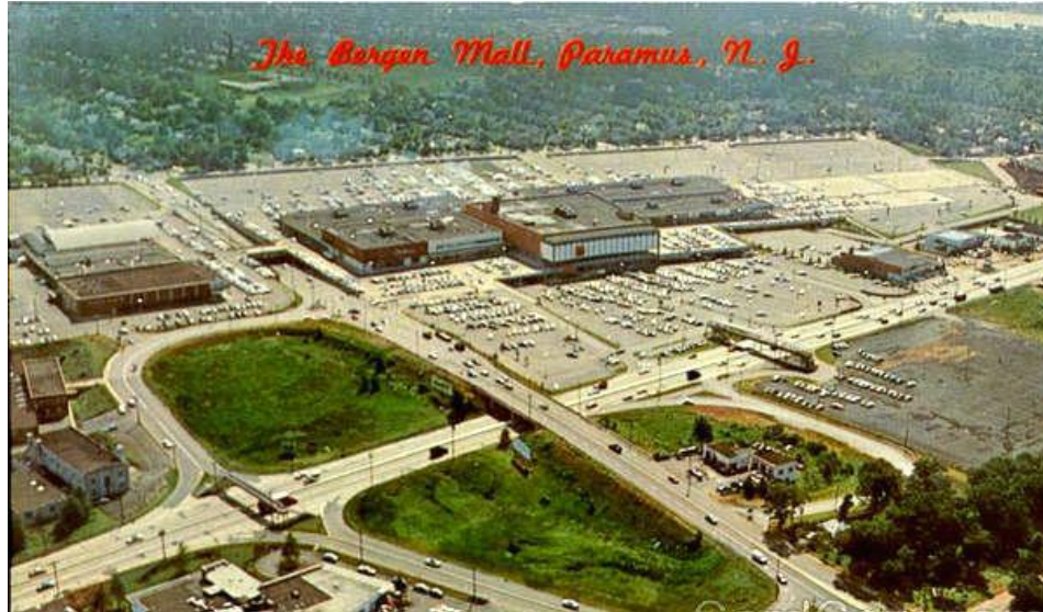
Bergen Mall c. 1957.