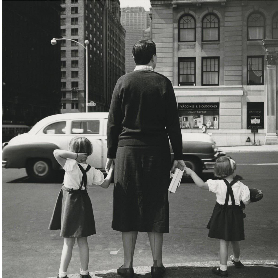
Privileged and protected. (Chicago? 1954). Untitled photo by Vivian Maier. Courtesy, estate of Vivian Maier.