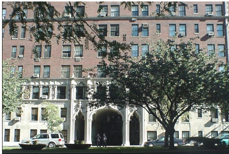
1185 Park Avenue... looked like a mock fortress, a combination cathedral and castle, secure, imposing... always two Irish doormen at the front and one at each entryway, their uniforms similar to police uniforms and at their waist... [a] billy stick...Anne (Roth) Roiphe, 1185 Park Avenue 31

This tale of the poor-little-rich girl comes across as joyless, not simply because the relations among parents, children and servants seem so cold, but also because the kids are cut off from the street and neighborhood. The saving grace for Anne may have been summer camp where she bunked with other girls and learned archery, swimming, and other sports. To the extent that camp allowed escape from the tensions of school and home, it served as a substitute for street and neighborhood with the obvious difference being that camp kids were under constant adult supervision. In our own time, when few children are free to roam, parents themselves assume the role of camp counselors, scheduling after-school and weekend activities to ensure that their children are suitably engaged or entertained—an obligation that would have bewildered previous generations of parents whose children's camp had been the city street.