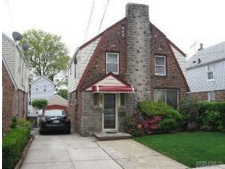
Cambria Heights: Irish-American and Italian-American in the fifties, African-American and West Indian today. Still a quiet waystation on the road to suburbia.

In Cambria Heights there were not enough kids playing outside to justify any street closings, though now and then a few boys could be seen playing stickball. At other times, out of sheer boredom, they ended up throwing rocks at street lamps.