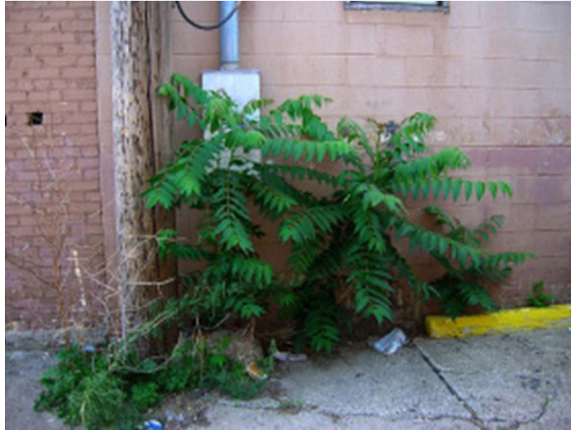
It grew in boarded-up lots and out of neglected rubbish heaps and it was the only tree that grew out of cement. It grew lushly, but only in the tenement districts. That was the kind of tree it was. It liked poor people. Betty Smith, A Tree Grows in Brooklyn . 9

Francie's story has for so long captivated prepubescent girls that we sometimes forget that A Tree Grows in Brooklyn , a 1943 adult best seller, offers an unparalleled view of turn-of-the century saloon-based politics, of ordinary people working in city shops, factories and offices, and of kids putting in endless hours in dull classrooms. The novel also provides a realistic account of a failed marriage, alcoholism, abortion and the activities of sexual predators. That the book has not been banned is probably because school librarians, parents, and politicians have not read it since junior high.