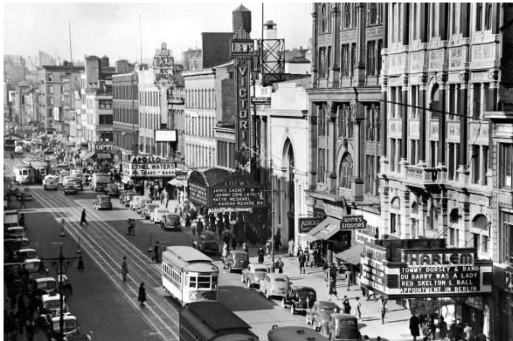
Despite the Great Depression, World War II, riots and segregation, the main street of black America looks far more prosperous in 1943 than now. Harlem, 125th Street looking west from Seventh Avenue (Adam Clayton Powell, Jr. Blvd.)

thirties and forties, the changes triggered by the enforcement of compulsory education and child labor laws were all but complete. With far more youngsters graduating from high school, employers could now demand a diploma for jobs where a grammar school certificate might have previously sufficed. 36 Under such circumstances, it was all the more difficult to raise a child in a poor, tough, neighborhood. In Ann Petry's The Street , a novel set in Harlem in the forties, Lutie Johnson, a single mother, wonders whether it was better to leave her eight-year old "alone in those dreary little rooms or ... playing in the street..?" The speeding traffic on 116th Street was the least of her worries. Of greater concern was that street gangs might recruit her son. But what drove her into a complete rage was her boy's modest request that he be allowed to shine shoes. For Lutie, the shoeshine boy was emblematic of the black man's failure to make his way in the city: "You're afraid if he is shining shoes at eight, he will be washing windows at sixteen and running an elevator at twenty-one... and you're afraid that this street will keep him from finishing high school." 37