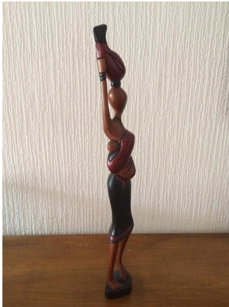
Fig. 2. African woman statuette. Wood. Market place, Dakar, Senegal, 2015.

This miniature woman, this oversized doll is a statuette of a particular kind. She resembles in color, size, and scanty garb the wooden statuettes of women one finds in the crowded markets of Dakar, Senegal. Sold as souvenirs for tourists, 2 for 25,000 CFA, but after some serious bargaining, 2 for 2,500 CFA, those statuettes of women are polished, poised, trophy-like, performing the stereotypical (at least, for the Westerner, who is often the buyer) female tasks: carrying a basket on top of her head or a baby tied to her back, or a hunting tool for her husband...Verticality as labor (Fig. 2).