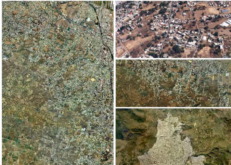
Fig. 10. Tendrils. These images reveal the shape of the city as a work in progress. At left, the urban footprint reaches into the agricultural hinterlands at the southern extreme of the metropolis, just west of the Camino Real. On the right (top), the small barrio of San Juan Minas takes shape south of Route 113. The built environment comprises a mix of urban and rural land uses, part barrio and part village, part metropolitan part agricultural. Clusters of small buildings spring up along the main streets, interspersed with houses on larger plots and open scrubland. In the center right image, the colonias of San Juan Tezompa and La Luz encroach on farmland; while located just outside of the D.F. in the State of Mexico, these communities are part of the ever-expanding conurbation. Malacates, shown at bottom right, is officially the northernmost point of Mexico City. It appears less like tendrils than a cascade of settlement climbing the hills as far as it can reach. The uniformly bright grey color of Malacates reveals an emergent neighborhood, where concrete block construction and its attendant dust coat the environment. The character of these precincts reveals the city as an always unfinished proposition, constantly being made and remade by the people who live there.