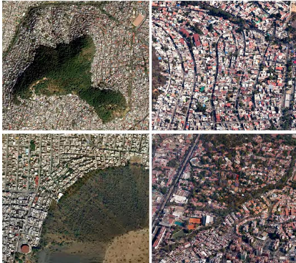
Fig. 8. Contours. The Cerro del Judio (top left), is an ecological reserve in the south of the city. The peak of the mountain can be seen in the center of the reserve, while the Rio Hidalgo traces the base to the north and west. Since the 1970s, new barrios have sprung up all around the park, with streets contoured along the topography of the mountain, creating gyres and eddies of built landscape. One of these barrios, El Tanque, can be seen at top right. El Tanque folds in ribbons around the Cerro del Judio with a series of eight contoured terraces that step steeply downward to the northeast. Each terrace level brackets a long undulating street lined with houses and shops. Many of the smaller streets that climb the slope are only one or two blocks long, so walkers and traffic must zigzag circuitously to climb or descend through the barrio. By contrast, the slopes of Xaltepec volcano (bottom left) prove too steep for building, so residents have wrapped the colonia San José Buenavista around the base of the cone. Following a watercourse rather than mountain terrain, the Avenida de Paseo (bottom right) runs on top of the Churubusco river, revealing one of the few remnants of the water's path. Massive Avenida Insurgentes, seen at far left, presents a dramatic contrast to the curvilinear Paseo.