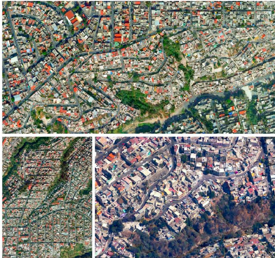
Fig. 7. Contours. When faced with significant topological barriers, city builders had to figure out strategies for extending the urban fabric. At top, the relatively ordered grid of colonia Presidentes ends where the folded forms of Piloto Adolfo López Mateos begin. At bottom right, houses and shops in working-class Piloto perch precariously on terraces sculpted into the sheer cliffs above Palmas creek. Very often the rooftop of one house meets the foundation of another as the neighborhood marches up the hillside. Streets wind along natural contours of the slope, tracing a topographical map of the barrio. An elaborate network of narrow staircases affords pedestrians vertical access between the long streets. Meanwhile, Presidentes, Lomas de Capúla, and other neighborhoods (bottom left) manage to retain gridded patterns, even if the aerial view obscures the often steeply graded streets. The grids persist right up to the edges of valley walls, at which point orthogonality dissipates into fractalated forms.