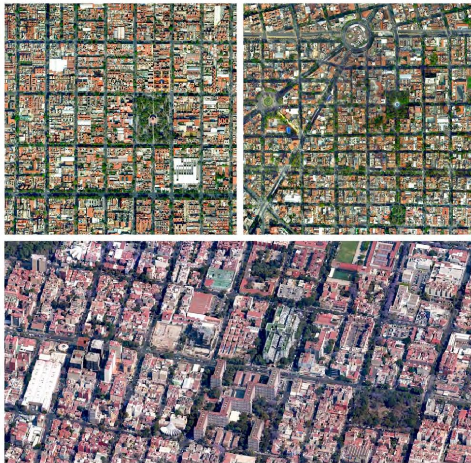
Fig. 4. Bounded grids. At top left, Santa María La Ribera is a late 19th century neighborhood carved out of an old hacienda, one of the first planned subdivisions outside of the Centro Historico. The dense residential fabric is composed primarily of large townhouses and courtyard buildings, many of which have been subdivided into vecindads (apartments). Colonia Roma (top right) presents a classic bourgeois urban landscape, built up in the early 20th century on former haciendas south of the center. The two round plazas were created during the massive reconstruction of the roadways in the 1920s and 1930s. In the bottom image, Colonia del Valle Centro was laid out in phases from the 1940s. The entire valley evinces a highly regular grid form with no discernible center. The colonia features a mixed residential stock comprised of townhouses on small lots and large apartment buildings of three to ten stories. The stair-step shaped complex is the Centro Urbano Presidente Alemán, a unidad habitacional designed by Mario Pani in 1947, and one of the first Corbusien-style projects built in the D.F.