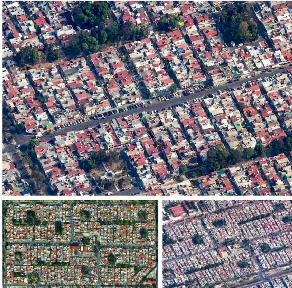
Fig. 5. Bounded grid, disrupted. In laying out the Colonia CTM Aragón, planners played with the grid form by breaking it up. Financed by the Confederation of Mexican Workers (CTM), the colonia reveals several design features unusual for Mexico City. A series of 16 linear and square green spaces ensure that most households have one within short distance. Residential stock is comprised predominantly of single-family townhouses rising two stories on modest footprints, with the space normally allotted to courtyards redistributed to the various green spaces. The central module contains a church, market, and schools. Streets afford limited ingress, and there is no way to traverse the colonia in an automobile. More unusual is the neighborhood's interior parking system, with vehicles restricted to designated thoroughfares, and many houses only accessible via narrow pedestrian walkways. These various features are reminiscent of the 'New Town in the City' planning approach of the 1960s and 1970s. While manifestly a grid, the urban morphology of the neighborhood also has a diagrammatic quality to it (see Figure 6 below).