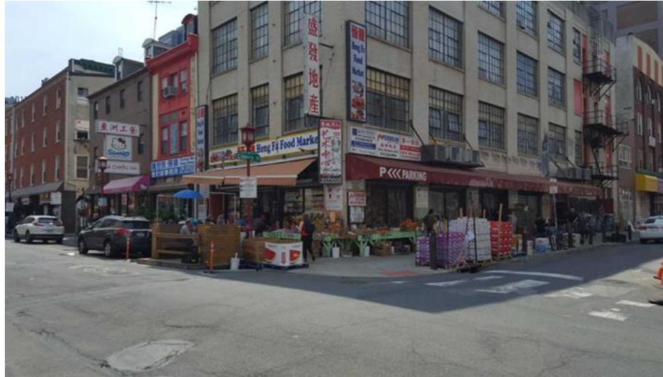
Fig. 5. Layers of meaning: street level and signage climbing upper floors in Philadelphia Chinatown.

The vivid commercial signage that bombards us across multiple facades and floors in Chinatowns coexists with a more official vertical recognition of the legitimacy of Chinese space. While a Chinatown arch, as McDonogh has argued in "Open Portals: Gateways and Chinatowns," is the most soaring multi-government-sponsored vertical symbol of many Chinatowns worldwide (McDonogh 252-263), in many cities official street signs may also include Chinese translations and calligraphy. Street furniture such as the red lantern light poles of parts of Philadelphia Chinatown also involve government legitimization as does a Pennsylvania State Historical Marker on Race Street (in English) commemorating the birth of Philadelphia's Chinatown. Ironically, another plaque in English and Chinese on the first-floor wall of a nearby restaurant restates this claim as made by a competing Chinese organization.