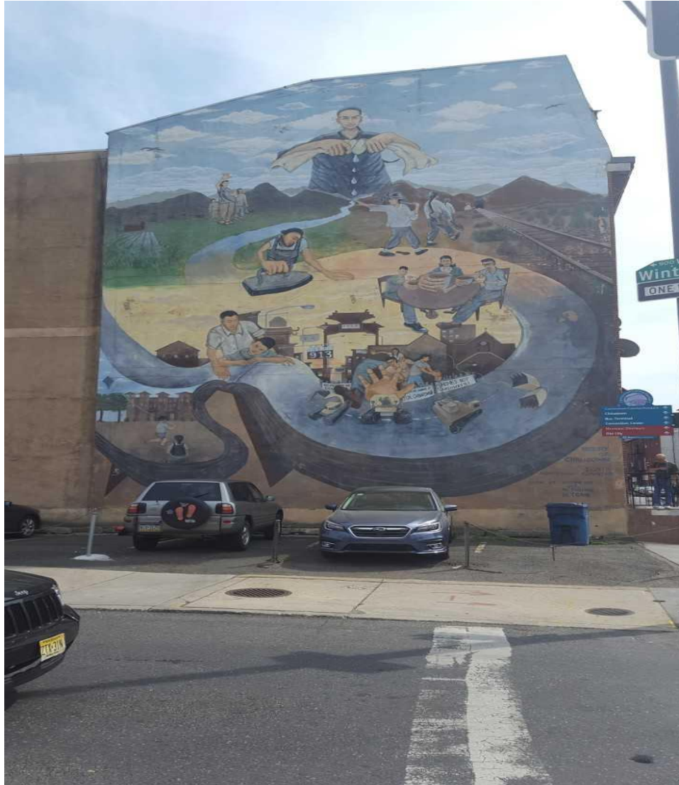
Fig. 4: Multi-story historical mural in Philadelphia Chinatown, 2018.

More insistently, commercial signage playing with neon and various Chinese and Western calligraphies claim our attention above eye level. In fact, the celebration of signage is one of the characteristic images of Chinatowns on posters at the same time as it heightens the commercial interactions of the street, drawing us into restaurants, bubble tea stores, or Karaoke clubs (Figure 5).