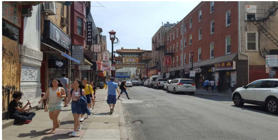
Fig. 3. 10 th Street, Philadelphia and Chinatown Arch, 2018.