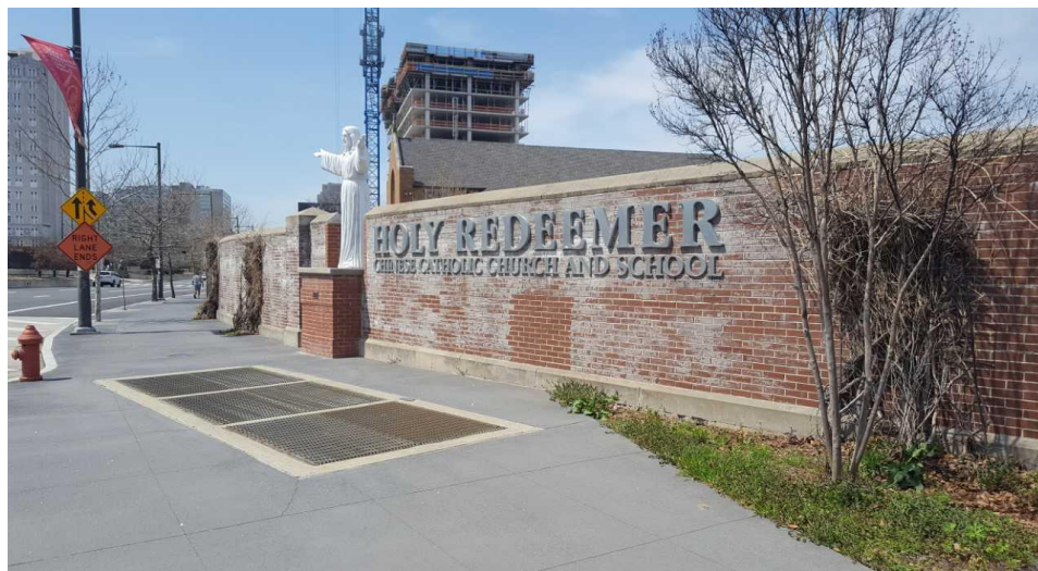
Fig. 10. Eastern Tower seen past the protective wall surrounding the Chinese Roman Catholic Parish and School of Holy Redeemer, Philadelphia, 2018.

As the local Philadelphia The Inquirer architecture critic Inga Saffron noted in 2016, the Eastern Tower will not only anchor and change the Chinese presence in the neighborhood, but may also transform the cultural readings of the lower depths of the expressway that separates the two sections of the Chinese enclave. As she concludes: “A busy highway may not sound like the most desirable location for an apartment house. But the architects think about the environment as a landscape, with the expressway as a fast-flowing river... Feng shui, a Chinese practice historically used to orient buildings, favors locations facing water,” (Saffron). Again, the claims of verticality transform our geography and imaginary of the city as a whole.