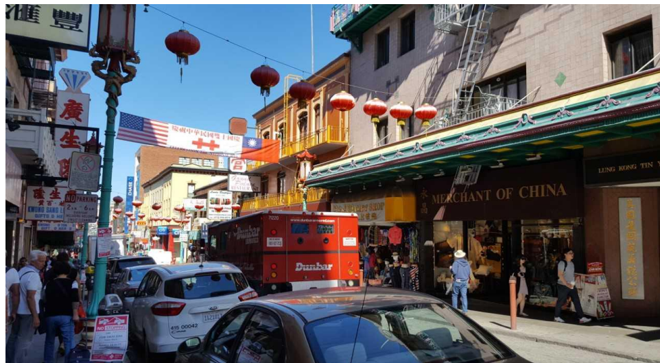
Fig. 1. Streetscape of San Francisco Chinatown 2017.

Nonetheless, as the work of many people who have dealt with the architecture and societies of varied Chinatowns remind us, what we see at first embodies only part of the complexity of Chinatowns, as such places are also enacted vertically in both social formations and imaginations. Indeed, for more than a century, as Ivan Light has pointed out in "From Vice District to Tourist Attraction: The Moral Career of American Chinatowns, 1880-1940," Chinatown