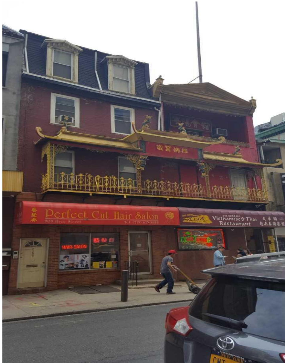
Fig. 9. Interplay of fire escapes, balconies, and roof in Philadelphia Chinatown, Race Street, 2018. Note contrast of commercial entries and doors to upper floors.

Despite—or because of—the generally lower scale of buildings in Chinatowns across the northeastern United States, other meanings are evoked when high-rise Chinese buildings soar above the landscape. The sheer verticality of such projects, built with capital and support from local and global Chinese multinationals, makes visible statements about Chinese presence within the larger city. The 44 story (433 feet/132 meters high) Confucius Plaza cooperative apartment in Manhattan's Chinatown, for example, while scarcely rivalling the great skyscrapers of the city, nonetheless soars distinctively above surrounding neighborhoods and is visible from the distance of many blocks. Similarly, in the Philadelphia's North Chinatown, an area of conflict between Chinatown