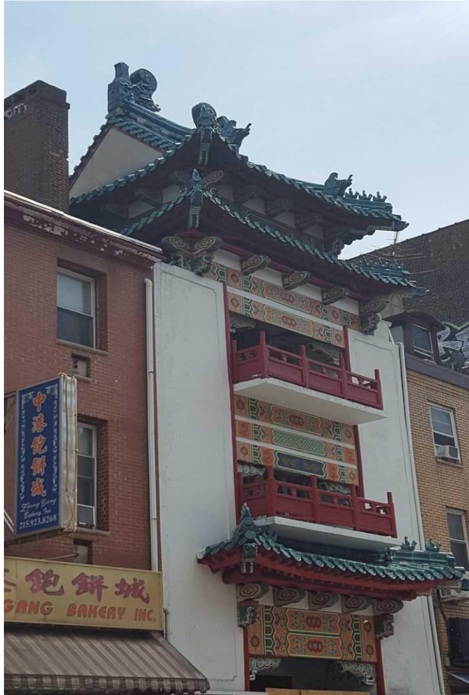
Fig. 8. Sinicizing a building through Chinese ornament and roof, Philadelphia 2018.

The use of this crowning feature, in fact, has been well-explored by Philip Choy in his 2012 survey of the architecture of San Francisco's Chinatown. By the mid-nineteenth century he noted that metal overhangs, balconies, lanterns, and signs were added to Victorian buildings. When rebuilding Chinatown despite urban opposition after the 1906 Earthquake, elites made their buildings become