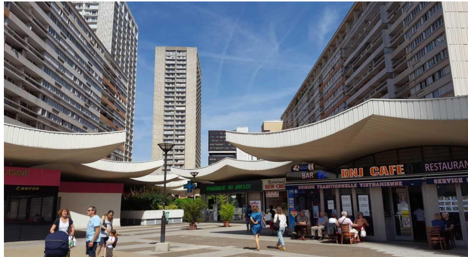
Fig. 7. Platform level and skyscrapers in Les Olympiades in one of Paris' Chinatowns (13 th Arrondissement), 2017.

In Latin American Chinatowns like in Havana and Lima, by contrast, most buildings rise only 2-3 stories like nearby buildings of the historic center; the same can be said for the shop houses of Singapore's somewhat artificial Chinatown. In the U.S., Chinatowns vary with the general fabric of their surrounding—2 to 3 stories in central Los Angeles, but reaching 4, 6, or more stories in San Francisco, Chicago, Philadelphia, and New York's multiple Chinatowns. New suburban malls by Chinese multinationals for Chinese multinationals, are often the most sprawling and horizontal Chinatowns, although multi-story Hispano-Chinese towers can be found in enclaves like San Gabriel, near Los Angeles.