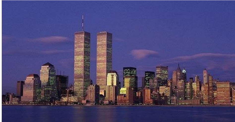
Fig. 7. An archetypical landscape of power: the New York skyline before September 11, 2001 (with the Twin Towers).

One of New York's bestselling photographic books is called precisely New York Vertical (Hammann). An award-winning pictorial tribute to the world's most vertical city, New York Vertical , by German photographer Horst Hammann, offers a unique introduction to New York's spectacular architecture: