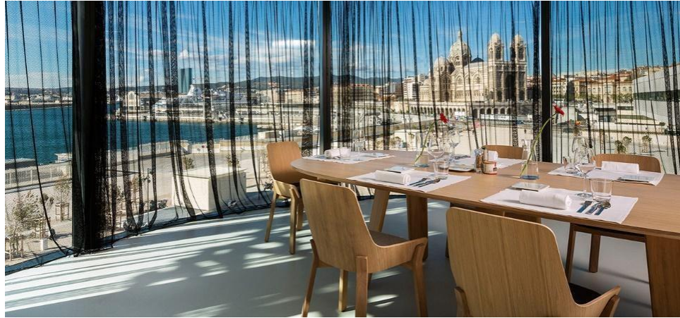
Fig. 4. View from Le Môle Passadat restaurant, on the top floor of MUCEM, Marseilles. “Perched on the roof of the MuCEM, Le Môle Passadat offers an unbeatable view of the Mediterranean and Marseille Cathedral La Major.” (“Le Môle Passadat”).

Note that the last floor of MUCEM does offer a stunning 360° view over its coastal and maritime surroundings (see Figure 4).