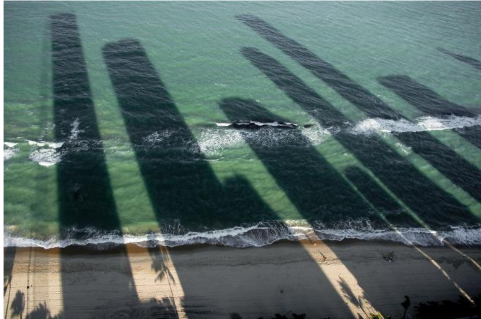
Fig. 1. A picture from the 2009 documentary film Um lugar ao sol (High-Rise) . The picture suggests the verticalization of Brazilian cities, one of the consequences of which is... the limited space for sunbathing on the beach (here at Boa Viagem, in the Northeastern city of Recife).

There is a form of aestheticized “solutionism” (Morozov) attached to the construction of cable-cars above slums (La Barre). In Medellin or Rio de Janeiro, public transportation has been “solved from above:” while the inextricable labyrinths of tiny streets and alleys could never be destroyed entirely, they have been dealt with the flyover approach, and a form of vertical “aestheticization of poverty” (Harvey). Now that the famed “favela tours” have also expanded vertically, territories of survival long abandoned by the State are somehow being mapped and controlled through vertical visibility. The attractiveness of seeing the world from above has been applied to flying over the immense favelas by cable-car, which is another way of claiming that “view sells.”