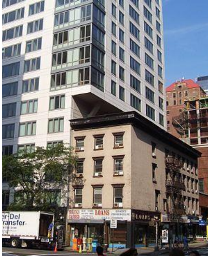
Fig. 2. An example of air rights in use: a high-rise building extends over a four-story building in Manhattan, 2010.