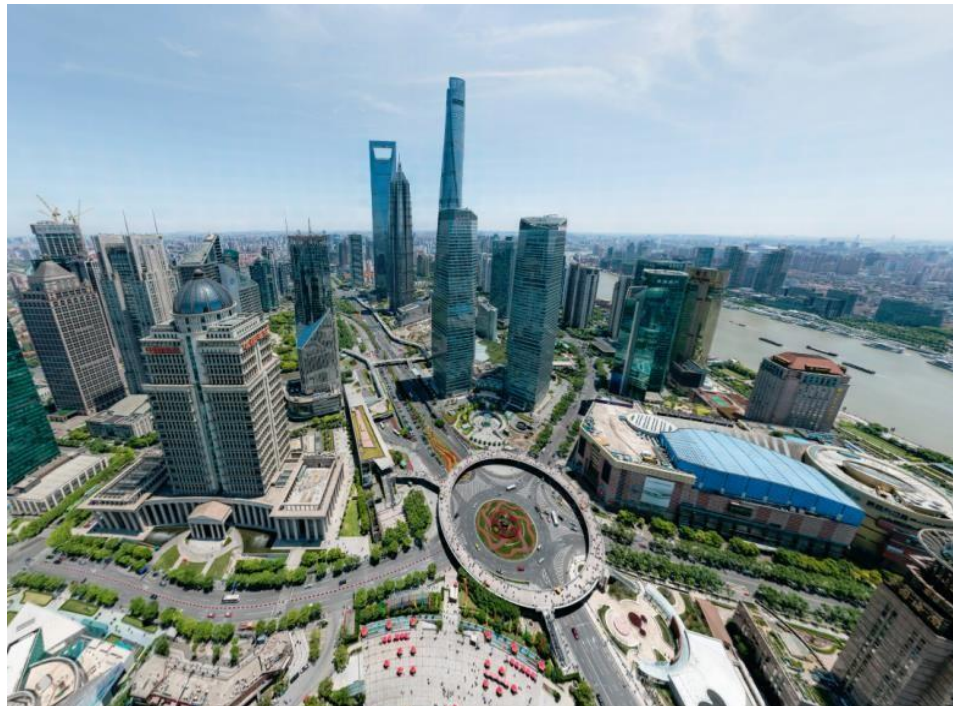
Fig. 6. 195-gigapixel photo taken from high on the Oriental Pearl Tower in Shanghai, 2018.

While viewing their aerial footage may provide fun and excitement, drones are in fact used primarily by the State to control activities and defend territories (Chamayou); there is, indeed, a “politics of verticality” (Weizman) where territory is key, defense paramount. As camera technology reaches incredible milestones, it is in fact bound to be used primarily for mass surveillance. We have seen recently the amazing sophistication of the “big pixel” photo of Shanghai by a new Chinese satellite quantum technology (Figure 6), and can easily imagine how this translates already, in terms of surveillance from above. “This 195-gigapixel photo of Shanghai is so huge you can zoom in from miles away and see people’s faces,” says one news headline (Wehner; see also Borines). Note that the photograph shown here is only a portion of the panorama shot by China’s Jingkun Technology (calling themselves “Big Pixel”). An online tool to zoom in and out is available at the company’s website: http://www.bigpixel.cn/t/5834170785f26b37002af46d (accessed on 24 Mar. 2019)