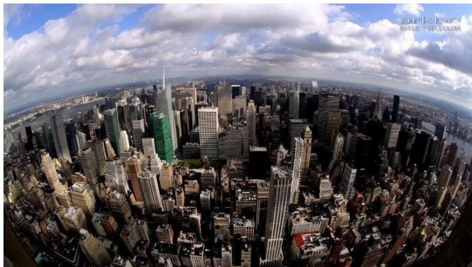
Fig. 5. New York City aerial drone footage, 2017. Image source: https://www.youtube.com/watch?v=CgE8izEPIe4 .

A drone, in technological terms, is an unmanned aircraft. Drones are more formally known as unmanned aerial vehicles (UAVs) or unmanned aircraft systems (UASes). Essentially, a drone is a flying robot that can be remotely controlled or fly autonomously through software-controlled flight plans in their embedded systems, working in conjunction with onboard sensors and GPS. In the recent past, UAVs were most often associated with the military, where they were used initially for anti-aircraft target practice, intelligence gathering and then, more controversially, as weapons platforms. Drones are now also used in a wide range of civilian roles ranging from search and rescue, surveillance, traffic monitoring, weather monitoring and firefighting, to personal drones and business drone-based photography, as well as videography, agriculture and even delivery services. (Rouse—see Figure 5).