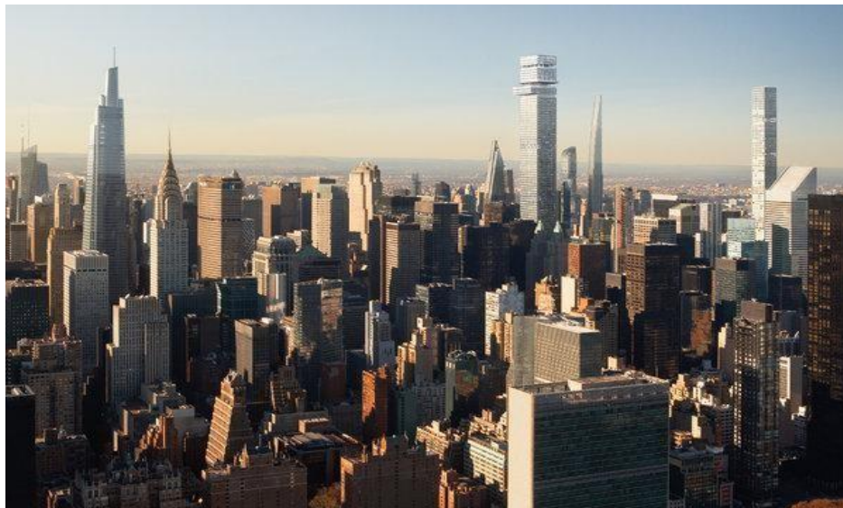
Fig. 9. A rendering shows how Tower Fifth would look soaring over Manhattan. Image source: https://www.nytimes.com/2019/01/18/nyregion/harry-macklowe-skyscrapernyc.html .