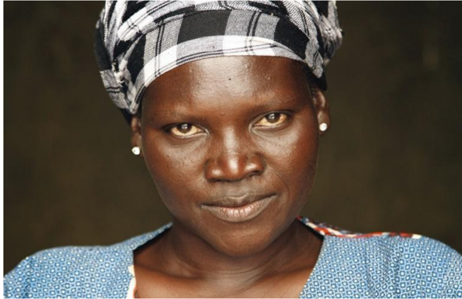
Fig. 7. Yann Arthus-Bertrand, Aïda, Senegal (from the 2015 Human movie). Image source: https://www.theatlantic.com/photo/2015/09/what-it-means-to-behuman-by-yann-arthus-bertrand/407200/ .

The picture above (Figure 7) is taken from photographer Yann Arthus-Bertrand's movie, Human . Well known for his Earth from Above project, Arthus-Bertrand has spent three years collecting stories from more than 2,000 people in 60 countries. The film recounts many of them, interspersed with stunning portraits and the sort of aerial imagery he is famous for, depicting the human condition and our interactions with the Earth. In the 2019 release Woman , directed with Anastasia Mikova, Arthus-Bertrand has crossed 40 countries, done 3000 interviews, and 50 shootings.