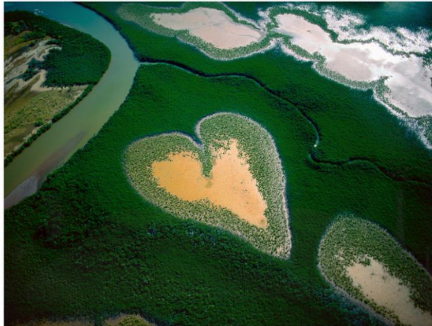
Fig. 2. Yann Arthus-Bertrand, The Heart of Voh, New Caledonia, France, 1990 (from the 1999 book Earth from Above).