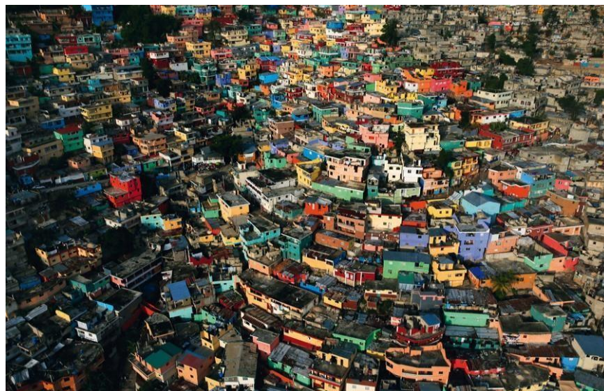
Fig. 3. Yann Arthus-Bertrand, Jalousie , a shantytown on the edge of Pétionville, a suburb of Port-au-Prince, Haiti (from the 2015 Human movie). Parts of Jalousie were repainted in bright colors in 2013 as part of the Haitian government's Beauty versus Poverty initiative. Most houses still do not have water or electricity. The earthquake in 2010 left 1.3 million homeless. Many were relocated to camps, but reconstruction is slow-going. Worldwide, shantytowns shelter nearly one billion people; 27 million people are added to these numbers every year. Image source: https://www.theatlantic.com/photo/2015/09/what-it-means-to-be-human-by-yannarthus-bertrand/407200/ .