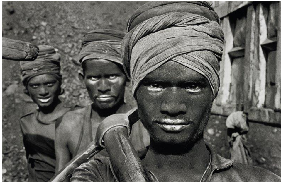
Fig. 1. Sebastião Salgado, Coal Workers, India, 1989 (from the 1993 book Workers: Archaeology of the Industrial Age ).

both horizontality and verticality merge into a certain form of virtual immediacy (Figure 5).