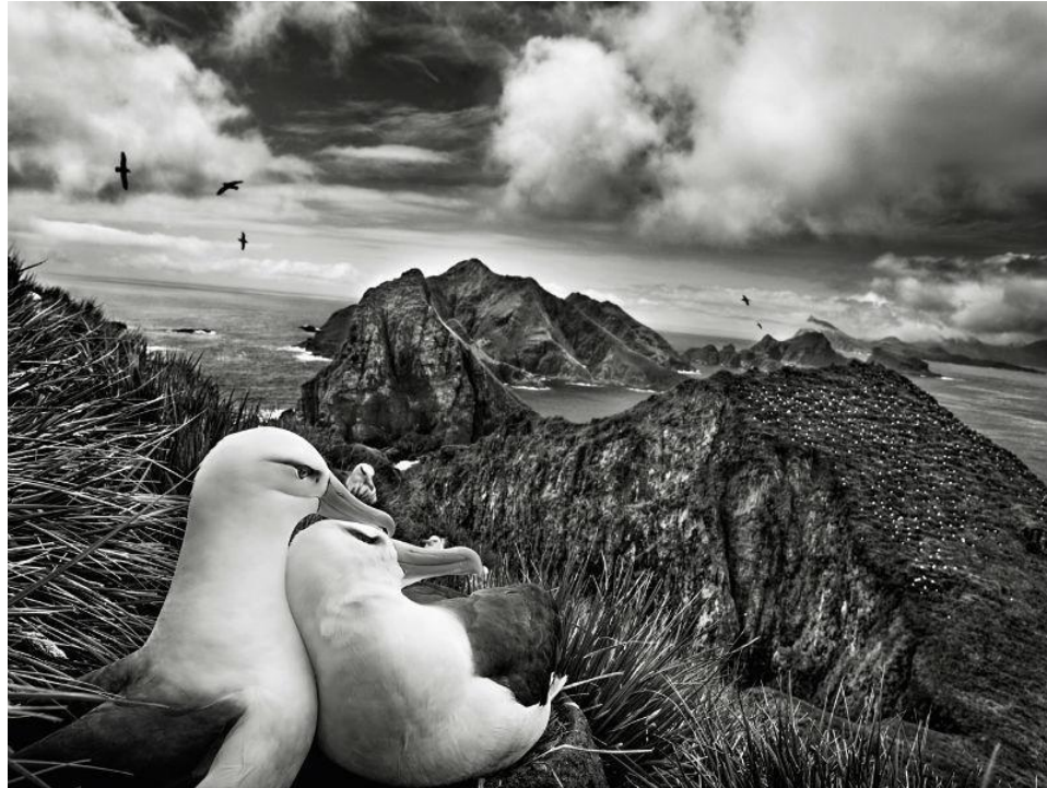
Fig. 6. Sebastião Salgado, image taken from the 2013 book Genesis.