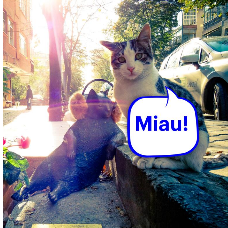
Figure 2. A cat saying “Miau!” next to the statue of Tomboli, wearing earmuffs, in Istanbul (2016, B. Fakhmzadeh).