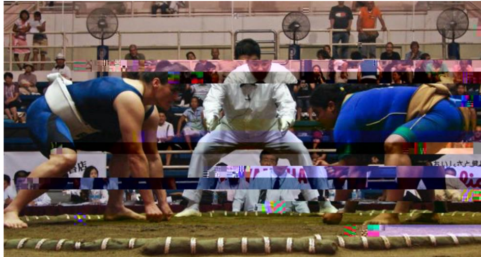
Figure 4. A glitched image of two sumo wrestlers, taken at the World Sumo Championships (2007, B. Fakhmzadeh).

including a venue is whether beer is served. As with Kompl , the app does not include indicators of reported quality or popularity, which provides a randomised, but directive, experience. By having the users pick their destination based on atypical criteria, or no criteria at all, the app nudges the user towards embracing discovery.