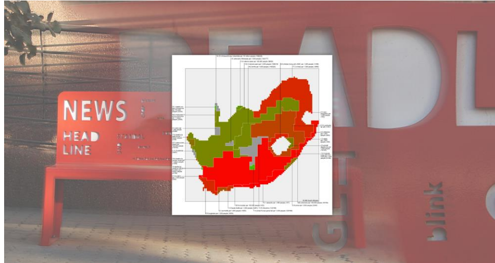
Figure 3. Statistics on South Africa mapped to visualise the map of South Africa superimposed on a composite photo of a red bench containing punched out words and phrases connected to the news industry (2007, B. Fakhamzadeh).

However, though limited research on the topic exists, personalisation in Google's particularly location-based search results seems small (Hannák et. al. 2013), to a degree that, according to some research, it appears negligible (Krafft et. al. 2019). In fact, research indicates that the primary drivers for search personalisation are whether the user is logged in (not who is logged in), and the (perceived) location of the user's IP address (Hannák et. al. 2017). This suggests that, independent of who is asking a location based service for, say, a nearby Thai restaurant, the list of results will be very similar if they are in a similar physical location. As the observable metrics (price range, popularity ranking, etc.) of the matching results will be the same for different users, each user will decide which restaurant to pick, based on the same values of these metrics. This means we are more likely to pick the same destinations; those that are ranked as "the best" or "most popular."