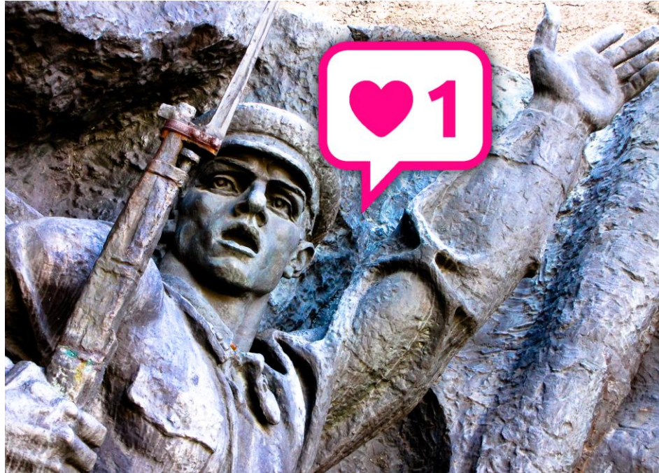
Figure 5. The statue of a soldier in the National Museum of History of Great Patriotic War in Kiev receives one heart. (2009, B. Fakhamzadeh).

Many of the task cards in Dérive app suggest using the senses to discover and uncover place. Visual culture is becoming more standardized throughout the world, and how we visually interpret the world around us is becoming more and more uniform. But, how are we to interpret smell, sound or touch, which are mostly absent as aspects of our globalised culture? This is much more individual, and thus more unique. Observing the smell of a place, or the way it sounds, particularly when overlaid with sounds presented through the consumption of a sound walk, creates a unique experience which can not be repeated, while taking in a much broader scope of the sensory range of the individual.