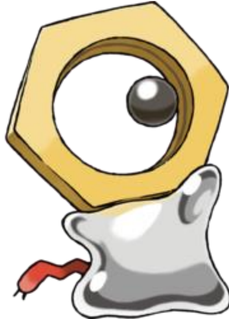
Figure 1. Meltan, the Hex Nut Pokémon, was first teased through a Pokémon GO promotional event in September 2018.

“Quick, quick! This way!” I whisper-shouted to my companion as I powerwalked along side streets and alleys in the heart of Jaffna’s market district, crossing significant social boundaries surrounding caste and thus breaking numerous local norms of public comportment. But there was a special event happening in the digital space of Pokémon GO at the time and Meltan, a mysterious new creature, was popping up randomly on the in-game radar (McWhertor 2018). As a long-time fan of the franchise, the chance to discover the first app-specific monster was exciting in a way that revived me after long hours of ethnographic fieldwork with the community of rickshaw drivers we had just we left.