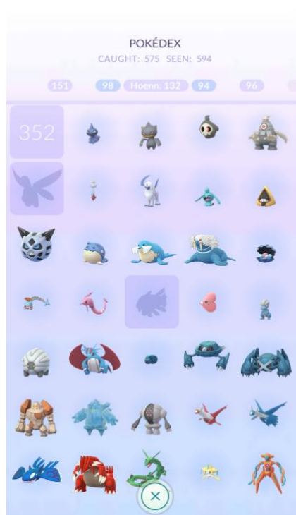
Figure 3. A screenshot of the games' compendium of known Pokémon. Unknown creatures are represented with a numeric placeholder. Discovered but uncaptured creatures are shown as a silhouette. The uncaptured creatures shown here can only be obtained in Africa (second row from top) and the small islands east of Australia (fourth row).

The success of Pokémon GO, which earned nearly a billion dollars in 2019 (Chapple 2020), relies on the way the Pokémon franchise has long deployed capitalist logics to encourage play. In her study of millennial Japanese pop culture, Anne Allison notes how Pokémon became a bonafide social phenomenon through the built-in necessity to interact and exchange creatures with other players (2006: 197-201). This converts the creatures into something of a cross between gifts and commodities that, in their variability, are imminently collectable and thus valuable. 5 Further, as the creatures are often only available in certain kinds of places, the franchise has long been connected to modernist cartographic principles, imploring the player to explore in order to discover and obtain as many Pokémon as possible (Allison 2006: 212).