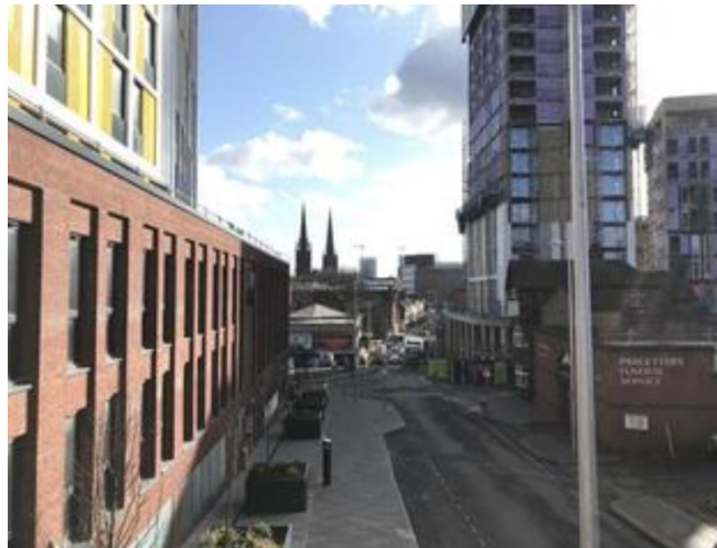
Figure 11.