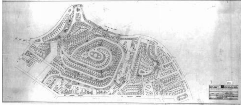
Fig. 2. Morro do Palácio Condominium Project, 1960.

as it allows us to situate the degree of intensity of the neighborhood's noise perceptions.