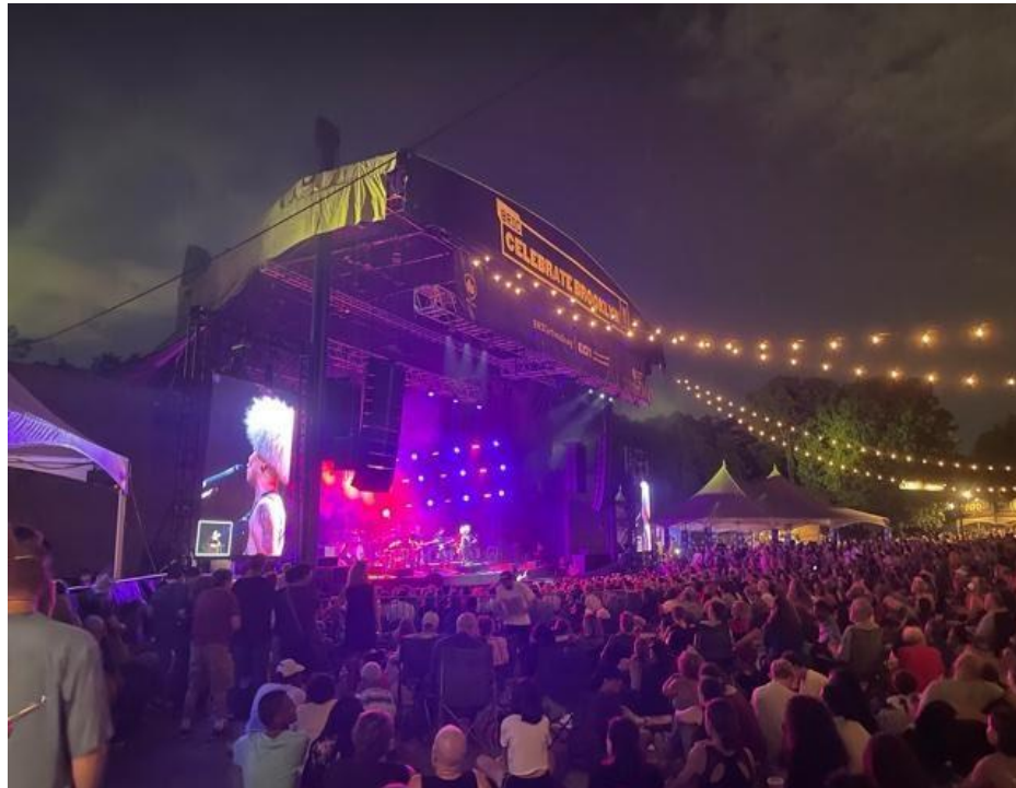
Fig. 12. Lady Blackbird at Celebrate Brooklyn, Prospect Park, Brooklyn, New York. Sept. 18, 2021.