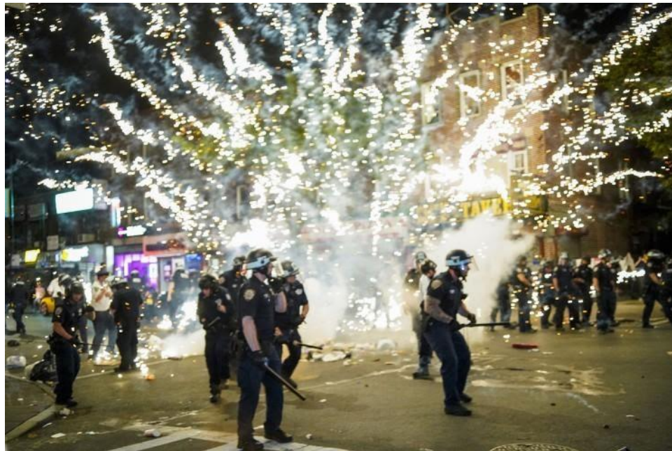
Fig. 2. "Fireworks explode on a group of NYPD officers during a clash with George Floyd protesters." The New York Post, June 15, 2020. Fueled by the desire to challenge authority, illegal fireworks punctured the urban soundscapes. Between June 1-June 14, 2020, there were 849 fireworks complaints on 311; in 2019, only 21. https://nypost.com/2020/06/15/illegal-fireworks-complaints-in-nyc-soar-under-lockdown

night after night, firecrackers would go off, one after the other, or many at once, on and on, all night long. They sounded like gunshots, except, who was so rich to have so much ammunition? If you listened long enough, you could identify the general direction where they were coming from. At home, we were guessing, this must be from a block away, from the building between Rogers and Bedford. Or, this must be two blocks away, from the buildings on Clarkson. Sure enough, when we walked around these areas in the morning, we would see the now empty packages of firecrackers, oh, so many of them, next to empty bottles of Hennessy. Why so many firecrackers? Where did they buy them? Perhaps they ordered them on Amazon? Boxes and boxes of firecrackers. All made in China. How much money was spent on these firecrackers? They were the response of residents crazed from the pandemic, staying inside for too long, people who could not do what they like to do and when they like to do it and who they like to do it with. It was their way to mark their territory by perhaps celebratory perhaps aggressive sound, saying, we are still here, and we don't care if we disturb everyone, we are alive, and we choose to crack these firecrackers because yes, it is illegal, but yes, we can do it. And we can keep doing it (Fig. 2).