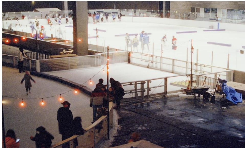
Fig. 3. LeFrak Center at Lakeside, Prospect Park, Brooklyn, New York. January 2021.

...We were not only ice skating, we were dancing: the spirits were high, everyone was talking to everyone...new friendships were formed, old friendships were rekindled...our conversations were filled with fun: despite the masks, we could hear each other talk, laugh, sing. No one dared take a break from the rink: the energy had us all roped in: what if we missed the best song?! We anticipated each song with the excitement of a kid in a toy store, at awe with each selection. Everyone: regulars and newcomers, current and former workers, welcomed this new but exciting character to every conversation: the good music! The good music helped create a great mood, which we all shared together. We were all ice skating but more than that, we were actively building togetherness, against the loneliness and the fears and the uncertainties. This was the party we had longed for, for a whole pandemic year, where music did its best: brought us all together, to enjoy each other's company, and create a community. On Saturday nights, from 7 to 9 pm, everyone belonged (Fig. 3).