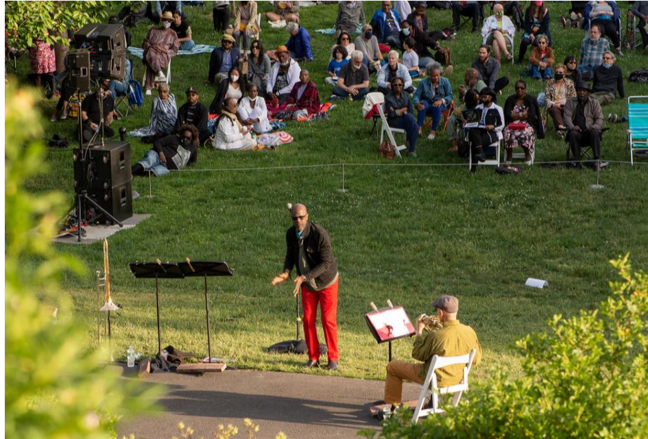
Fig. 7. Craig Harris and the Nation of Imagination performing “Breathe” at the Brooklyn Botanic Garden, Brooklyn, New York, on May 25, 2021.

Together with these-small scale, neighborhood concerts, large-scale concerts took place as well, such as Craig Harris and The Nation of Imagination performing “Breathe” on May 25, 2021 (Fig. 7), for the anniversary of George Floyd’s murder at the Brooklyn Botanic Garden, where viewers found respite from the forever busy and noisy Flatbush Ave and Eastern Parkway.