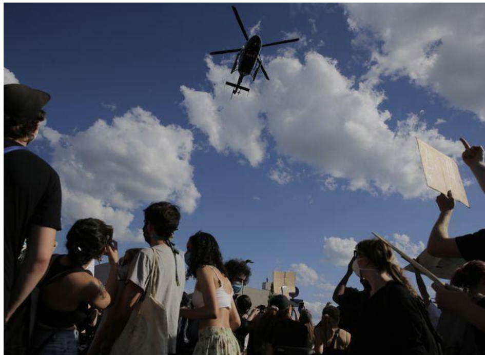
Fig. 1. "Protesters react to a low flying helicopter during a march on May 30, 2020, in Brooklyn." The Gothamist , June 23, 2020. To surveil and intimidate protesters, helicopters flew as low as 500 feet. A helicopter costs about $10 million; fuel and other expenses – about $1,600 per hour. Between May 29-June 16, 2020 four NYPD helicopters monitored protests for a total of 186 hours. https://gothamist.com/news/how-low-did-those-nypd-helicopters-go-recent-protests .

The helicopters captured the fear: the fear of the protesting masses, of movement on the ground, of community work, of citizens who have had it, of people who were too sick of senseless murders, of those who couldn't flinch in the eye of the virus. The helicopters produced an auditory assault; they were the tool of sound terrorism that was supposed to make everyone afraid, to make everyone fearful of people getting together, and to anticipate danger where danger did not really exist. The sound attack of the helicopters was the only way for the NYPD to feel in control over a situation that they had long lost control over, or never could control in the first place (Fig. 1).