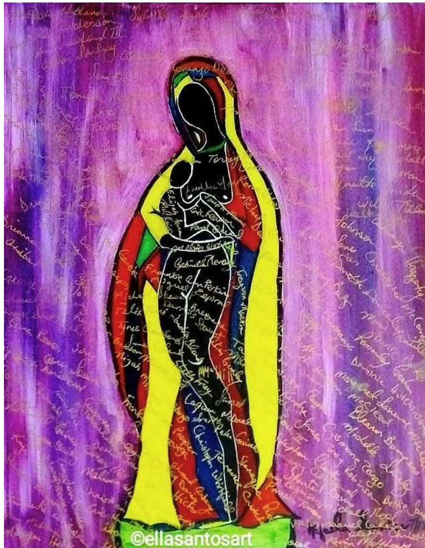
Fig. 3. Our day of the dead is daily, we memorialize them, in our hearts, with their oral histories, they live forever. Rafaela Santos. Forever In My Heart . 2020. Acrylic on archival canvas. 16 in x 20 in.