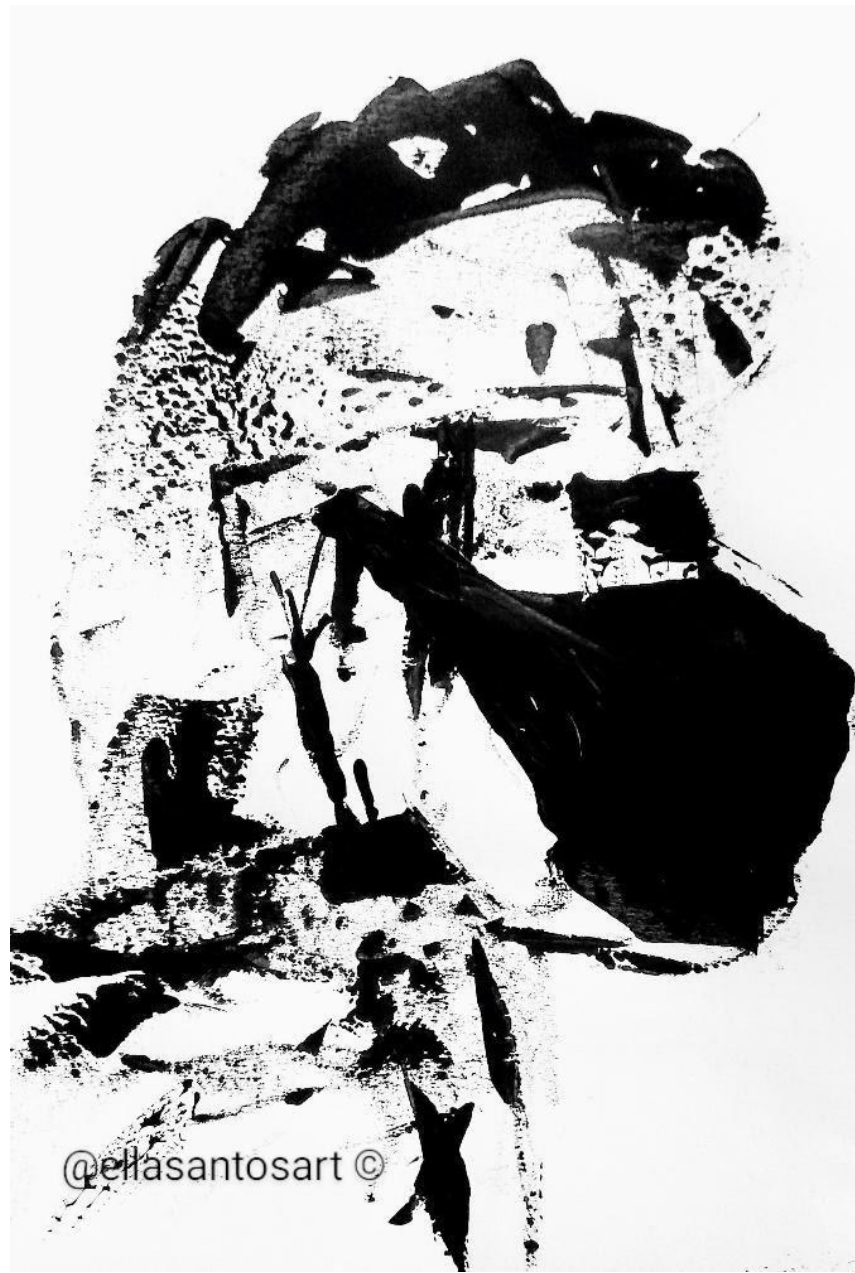
Fig. 1. The muzzle can finally be removed. No longer do brown and black peoples feel the need to keep quiet and yet, when we do take off the muzzle, we still risk dying. Rafaela Santos. Silenced No More . 2020. Acrylic on archival paper. 15 in x 22 in.