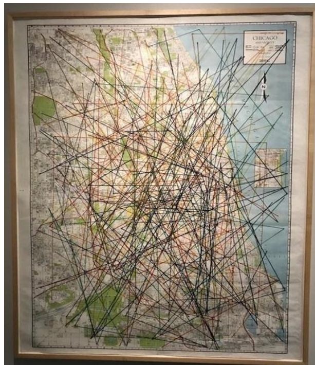
Fig. 2: A Dip in the Lake: Ten Quicksteps, Sixty-two Waltzes, and Fifty-six Marches for Chicago and Vicinity , by John Cage, 1978.

In 1978, John Cage created a rhizomatic map entitled A Dip in the Lake: Ten Quicksteps, Sixty-two Waltzes, and Fifty-six Marches for Chicago and Vicinity . A series of lines crisscrosses the city corresponding to the particular forms enumerated in the work's title. These certainly would have been considered older genres of dance and music by the time Cage produced this work. For the Fourth of July parade in Peoria or the Arthur Murray jet set. According to one source, "After producing the map, Cage published a separate document that outlined all of the 'steps' by listing each street intersection where the lines on the map met...Cage did not leave very specific instructions about what to do with this information. Instead, in a type-written message at the beginning of the nine-page list, Cage simply explains that this is: 'For performer(s) or listener(s) or record maker(s)'" ( Watkins ). Looking at the map, I try to imagine the choreographed movements and dissonant soundscapes that Chicago might have unleashed had the city ever tried to perform the piece (Fig. 2).