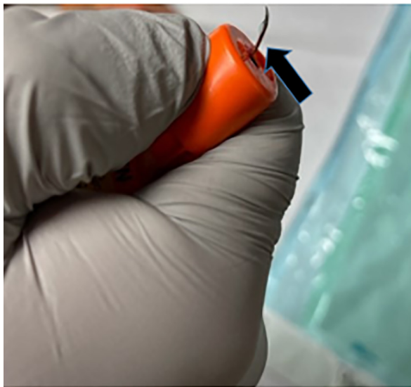
Image 3. Removed epinephrine auto-injector and bent needle (arrow).

objects in their mouths is a normal stage of early childhood development. 3 This case was particularly concerning due to the initial difficulty in removing the auto-injector and fear of accidentally discharging the adult-dose epinephrine into the patient. Efforts were made to stabilize the auto-injector with a bulky dressing and pillow. Due to the difficulty with initial removal, imaging was pursued. Maxillofacial CT is the optimal imaging study. 4