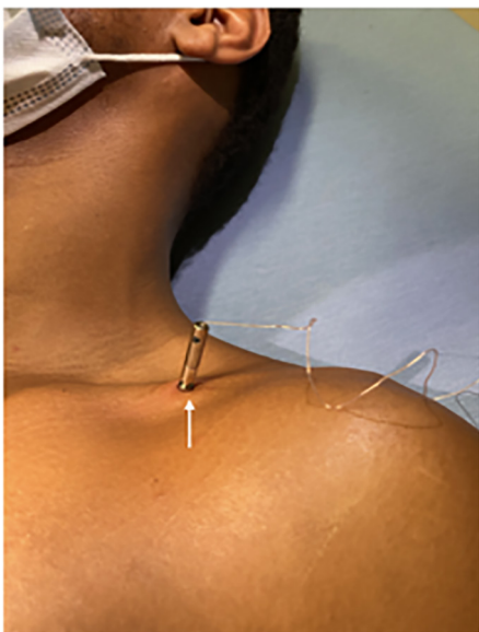
Image 1. Taser barb embedded in the left, anterior, mid clavicle (white arrow).

Prior to the procedure, ketorolac 15 milligrams was administered intravenously. The surrounding skin was prepped with a betadine solution. Anesthesia was achieved via local infiltration of a 50/50 mixture of 1% lidocaine and 0.5% bupivacaine without epinephrine at the periosteum and along the track of the barb. The patient reported excellent pain relief and complete anesthesia at the site of the clavicular foreign body. A pair of vise-grip locking pliers was then used to grasp the metal cylinder, and a 10-cubic centimeter (cc) syringe was placed under the pliers, adjacent to the cylinder. The syringe was used as a fulcrum to lever the barb out of the bone (Image 2). The taser barb was easily removed and the patient tolerated the procedure with no bleeding or additional trauma noted to the surrounding soft tissues. A post-procedure radiograph showed no fracture but did demonstrate a small retained foreign body of the taser-barb tip in the clavicle.