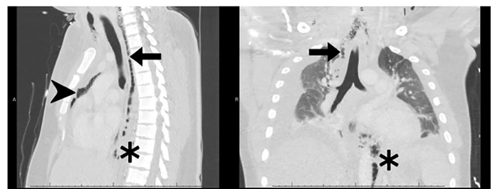
Image 3. Computed tomography of the chest with intravenous contrast in coronal (right) and sagittal (left) planes, demonstrating mediastinal air and fluid tracking from the retropharyngeal space (arrows), extensive pneumo-mediastinum (arrowhead), and retrocrural subcutaneous gas (asterisks).

Thoracic surgery and oral and maxillofacial surgery were emergently consulted. Following the surgeons' bedside evaluation, the patient was taken to the operating room (OR). While in the ED, the patient remained normotensive and did not