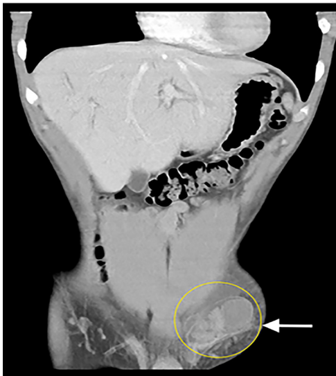
Image 2. Coronal reconstruction computed tomography demonstrating the cryptorchid testicle in the left inguinal canal (circle).