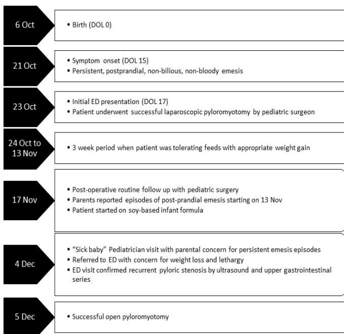
Figure 1. Timeline of events for an infant with recurrent hypertrophic pyloric stenosis. Day of Life (DOL), Emergency department (ED).

The clinical signs and symptoms of pyloric stenosis are generally consistent and require appropriate evaluation even if a child has already what is typically definitive intervention.