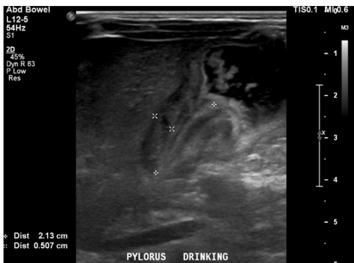
Image. Ultrasound of pylorus with child drinking demonstrating hypertrophy (length 2.13cm and width 0.5cm) with minimum passage of fluids through the pylorus.

calculate bicarbonate and base excess due to a pH more than 7.70. The patient underwent an abdominal ultrasound in the ED, which suggested IHPS with an enlarged pyloric channel measuring 2.1 cm and a thickened muscle measuring 0.5 cm, again with minimal passage of fluids through the pylorus (Image 1). The surgical team was consulted for the abnormal laboratory and ultrasound findings, but due to the possibility of postoperative edema or residual abnormal external pylorus measurements, the consultant recommended further imaging to conclusively determine pyloric stenosis. The child was admitted for fluid resuscitation and electrolyte replacement. An upper GI series performed the same day confirmed the diagnosis of IHPS when there was lack of contrast passing from the stomach to the duodenum. The patient received a solution of intravenous 5%, dextrose, half normal saline, and 40 mEq potassium chloride at maintenance until electrolytes and intravascular volume