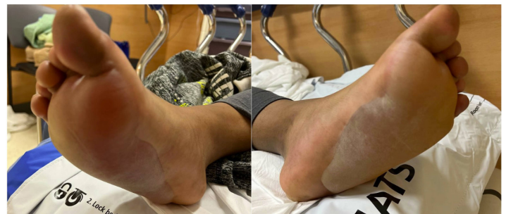
Image 2. Bilateral partial-thickness frostbite present on patient 2. Large serous blisters are present.