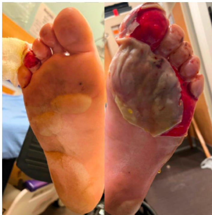
Image 1. Bilateral partial-thickness frostbite on patient 1 with a broken serous blister on the left.

Patient 1 was discharged home after debridement in the ED, while patients 2 and 3 were admitted for further