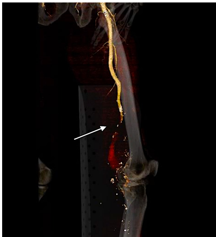
Image 1. Computed tomography angiography volume-rendering technique reconstruction of the left lower extremity in sagittal view demonstrating superficial artery occlusion with popliteal artery aneurysm rupture (arrow) and lack of arterial contrast enhancement distally.

Our patient was diagnosed with an acute ruptured popliteal aneurysm, likely secondary to blunt trauma after falling from ground level. The incidence of popliteal aneurysm rupture is rare, estimated at 1% in males aged 65-80 years. 1 To date, 58 cases of popliteal artery aneurysm rupture have been described in the literature, and only seven have been documented secondary to trauma. 2,3 Recognition of a ruptured popliteal artery aneurysm is the most difficult aspect in management, as ischemic signs may be absent, leading to alternative diagnoses, such as venous thrombosis, ruptured synovial cysts, and soft tissue sarcomas. 5 The most common signs and symptoms of a ruptured popliteal aneurysm,